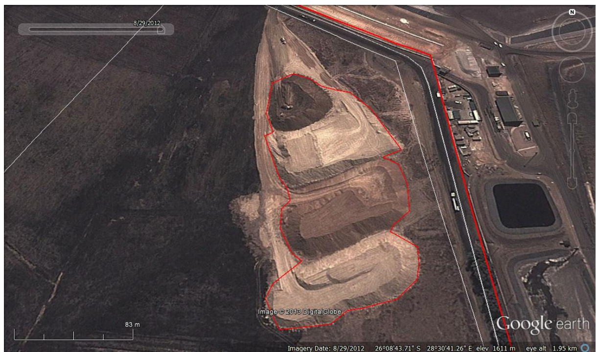
Site in August 2012

The following information has relevance to the motivation for exemption.