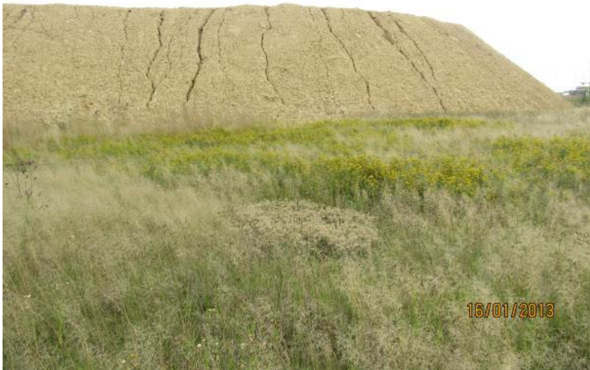
Clay stockpile viewed from the South