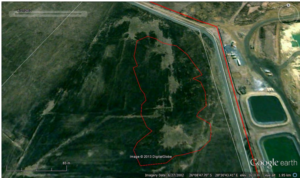
Site in 2002

Historically, as is visible in the series of Google Earth pictures (2002 to 2012) below, the site was agricultural land comprising natural grassland. No built structures or infrastructure of any kind was visible. Trenches that were dug across the area to drain the wet soils are visible. There is also evidence that sections of the site have been mowed at various times.