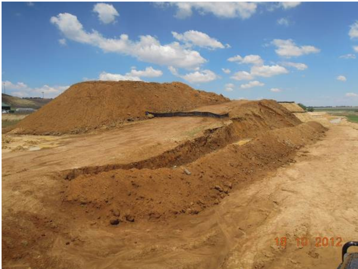
Topsoil Stockpile viewed from the North