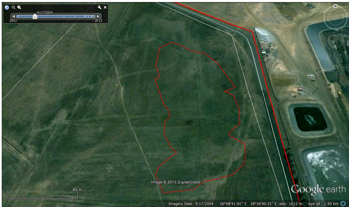
Site in 2004