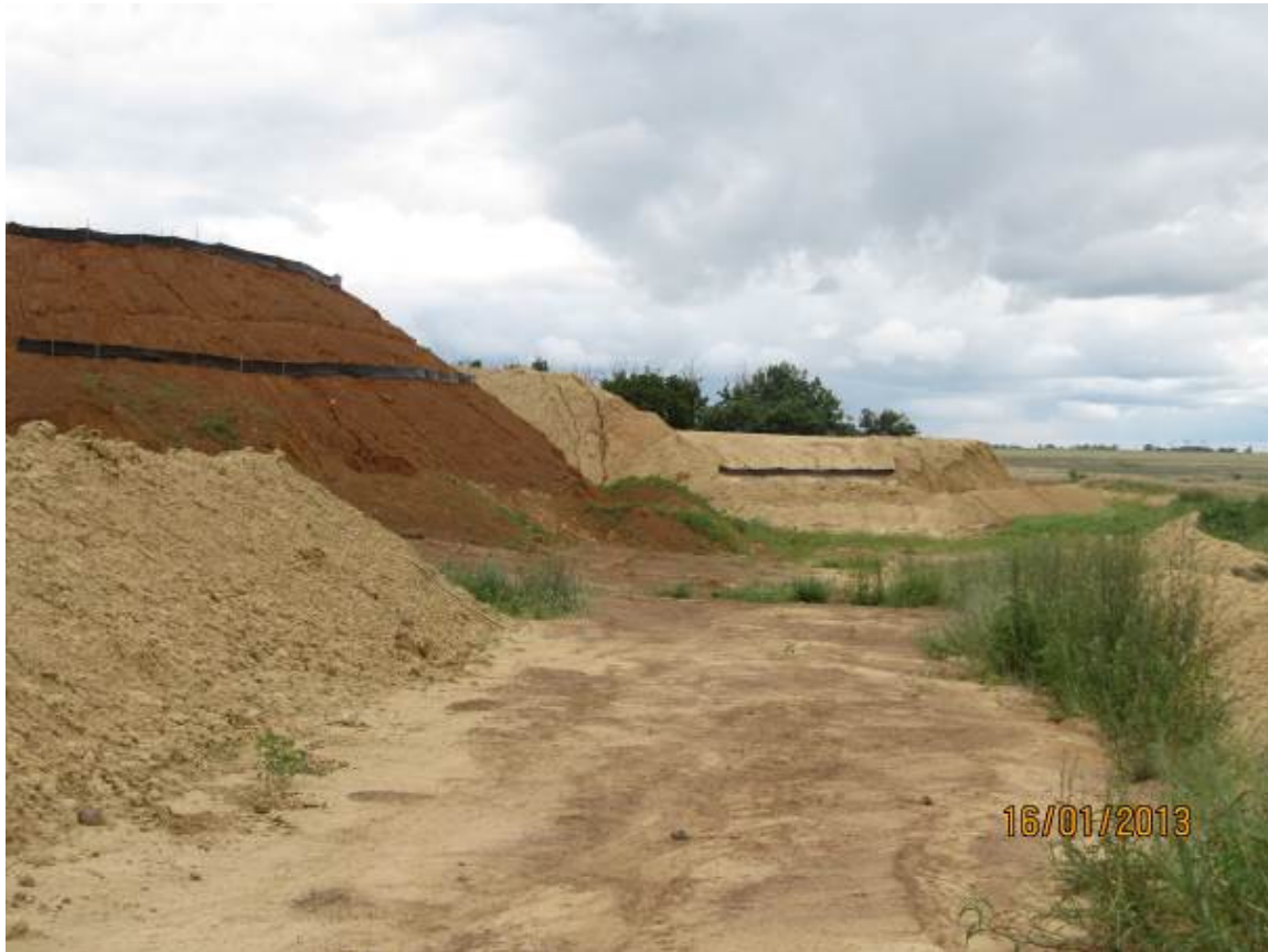
Western edge of the stockpiles (viewed from the North)