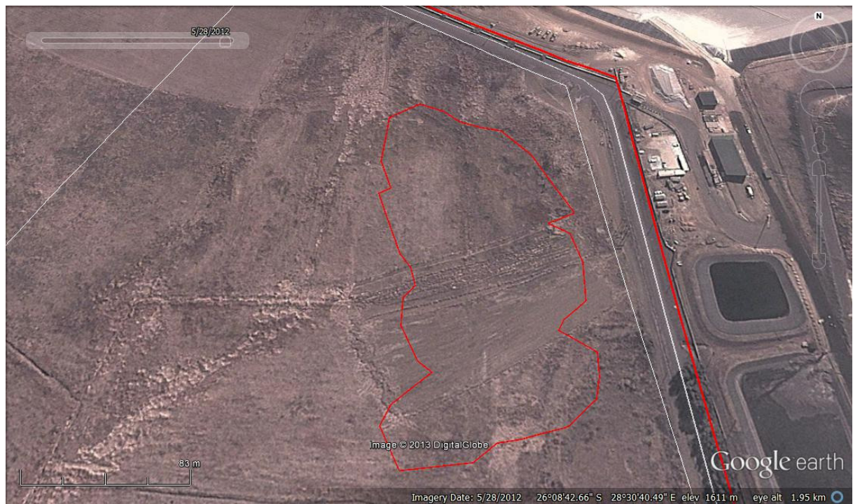
Site in May 2012