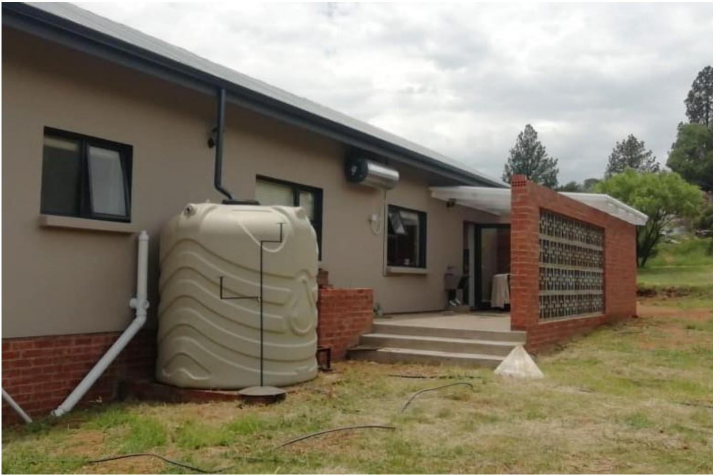
Rainwater tank at new dwelling