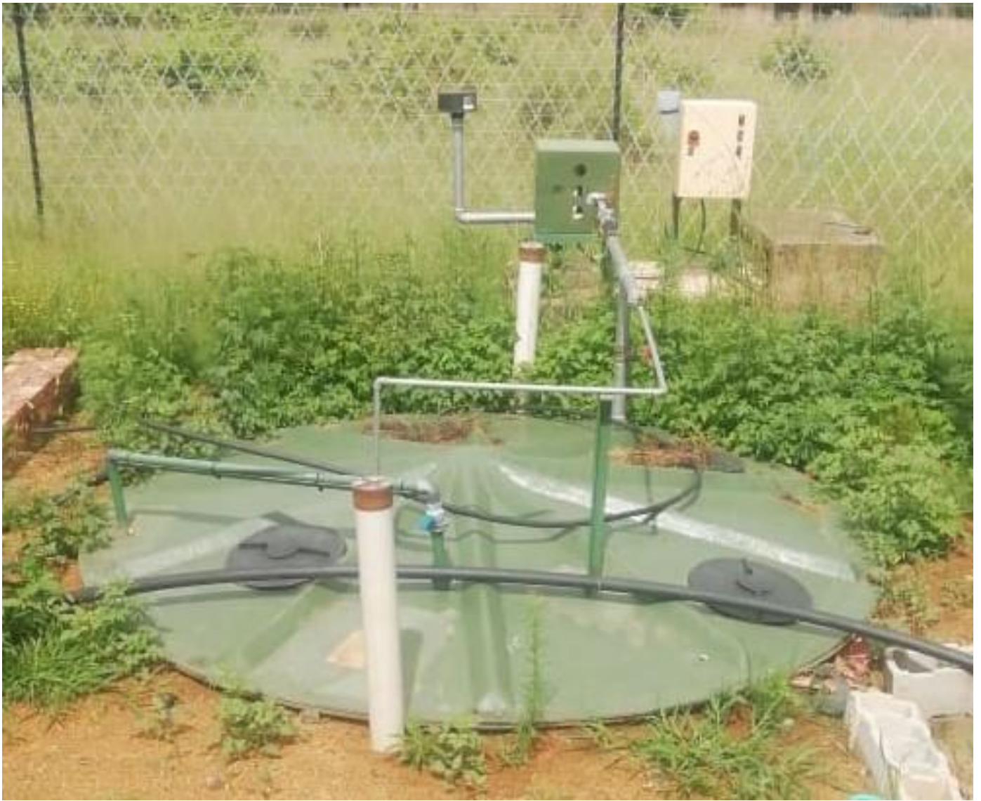
New 10kl sewerage tank