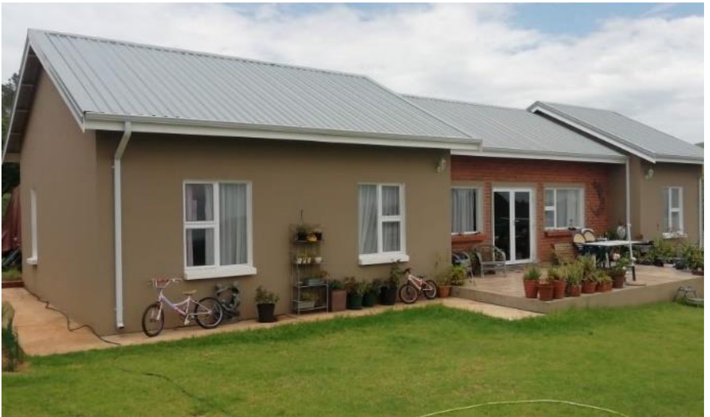
New dwelling from northern side