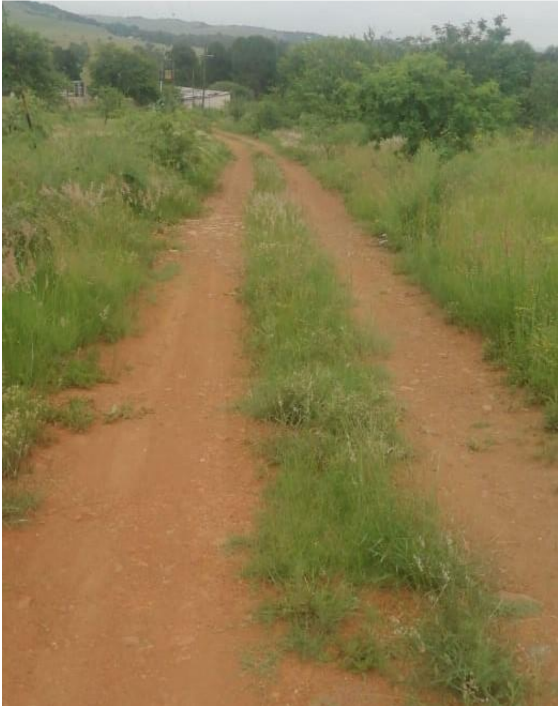
New 110 m road from east to west

The following photos were taken on the 8 th and 9 th of January 2020.