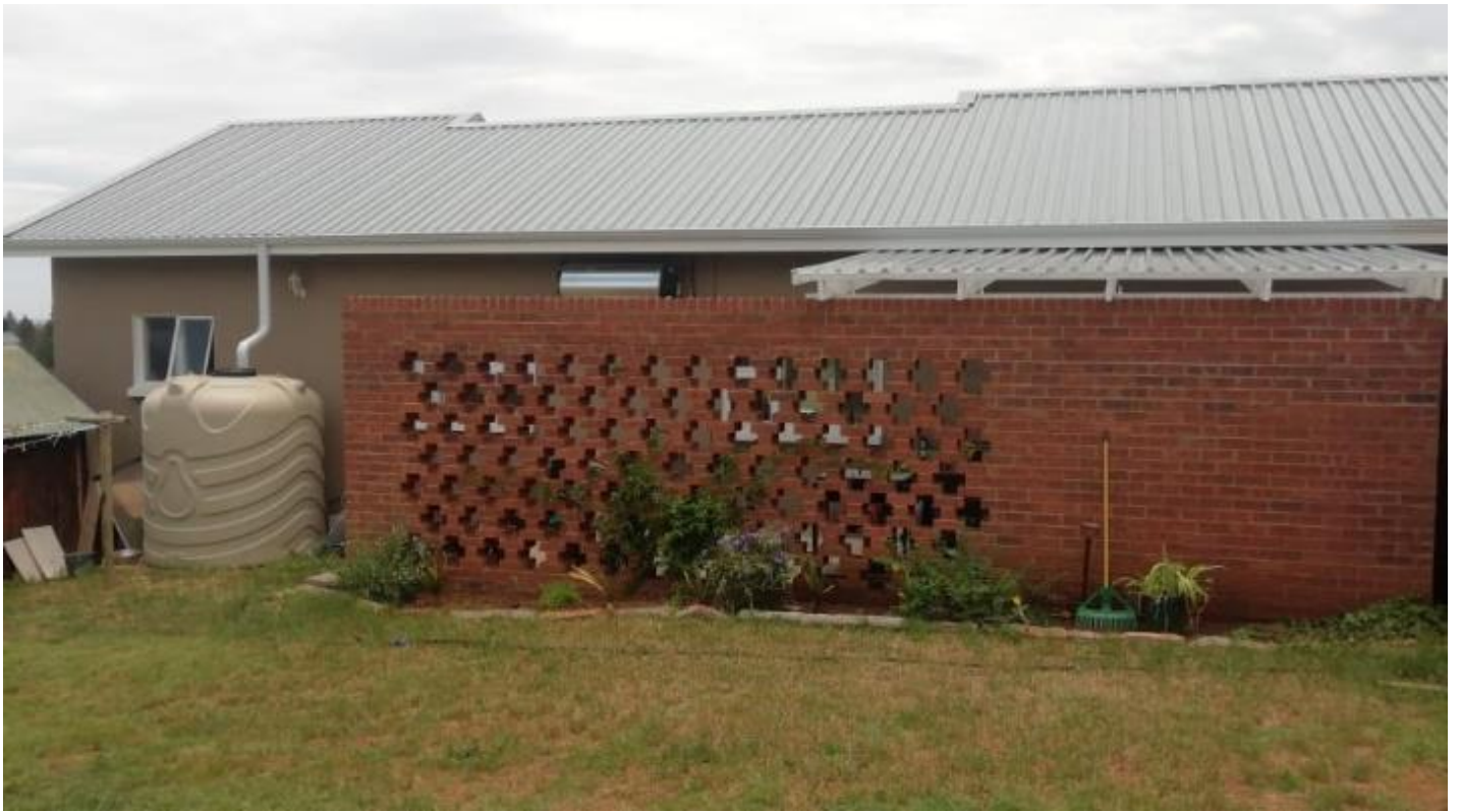
New dwelling from southern side