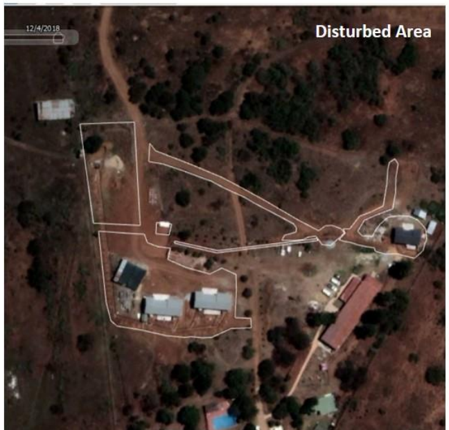
Figure 1. Map of the disturbed areas on site.

Coastal and Environmental Services (Pty) Ltd