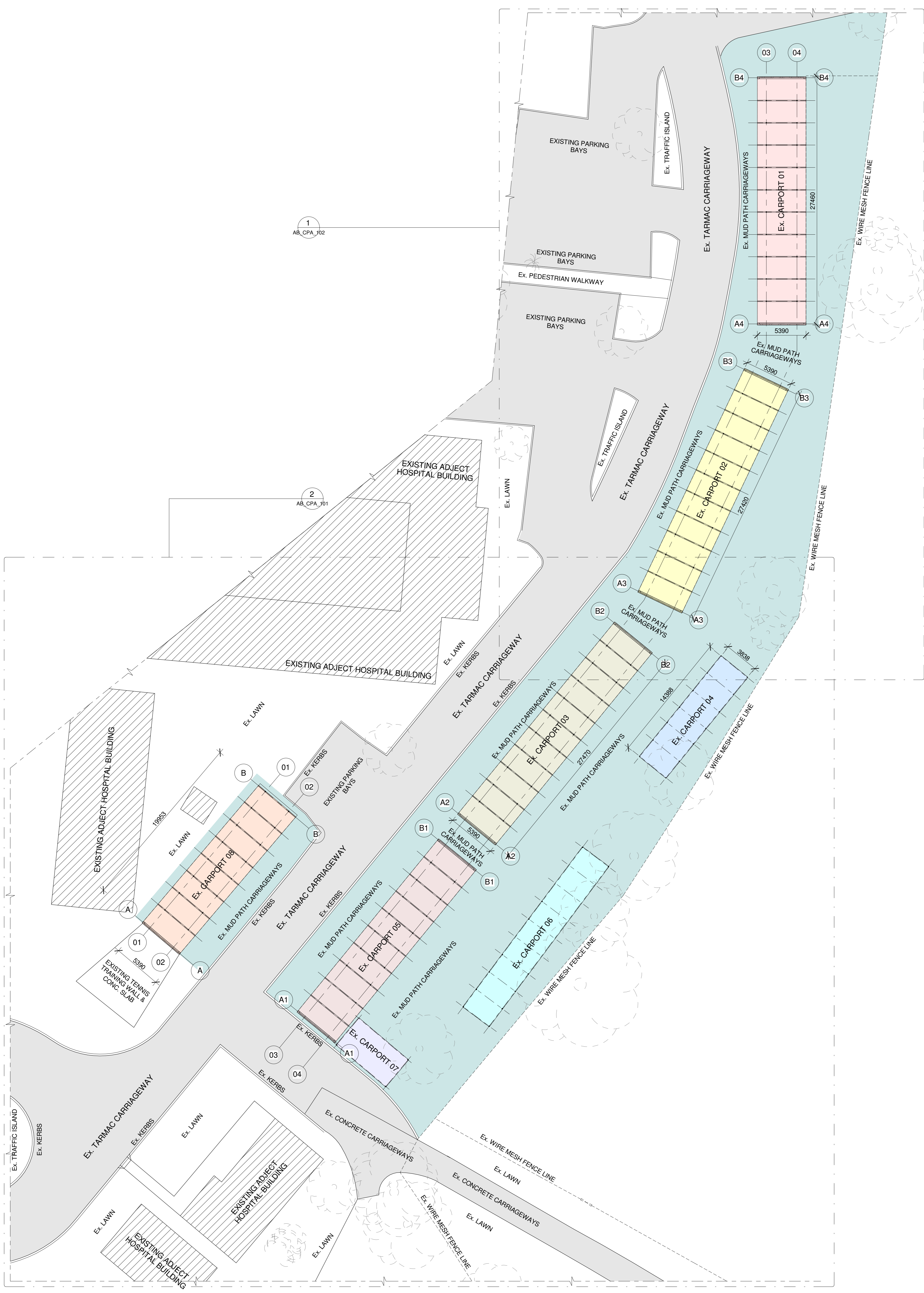
1 CAR PORTS - PORTION A - CONCEPT KEY REFERENCE PLAN 1:200