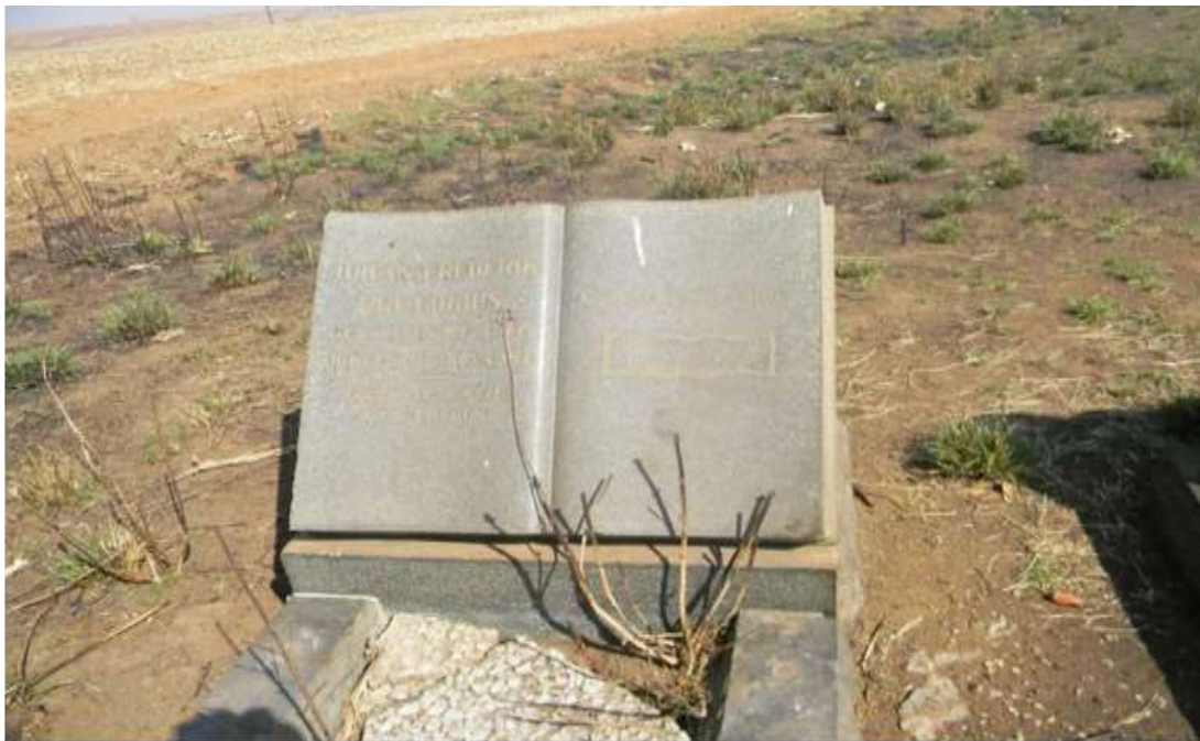
Figure 1 and 2: View of burial site within the mining area

Figure 1 and 2: View of inscribed tombstones identified on the mining area