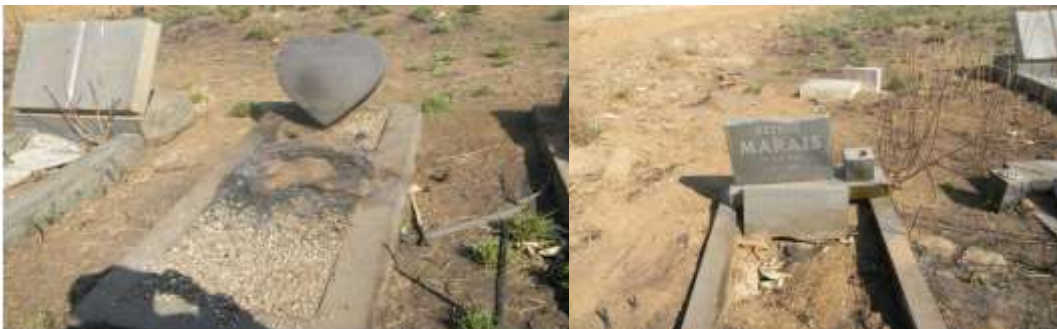
Figure 4 and 5

12. Geographical Situation of Site or Object (Please mark general location of grave(s) on a photostat of a 1:50 000 map (NB)