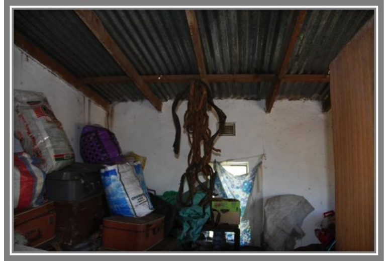
FIGURES 22-25 NORTHERN ROOM INTERIOR DETAIL.