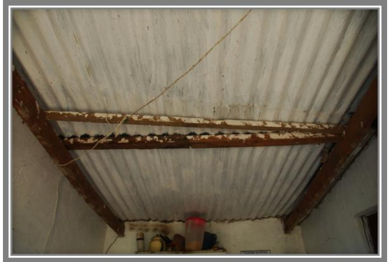
FIGURE 20 ENTRANCE FOYER ROOF INTERIOR.