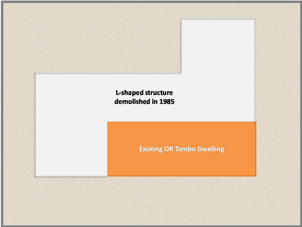
FIGURE 2 POSITION OF OR TAMBO DWELLING RELATIVE TO EARLIER STRUCTURE