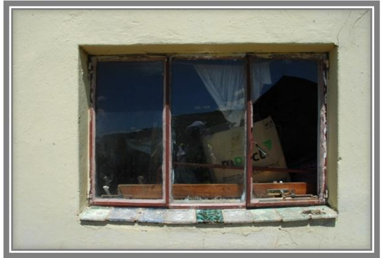
FIGURES 11 AND 12 NORTHERN AND NORTH-EASTERN WINDOW EXTERIORS, L TO R.