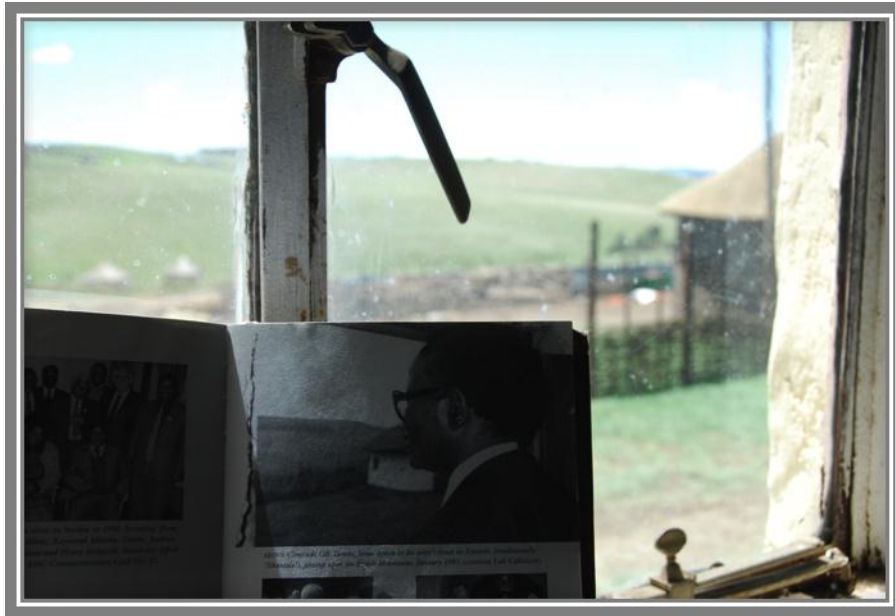
FIGURE 30 SOUTHERN ROOM WINDOW INTERIOR JUXTAPOSED WITH IMAGE IN FIGURE 31