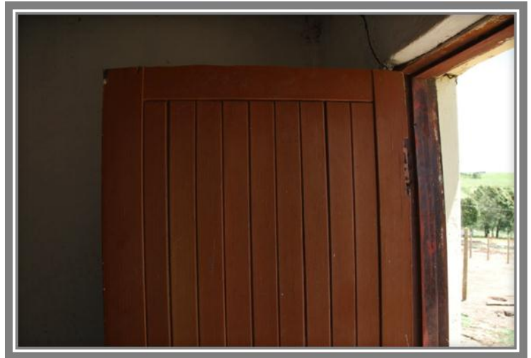
FIGURES 15-18 FRONT DOOR WITH DETAIL.