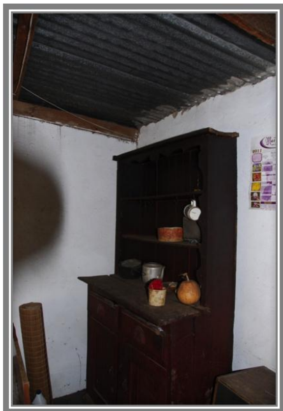
FIGURES 26-29 SOUTHERN ROOM INTERIOR DETAIL.