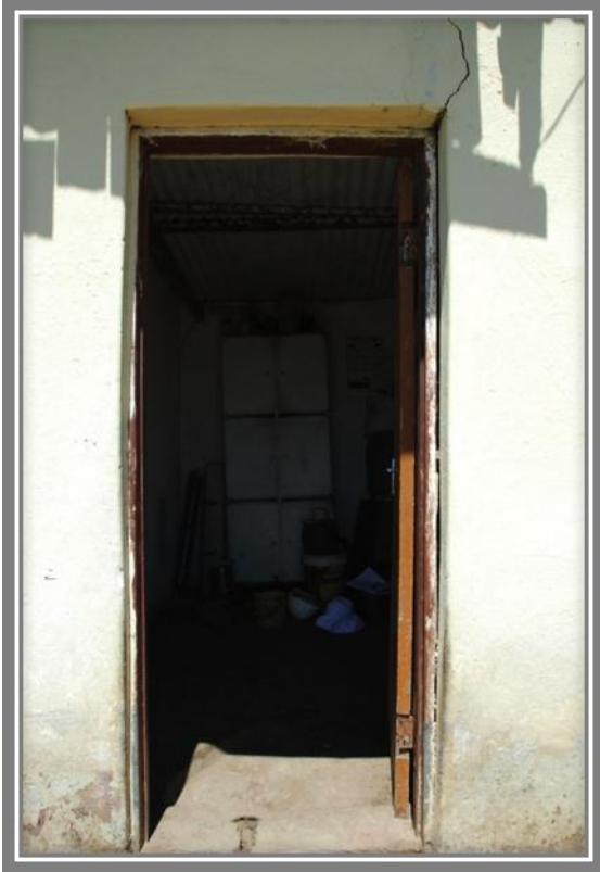
FIGURE 19 ENTRANCE FOYER.