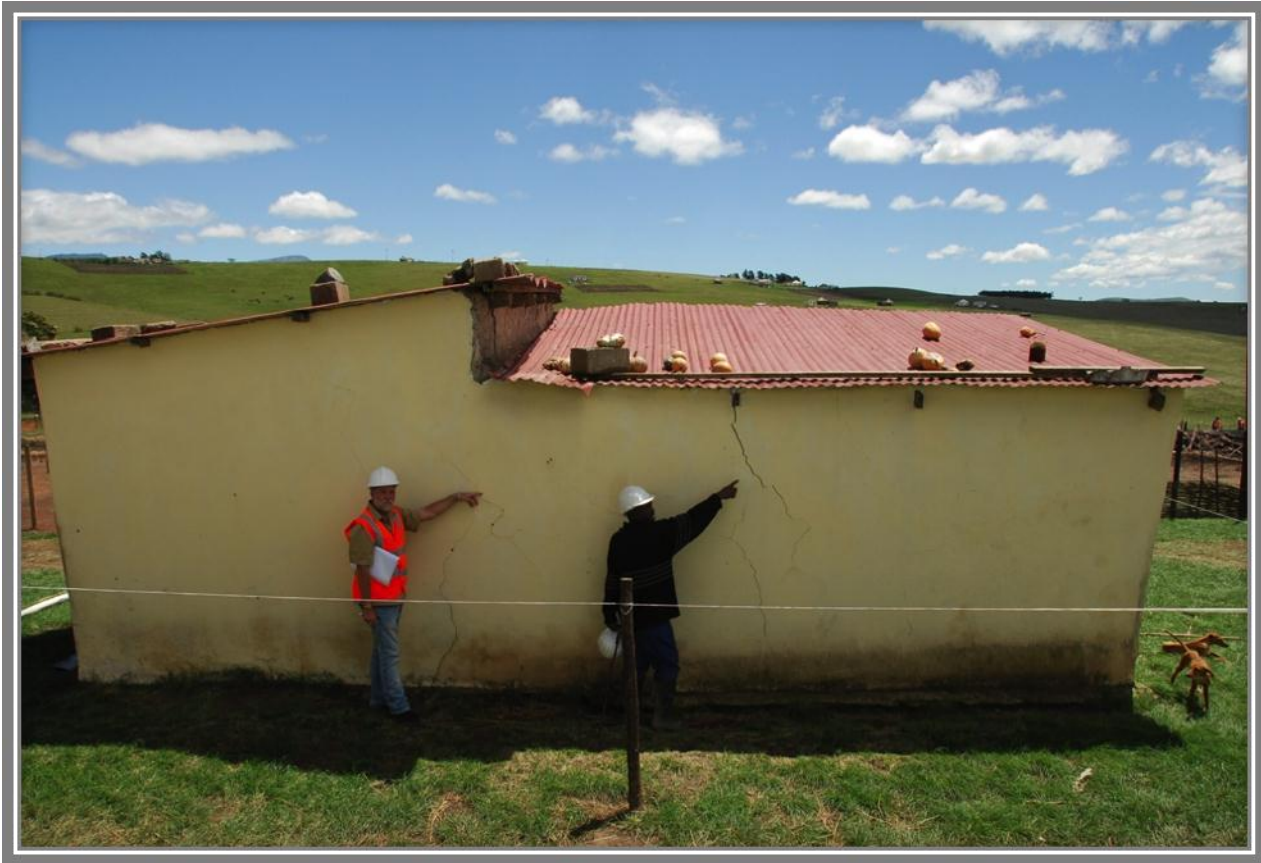
FIGURE 32 CRACKS IN WESTERN EXTERIOR WALL.