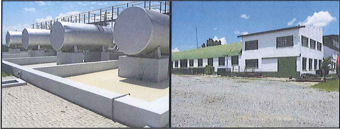
Existing structures and infrastructure: used oil storage tanks licenced (left) buildings (right)