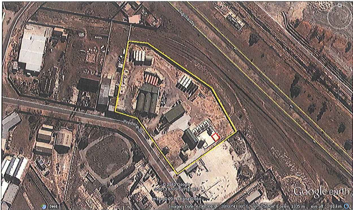
Aerial view indicating property boundary (yellow line) with existing structures and infrastructure, surroundings (industrial area) and location of wastewater treatment plant (red line)