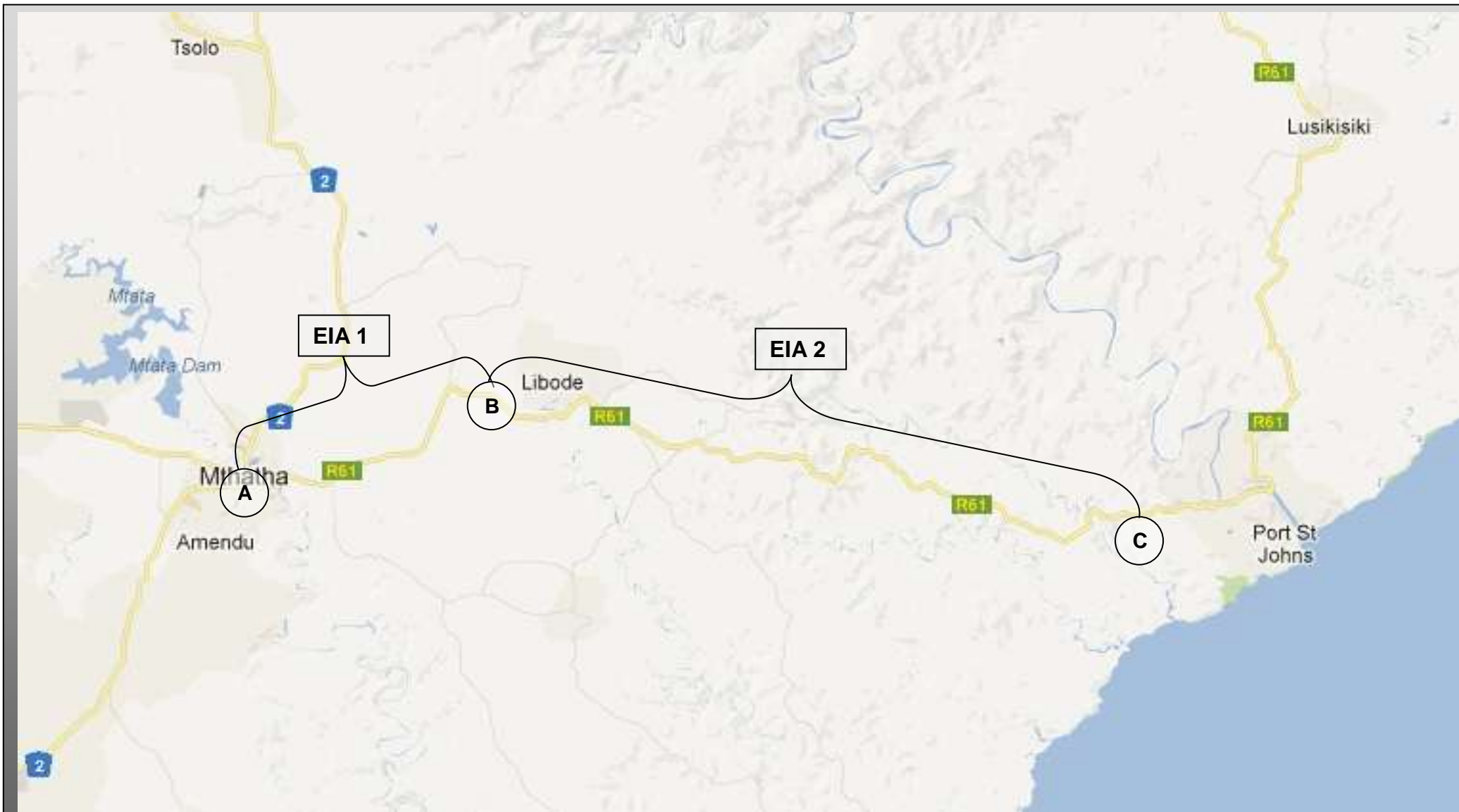
Figure 1: The two affected road sections between Mthatha and Port St Johns in the Eastern Cape. EIA 1 is from point A to B. EIA 2 is from point B to C.