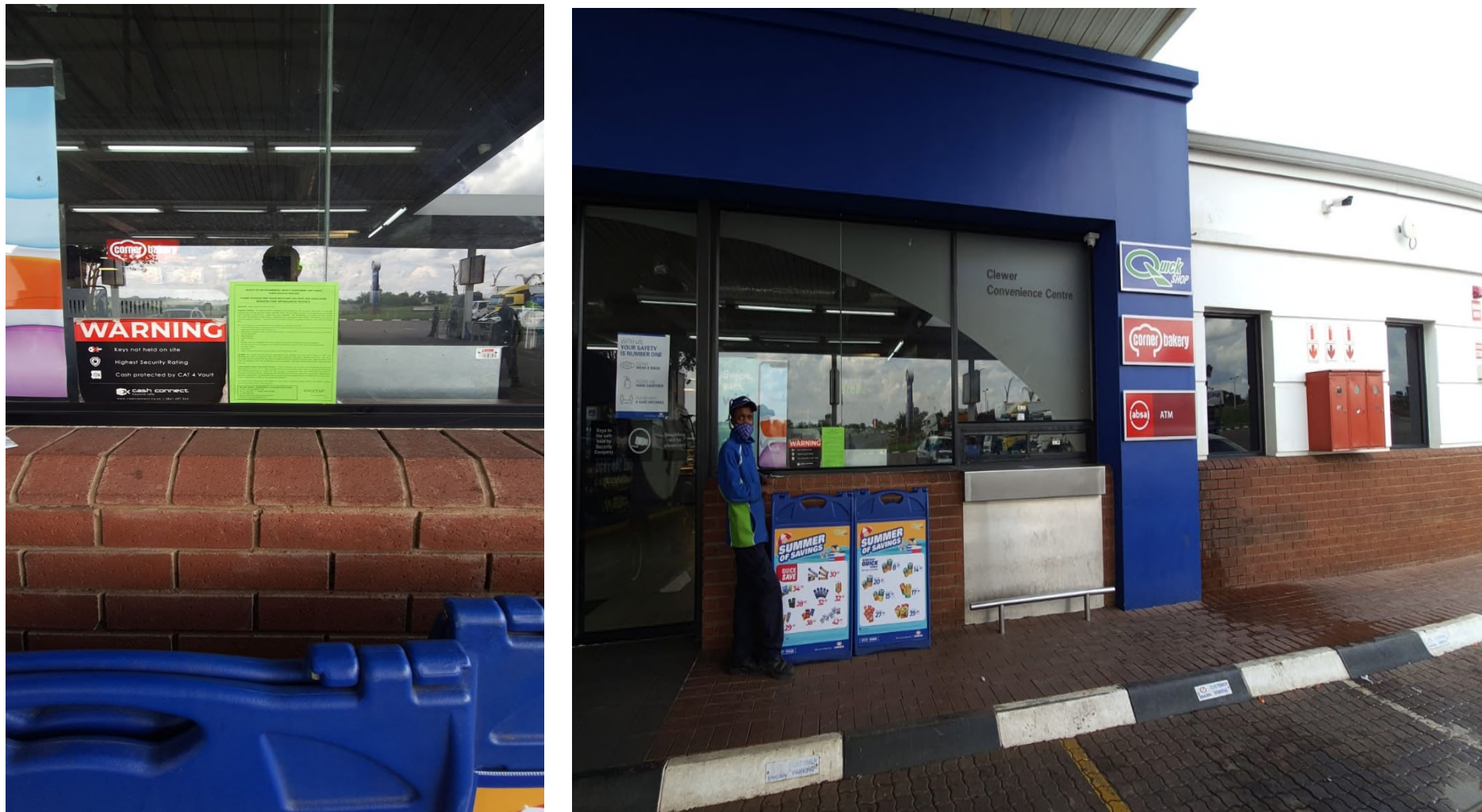
Figure 3: Process Notice 1 placed at Costas filling station, 3.4km away from Highveld Industrial Park, along the R104, Mpumalanga (25°52'29.3"S 29°07'49.8"E)