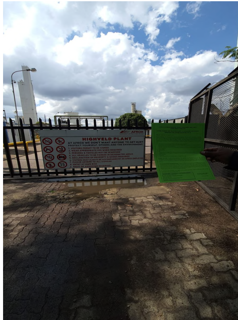
Figure 4: Process Notice 2 placed at the entrance to ASU Witbank Afrox, 2.2km away from Highveld Industrial Park, along the R104, Mpumalanga (25°52'47.2"S 29°05'17.5"E)