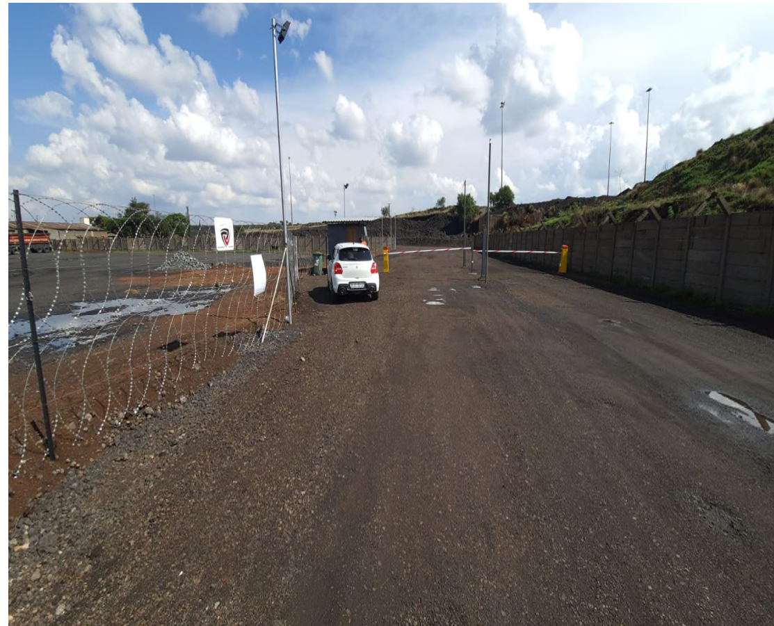
Figure 2: Site notice 2 placed at the entrance to Evraz Highveld Steel and Vanadium (non-weigh in gate) along the R104, Mpumalanga (25°52'59.7"S 29°04'42.6"E)