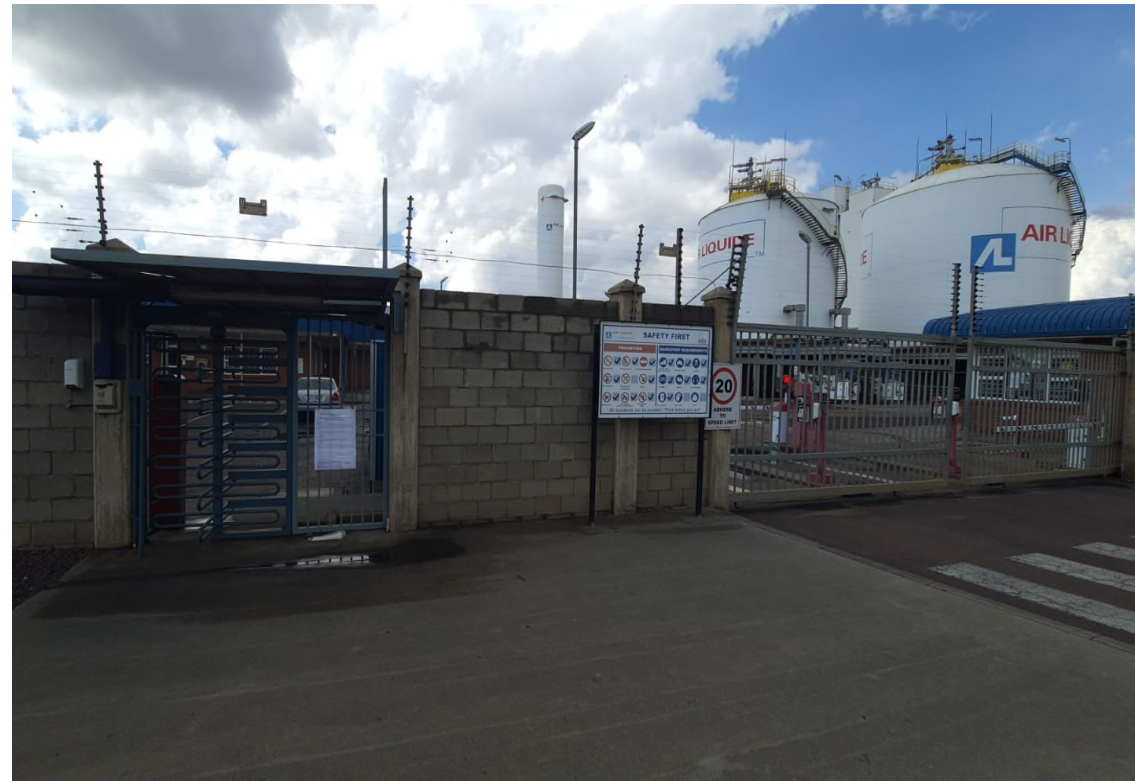
Figure 1: Site notice 1 placed at the entrance to Air Liquide Highveld ASU along the R104, Mpumalanga (25°52'49.2"S 29°05'06.5"E)