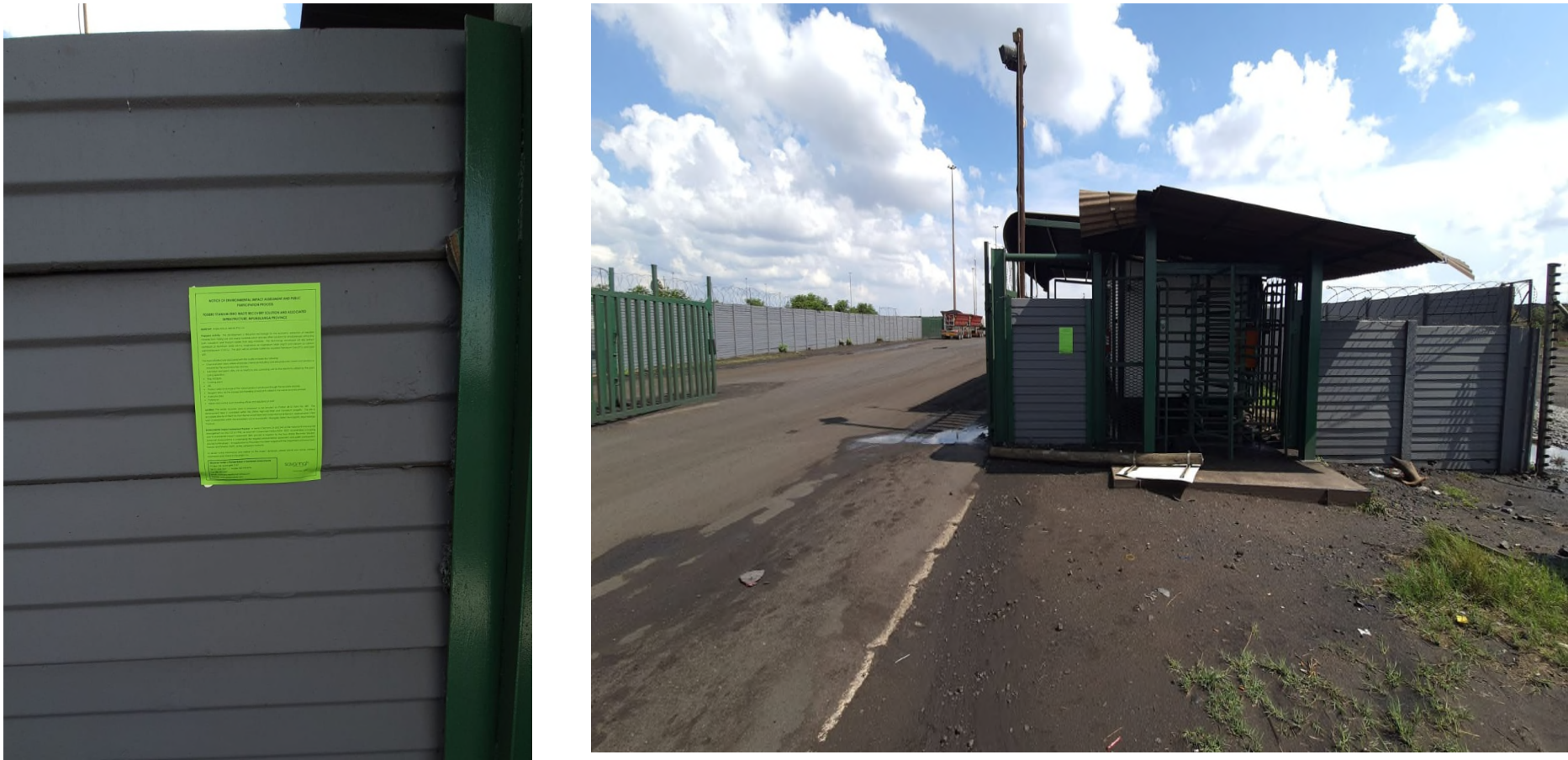
Figure 5: Process Notice 3 placed at the entrance to Evraz Highveld Steel and Vanadium (weigh in gate) along the R104, Mpumalanga (25°52'54.9"S 29°04'56.0"E)