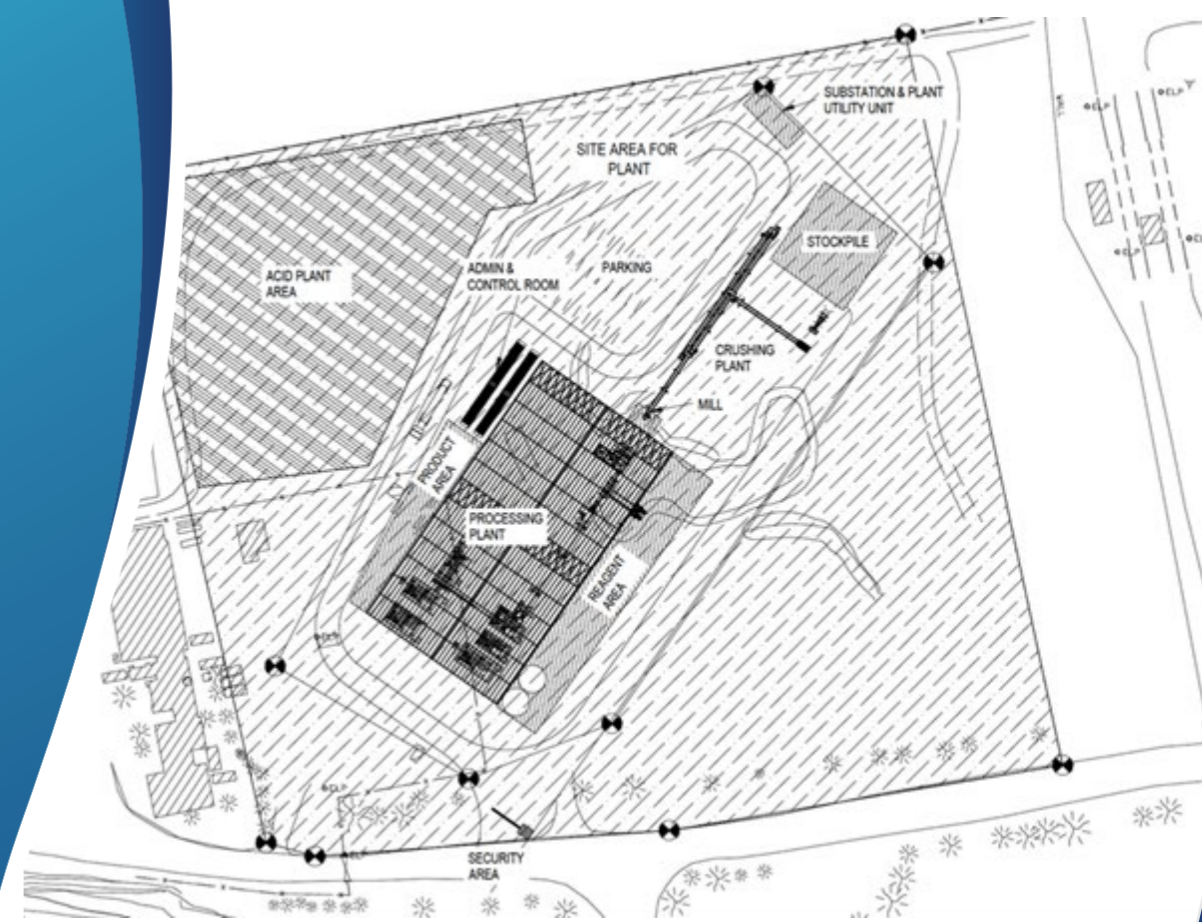
Plant layout map

Operation of the plant is anticipated for 24 hours per day, 365 per year (i.e. non-stop operation) and will utilise the slag produced by the Highveld Steel operations. The process offers solutions for simultaneously extracting both vanadium and titanium oxide from slag materials. The technology developed by the Fodere Group is also demonstrated to extract aluminium as aluminium oxide (Al 2 O 3 ), magnesium as magnesium oxide (MgO) and calcium as calcium sulphate/gypsum (CaSO 4 )