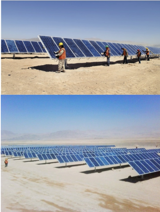
Figuur 1: FV-sonkragaanleg

Die FV-panele is ontwerp om vir meer as 20 jaar ononderbroke, onbeman en met min instandhouding in bedryf te staan.