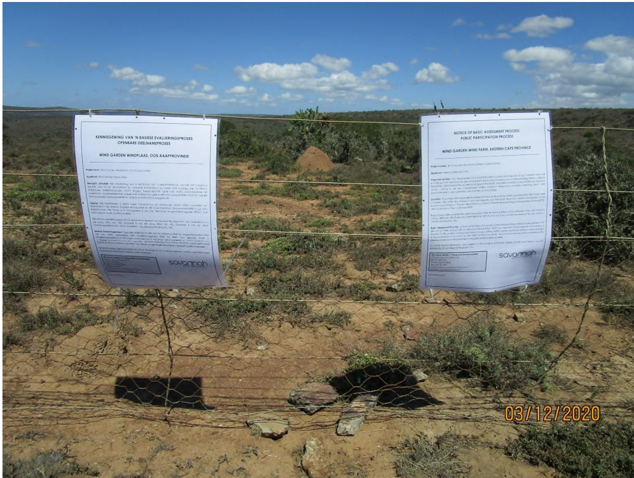
Site Notice #1: Placed at the boundary fence of the Farm 132, Portion 1, along the R344

Co-ordinates: 33°12'11.08"S & 26°24'24.78"E