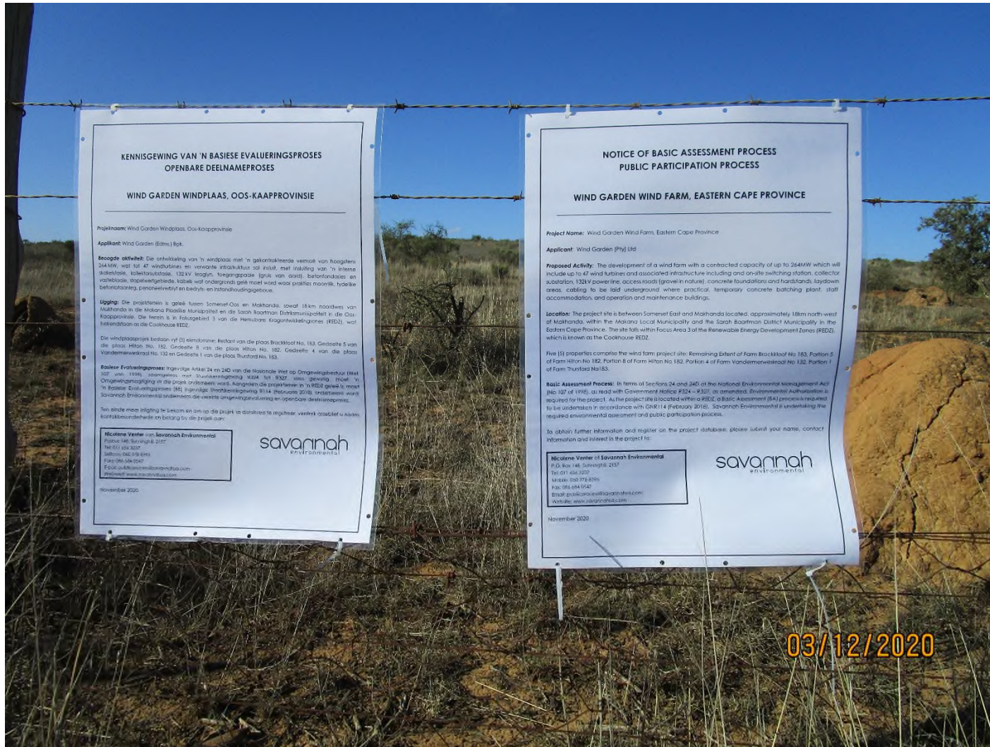
Site Notice #4: Placed at the boundary fence of Farm 182, Portion 11, along the gravel road south of the R400 between Makado & Riebeeck East

Co-ordinates: 33°14'33.31"S & 26°21'1.43"E