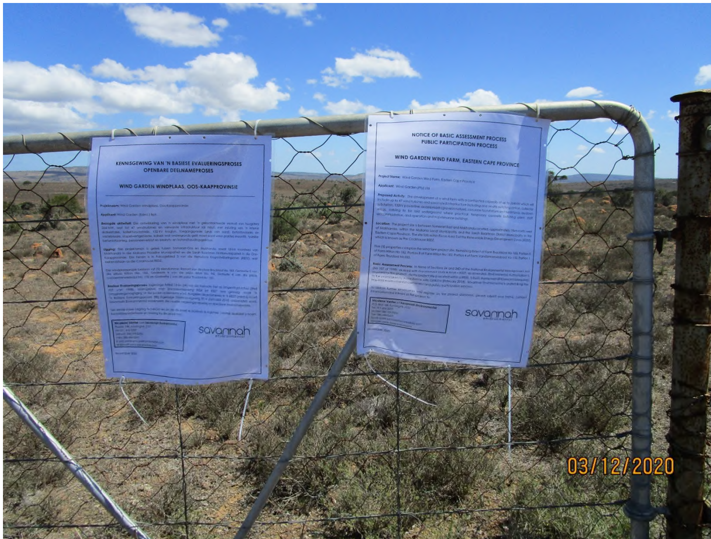
Site Notice #3: Placed at the intersection of the R400 and R350

Co-ordinates: 33°12'35.54"S & 26°22'5.66"E