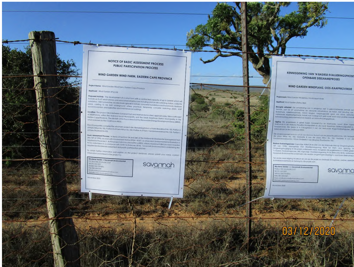
Site Notice #5: Placed at the farm entrance and boundary fence along the R350 between Bedford, Riebeeck East and Makado

Co-ordinates: 33°11'37.80"S & 26°21'30.96"E