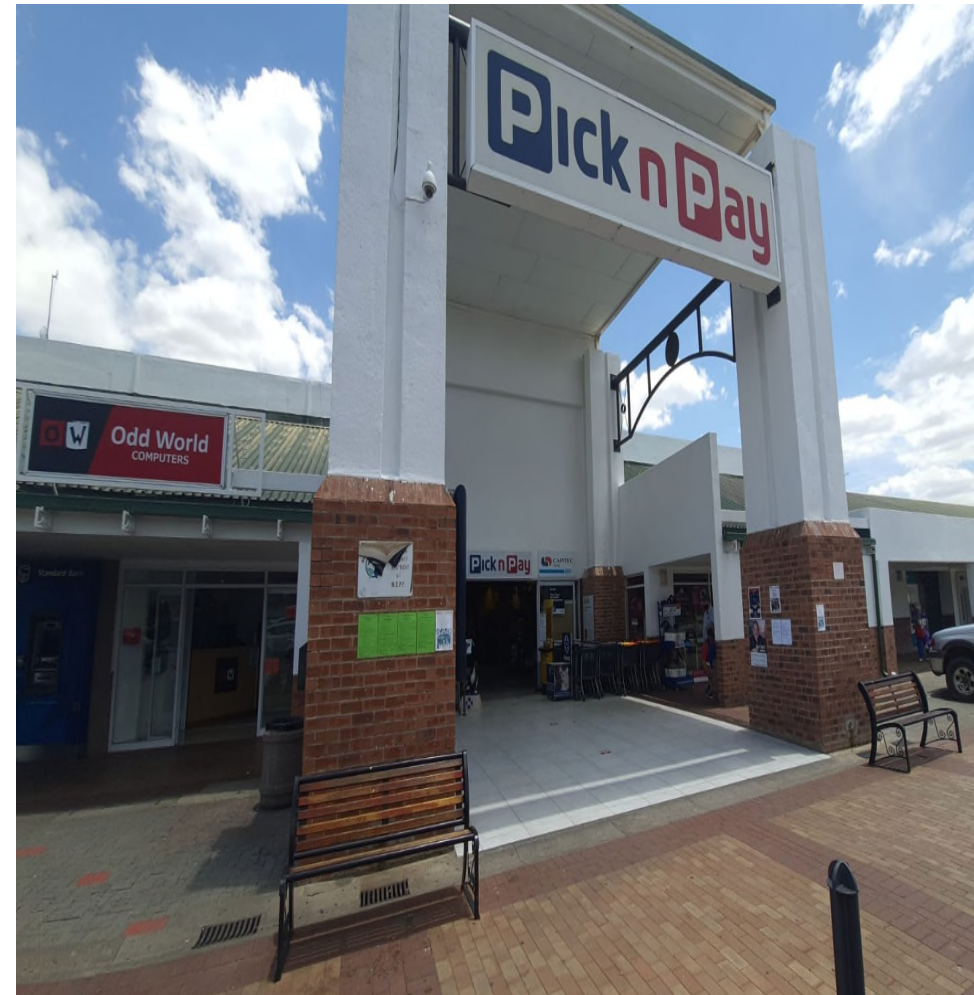
Figure 1: Process Notice 1 placed at the Panarama Plaza (within the closest Town), 10km away from the entrance to the Remaining Extent of the Farm Rondavel Noord 1475 and Remaining Extent of the Farm Rondavel 627, Free State Province (27°40'38.5"S 27°14'22.4"E)