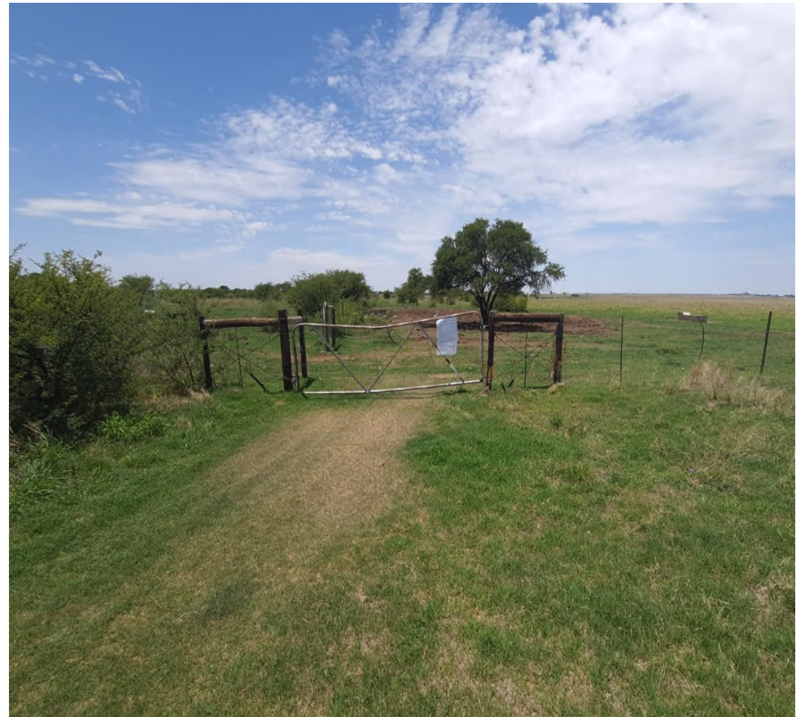
Figure 1: Site notice 1 placed at the entrance to Remaining extent of the Farm Vrede 1152 and Portion 1 of the Farm Uitval 1104, Free State Province (27°44'48.0"S 27°08'40.8"E)