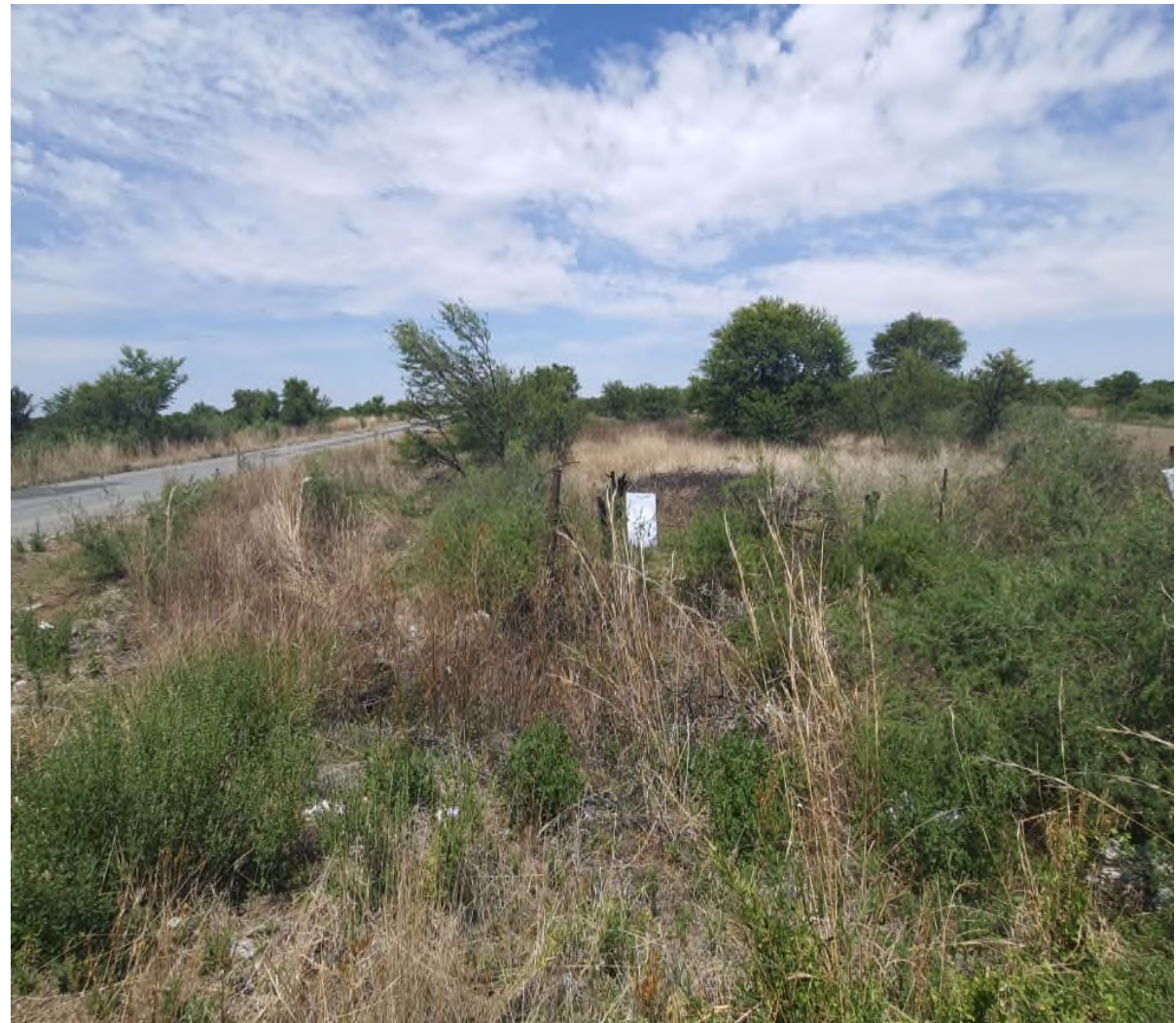
Figure 2: Site notice 2 placed at the intersection of the two roads that run parallel to the Remaining extent of the Farm Vrede 1152 and Portion 1 of the Farm Uitval 1104, Free State Province (27°43'29.4"S 27°10'55.8"E)