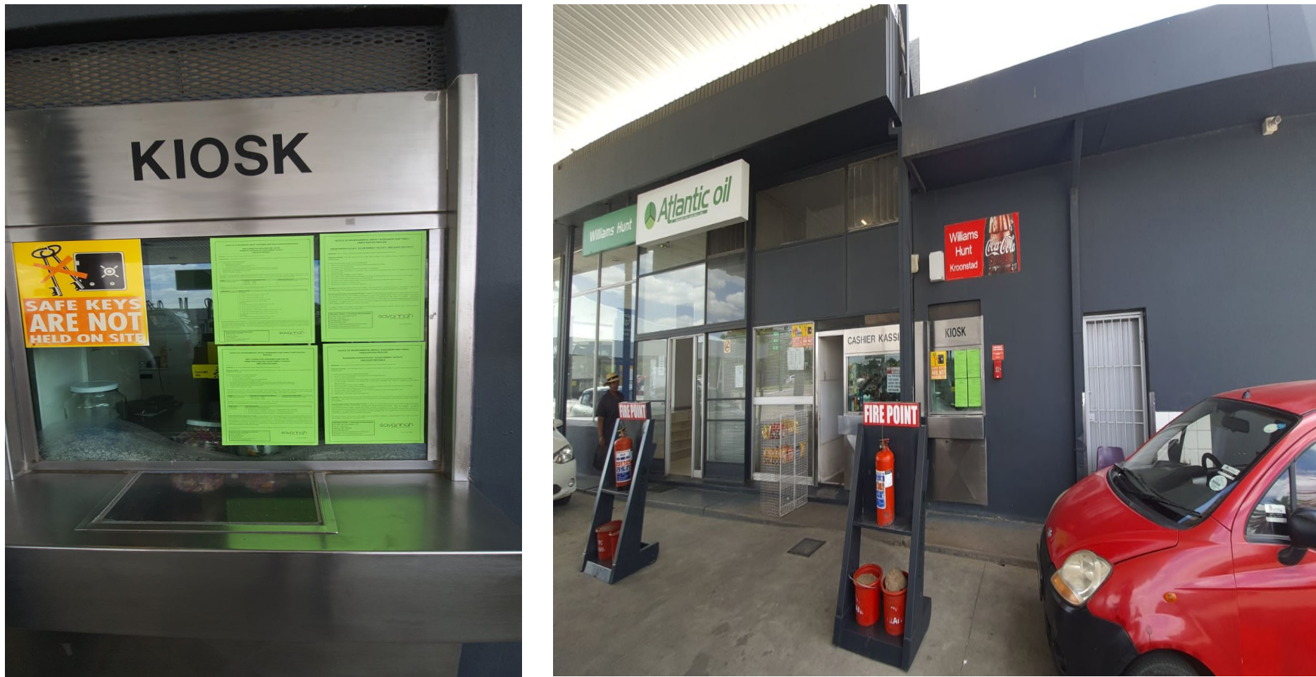
Figure 3: Process Notice 3 placed at the Atlantic Oil Garage (within the closest Town), 12.5km away from the entrance to the Remaining Extent of the Farm Rondavel Noord 1475 and Remaining Extent of the Farm Rondavel 627, Free State Province (27°39'47.6"S 27°13'40.2"E)