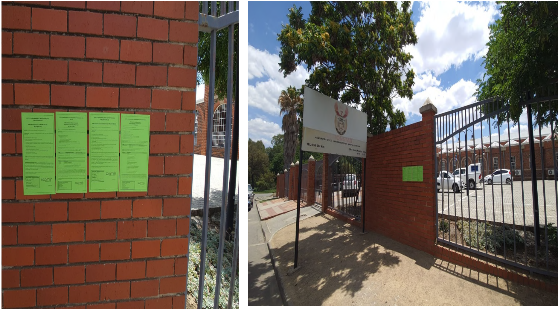
Figure 2: Process Notice 2 placed at the Kroonstad Magistrate Court (within the closest Town), 11km away from the entrance to the Remaining Extent of the Farm Rondavel Noord 1475 and Remaining Extent of the Farm Rondavel 627, Free State Province (27°40'11.6"S 27°14'02.1"E)