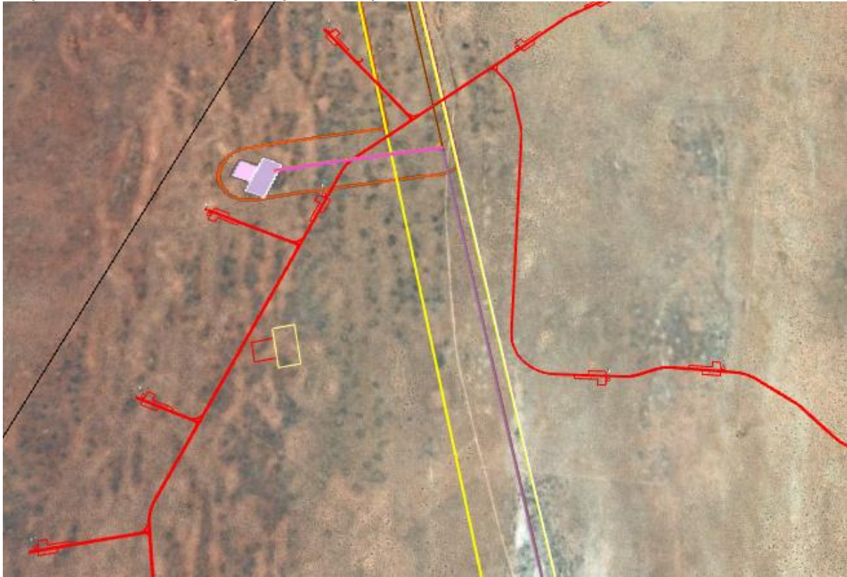
Map 3-2: Zonnequa Facility EA (Amended) vs Grid EA

Map 3-2 presents the changes in corridor width, location of the substation/ switching station position, and expansion of the corridor/ envelope size around Gromis MTS.