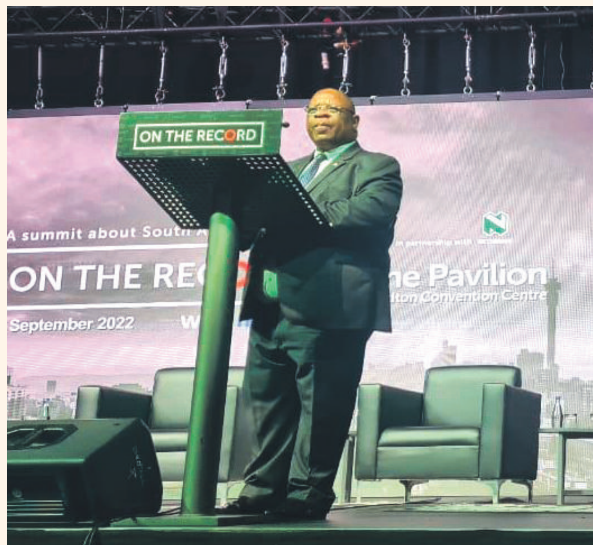
Hoofregter Raymond Zondo gister.

Die regstelsel staan gereed om sy deel te doen, maar daar is nog gapings in die stelsel.