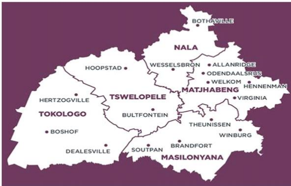
Figure 3: Local Municipalities of Lejweleputswa District Municipality