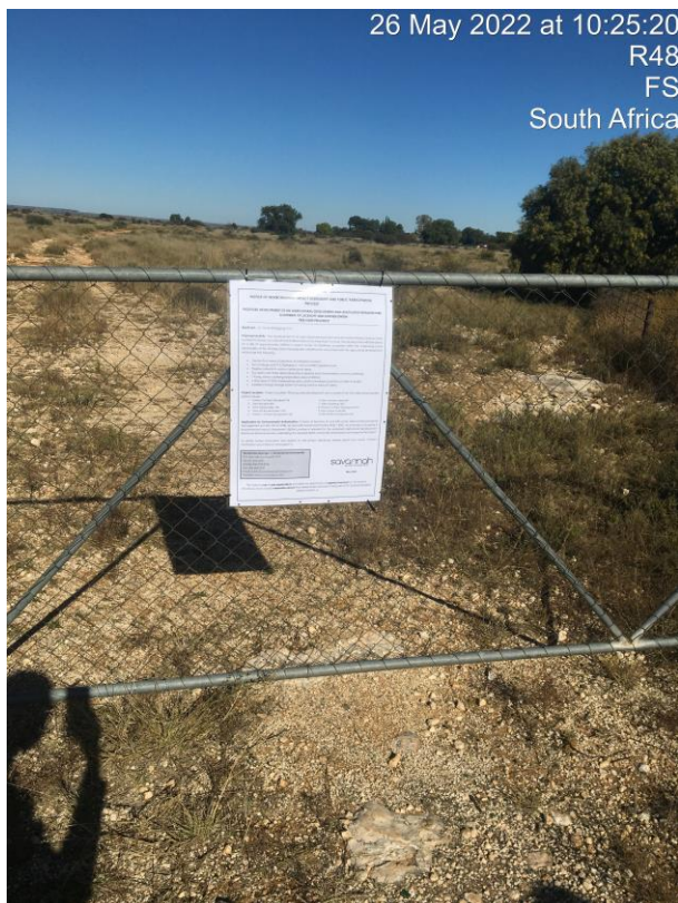
Site 2 – 29.19.20.529S; 25.2.42.11 E