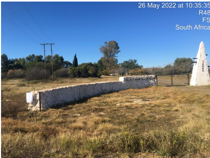
Site 4 – 29.19.31.789S; 25.2.14.059 E