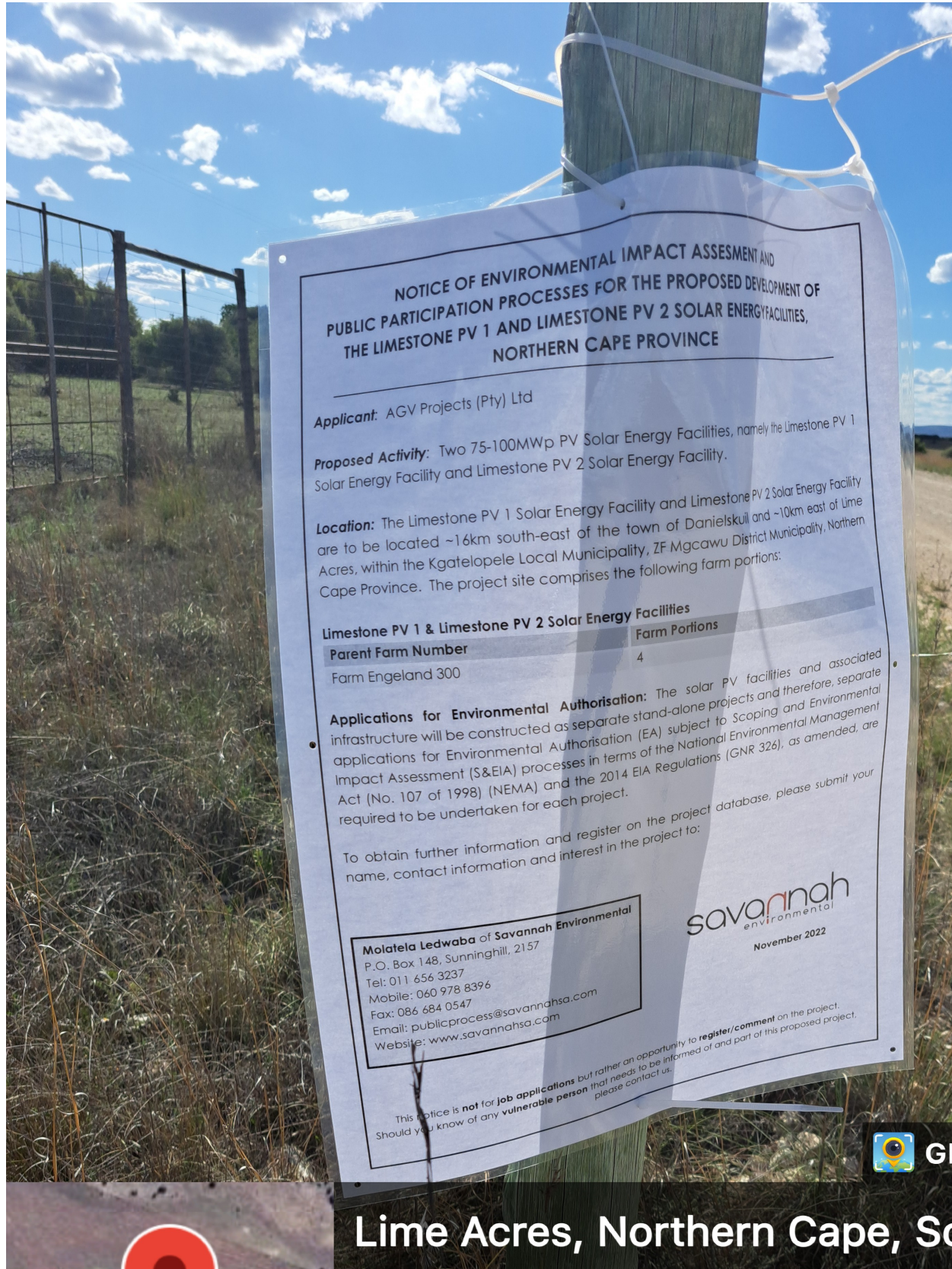
Lime Acres, Northern Cape, So