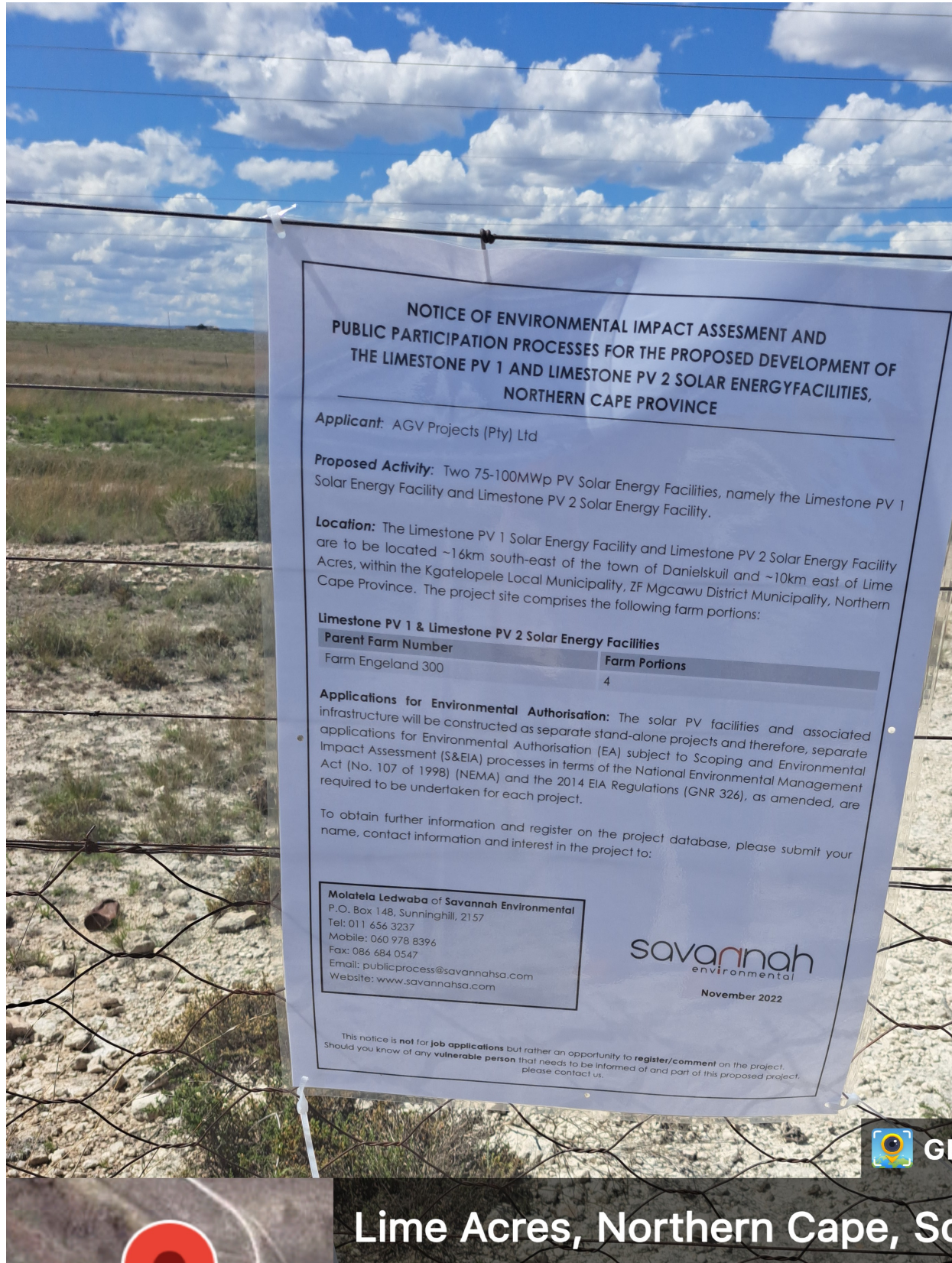
Figure 2: Site notice 2 placed near the entrance fence to Portion 4 of Farm 300 Engeland