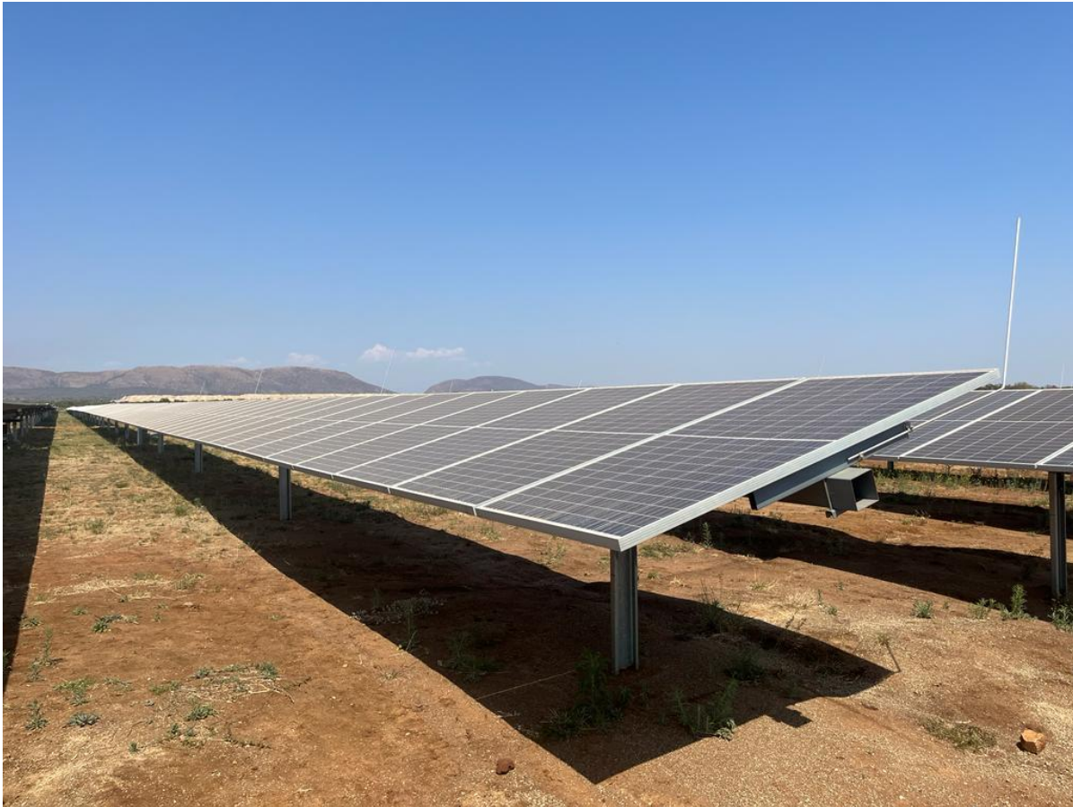
Photograph 1-1 Typical Photovoltaic Solar Energy Facility