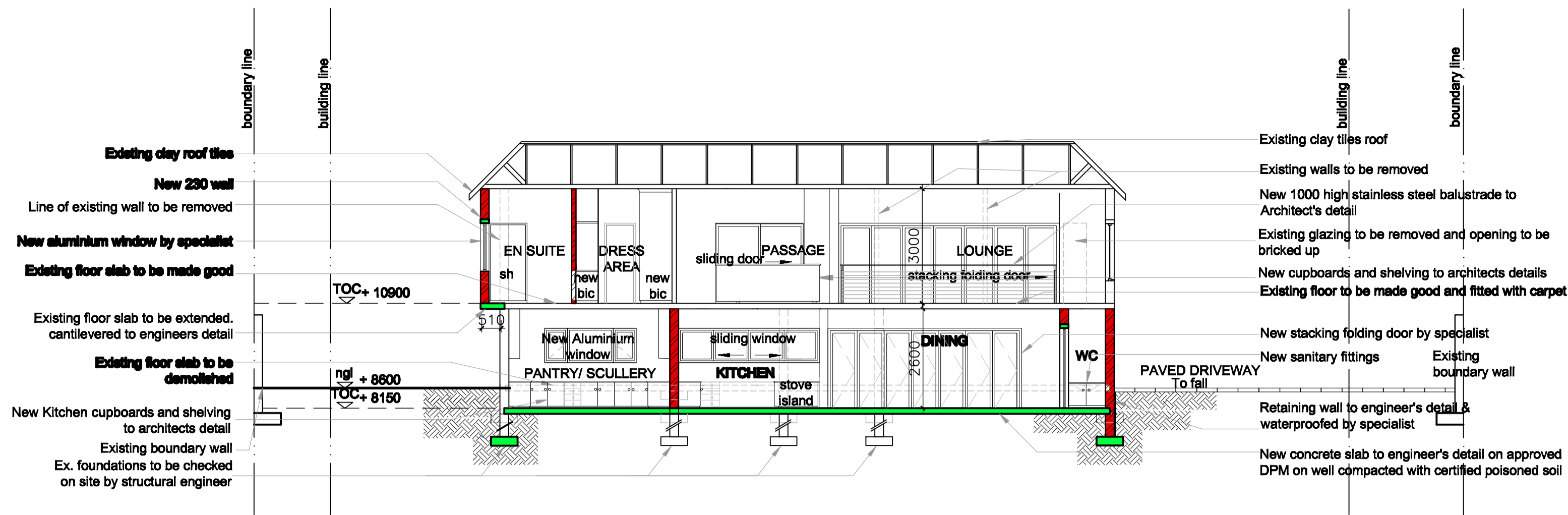
SECTION Z - Z SCALE 1: 100