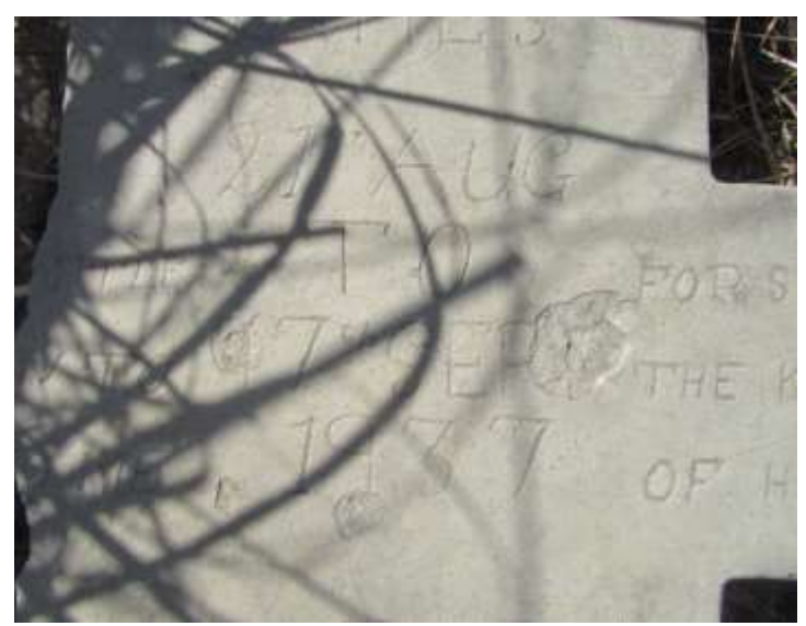
Fig.2: One of the identified graves on Site G.