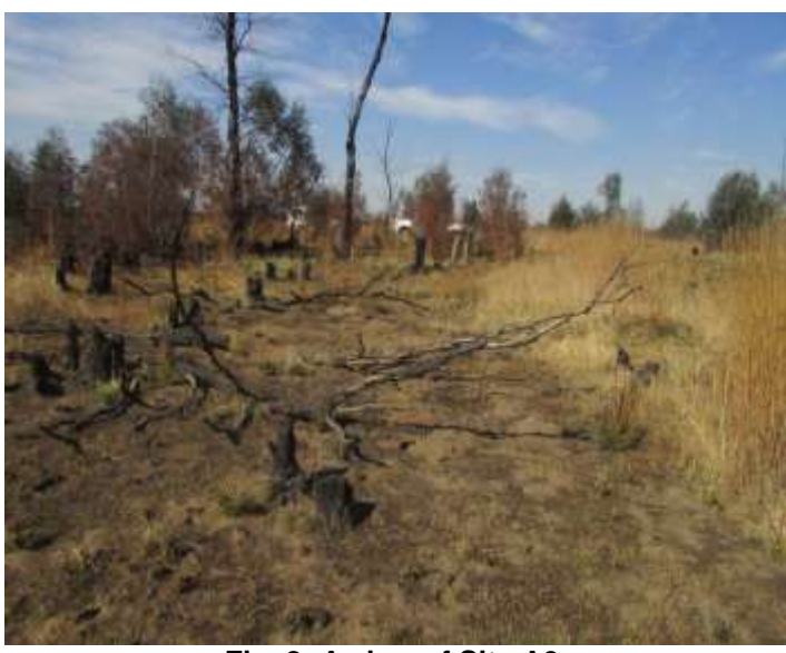
Fig. 8: A view of Site A2.

This site contains between 20 and 30 graves, with some demarcated by bricks and stones and others with clear headstones including inscriptions, while some are just demarcated with single cement headstones and soil heaps. A number of gaps between rows of clearly visible graves could also contain unmarked graves/burials that will have to be tested during the exhumation process. The dates of death that could be seen on some of the graves range from 1961 to 1967? (on what seems to be the earliest graves on the site) and could date the site to between the 1960's and 1970's or even later. Site clearance and marking of the graves need to be completed as well.