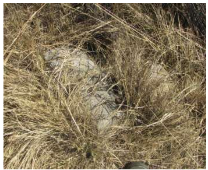
Fig.7: Another of the possible graves on Site A1.