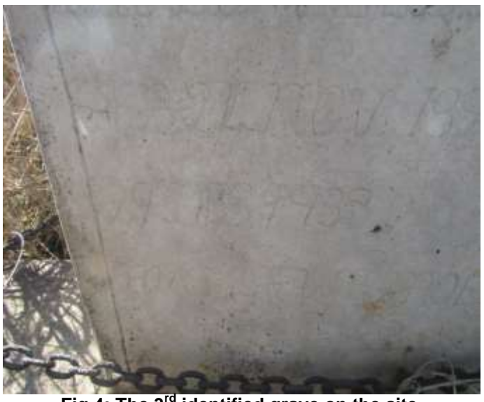
Fig.4: The 3<sup>rd</sup> identified grave on the site.