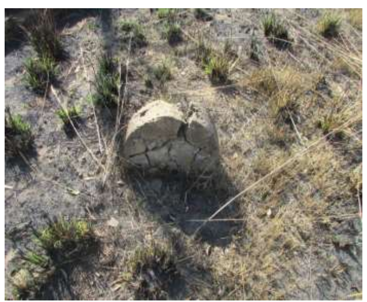
Fig.10: Another grave with a headstone on A2 (no inscription).