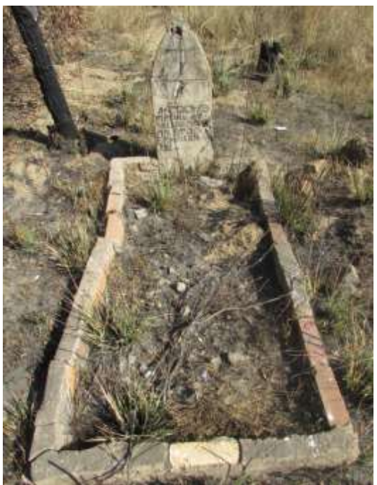
Fig.13: One of the graves on A2 with formal headstone.