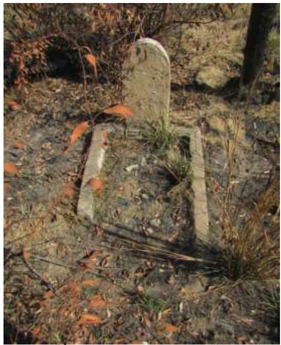
Fig.15: A 2<sup>nd</sup> grave on A2 with formal headstone.