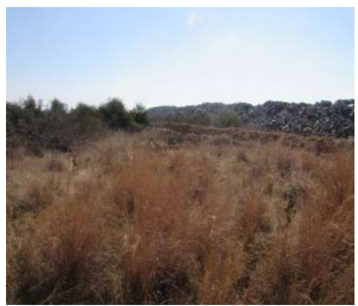
Fig.5: Location of Site A1.