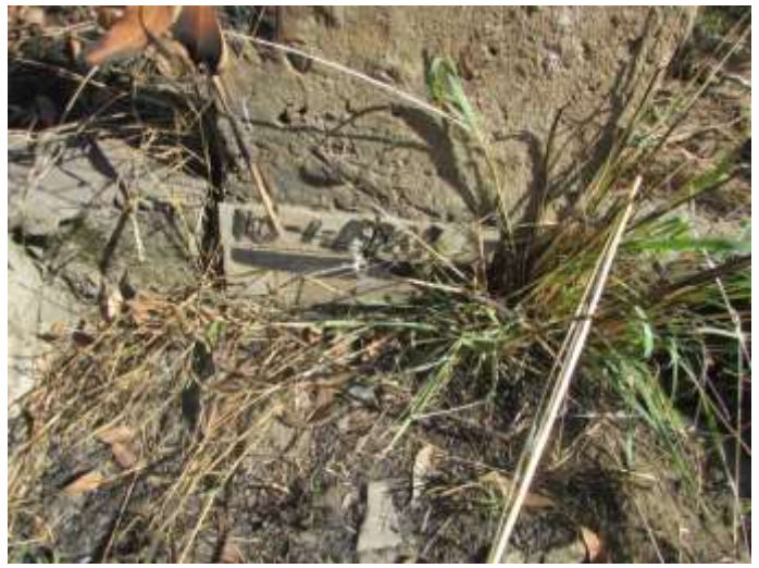
Fig.16: The date 1961 is visible on the above headstone.