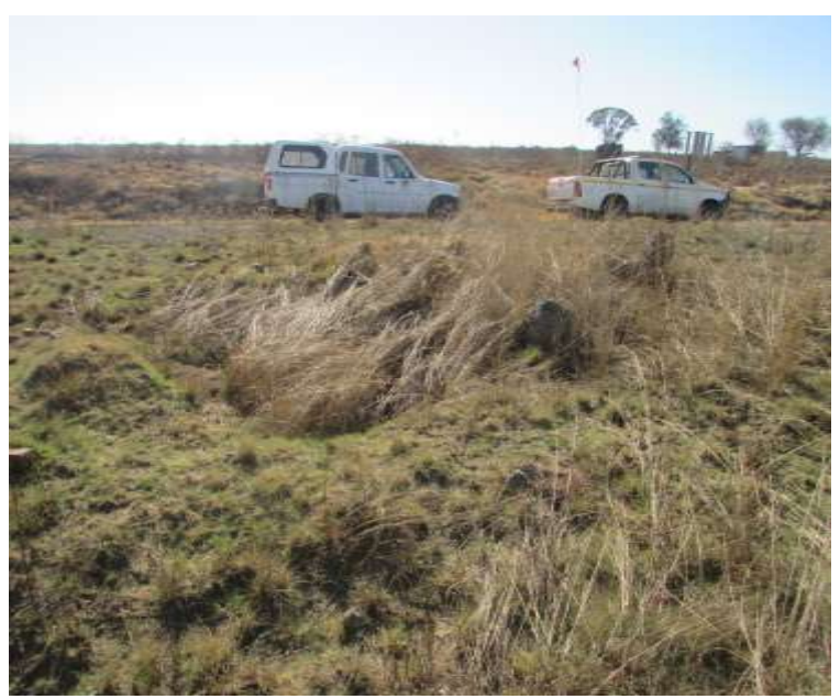
Fig.1: A view of Site G.

between 1937 and 1940. The family surnames that could be identified is Van der Merwe and Strydom/Rheeder. The site needs to be properly cleaned and the graves marked and numbered before exhumations are undertaken, while social consultation needs to be completed as well.