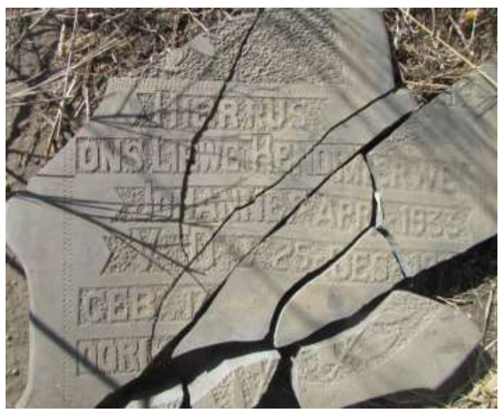
Fig.3: Another of the identified graves on Site G.