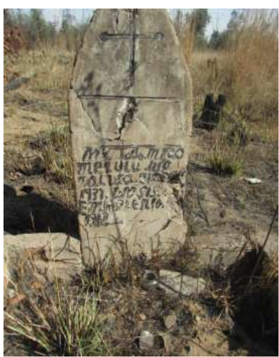
Fig.14: Close-up of the above grave. The date of death of 1967 is visible.