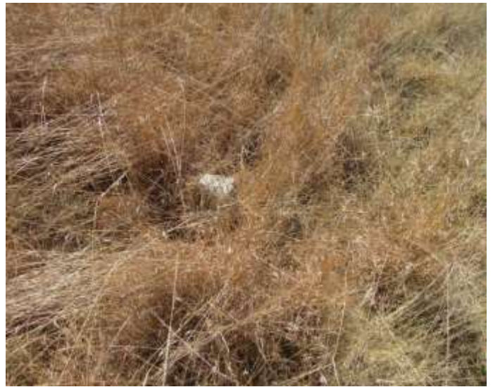
Fig.9: One of the graves on Site A2 with a single headstone.