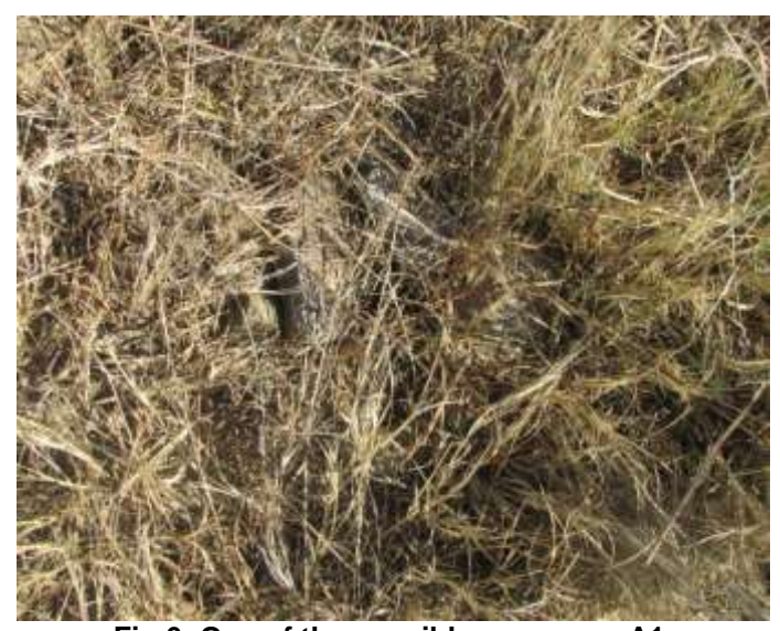
Fig.6: One of the possible graves on A1.