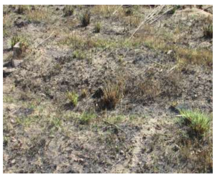
Fig.11: One of the soil heap graves on A2.