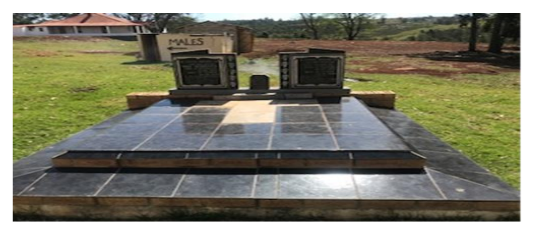
Figure 6: View of the cemetery