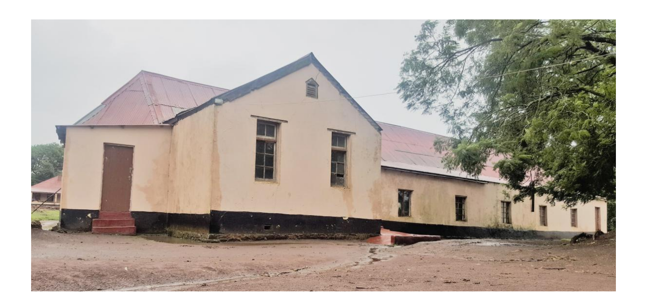
Ludeke Methodist Church in Mbizana Eastern Cape