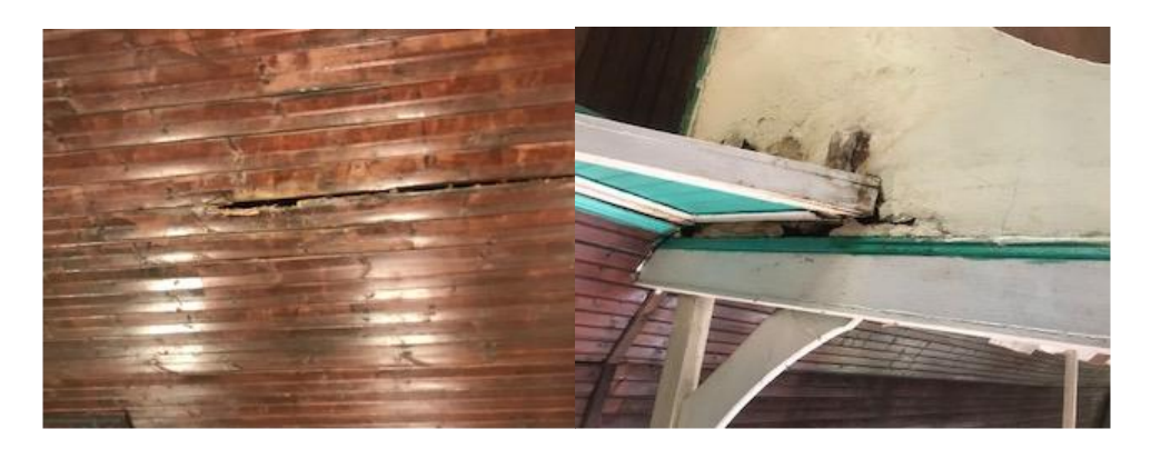
Figure 3: Fascia Boards rotting of Ludeke Methodist Church in Mbizana Eastern Cape

The Ludeke Methodist Church where the Mandela's got married is still used for public meeting irrespective it a bad state. There seems to be a cooperation of the Local municipality in assisting the Church with the management of the site which can be strengthened with heritage agreements. In addition, the site has been identified as part of the Resistance and Liberation Heritage Route and is along the OR Tambo Heritage Route.