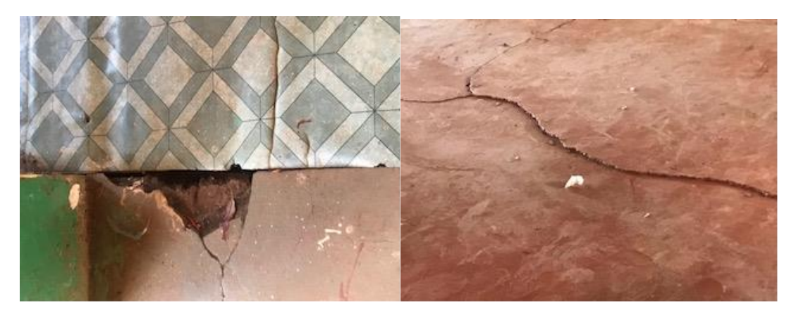
Figure 5: The floor of Ludeke Methodist Church