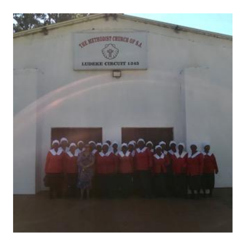
Figure 1: The entrance of the Ludeke Methodist Church new building with Manyano Women