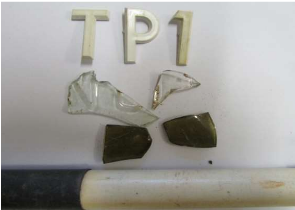
Figure 19: Glass bottle fragments.