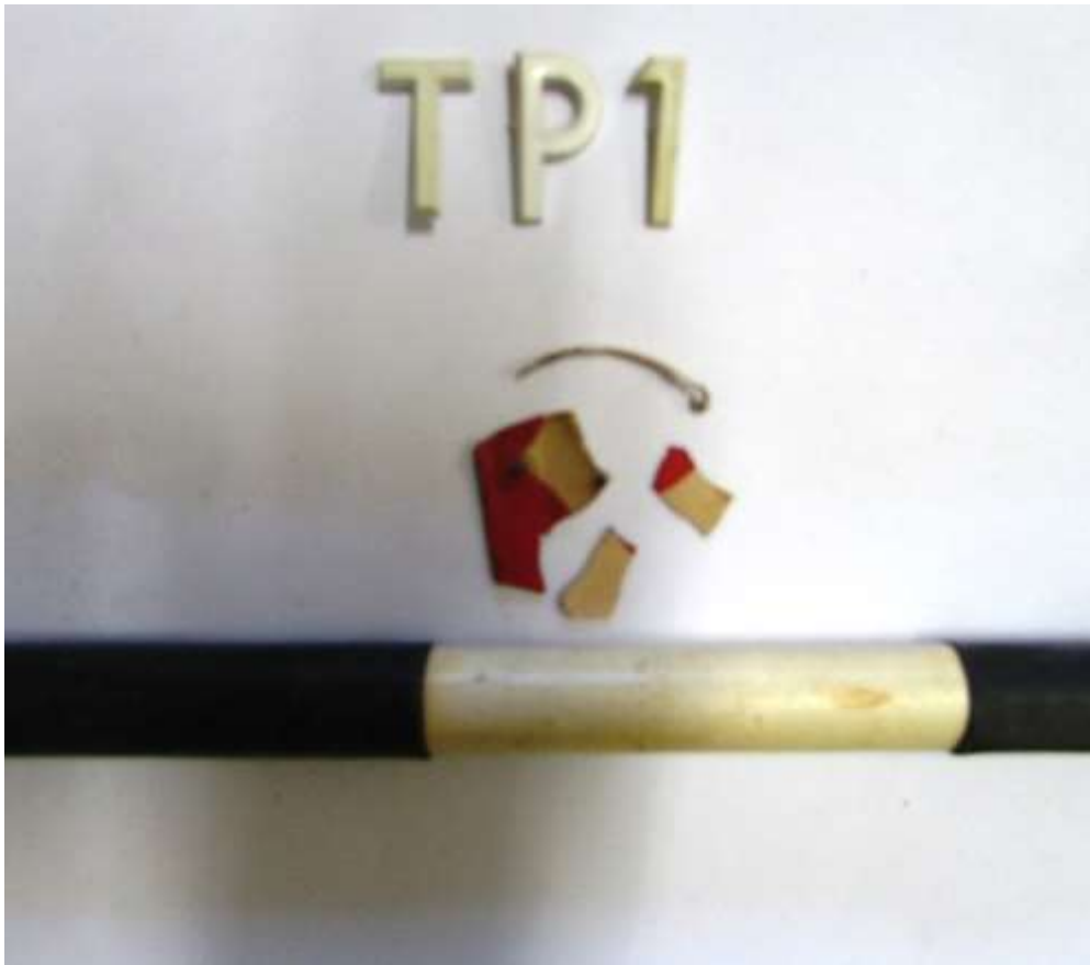
Figure 14: More modern plastic fragments from TP1.