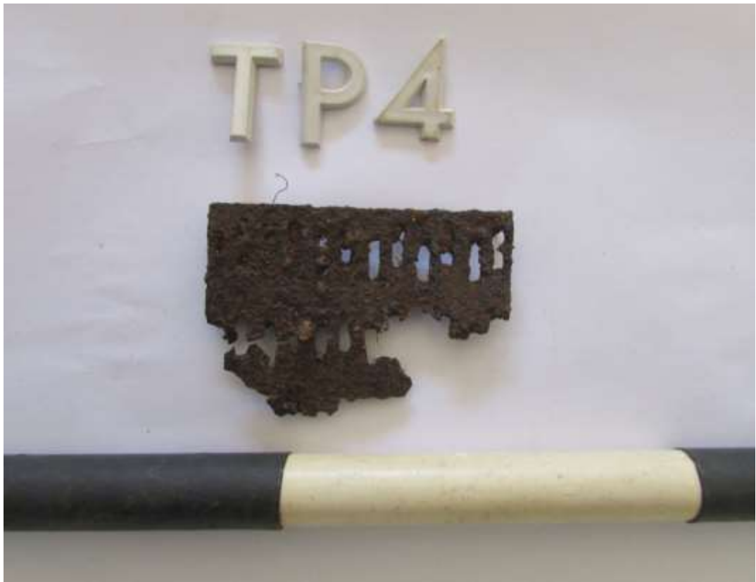
Figure 39: The unidentified metal object from TP4.