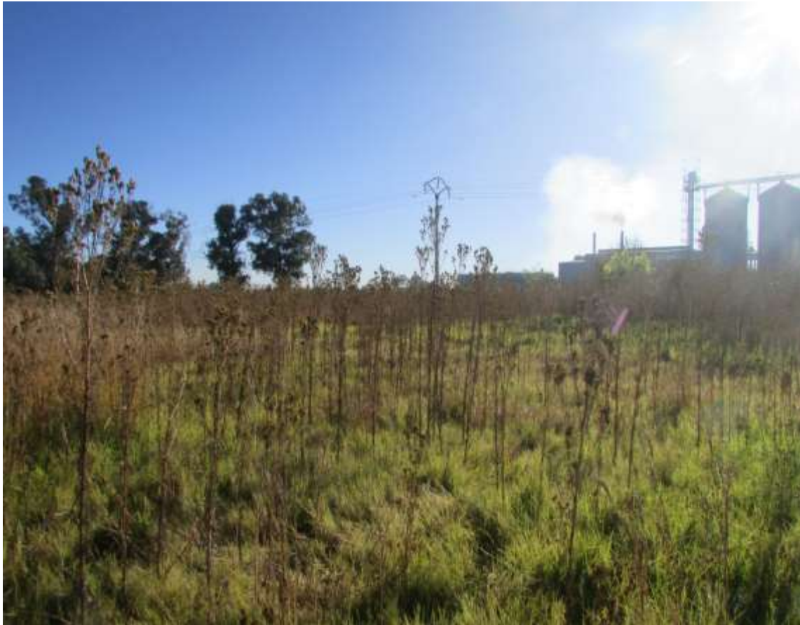
Figure 3: A view of the Alternative 2 Area & midden in May 2022.