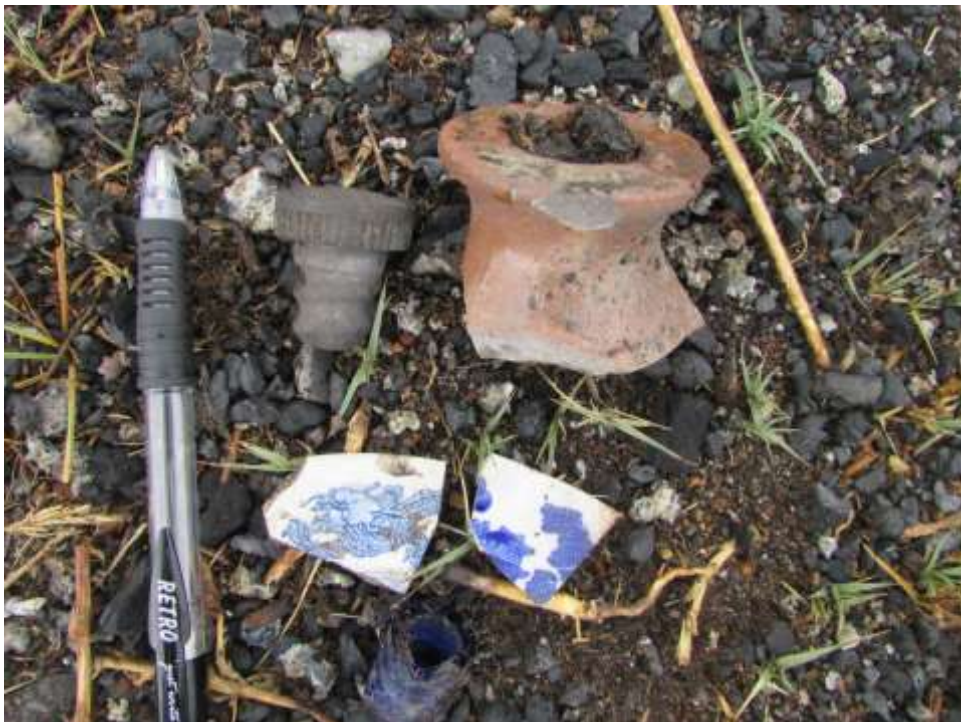
Figure 8: Bakelite beer bottle stopper, ceramic ginger beer bottle top and fragments of porcelain with Willow Pattern decoration.