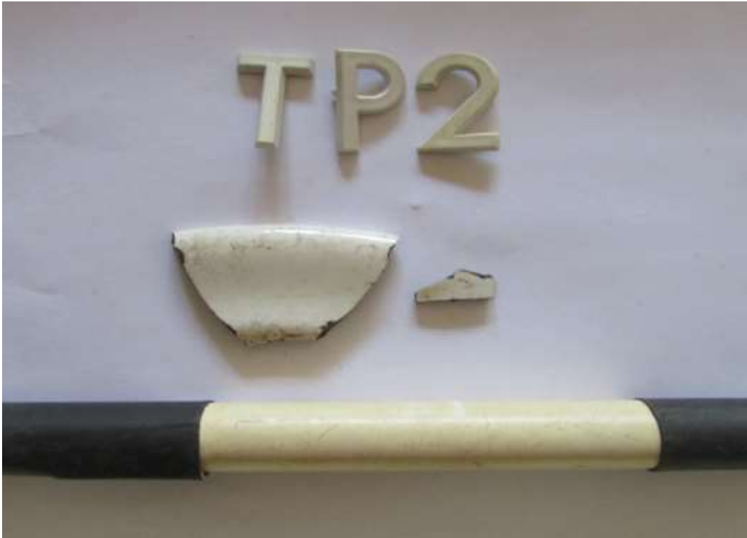
Figure 29: Pieces of porcelain from the test pit.