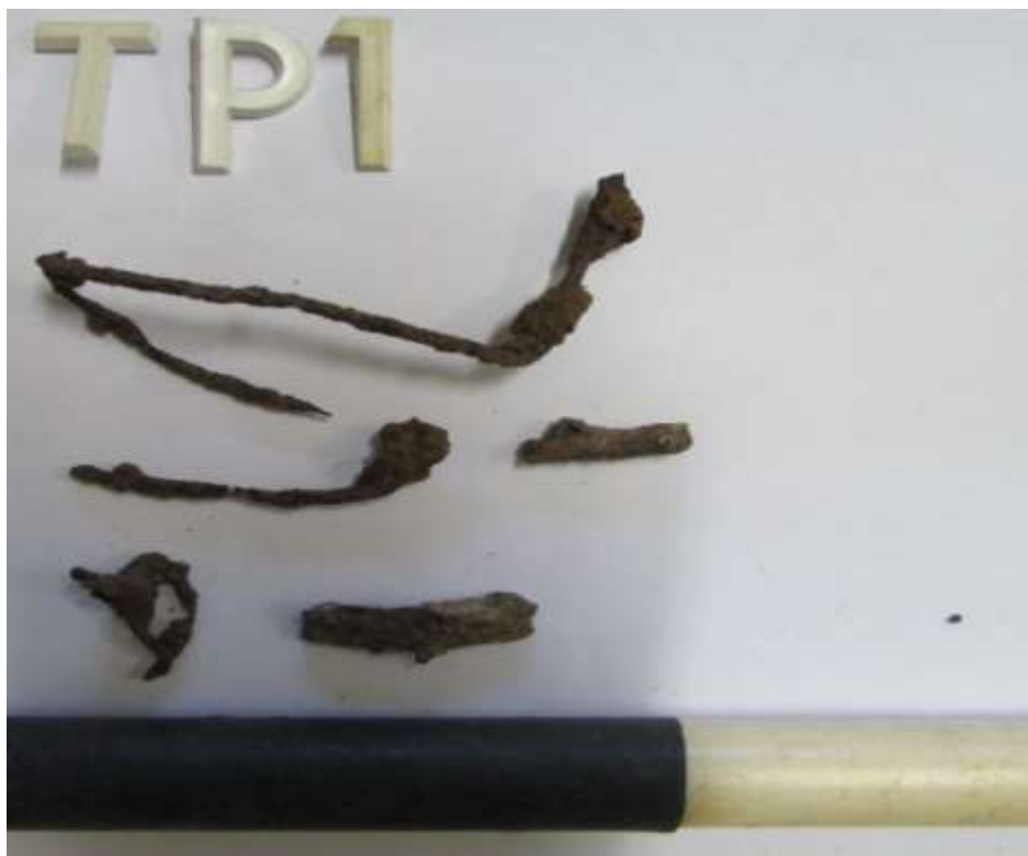
Figure 15: Nails, wire and food tin fragments.