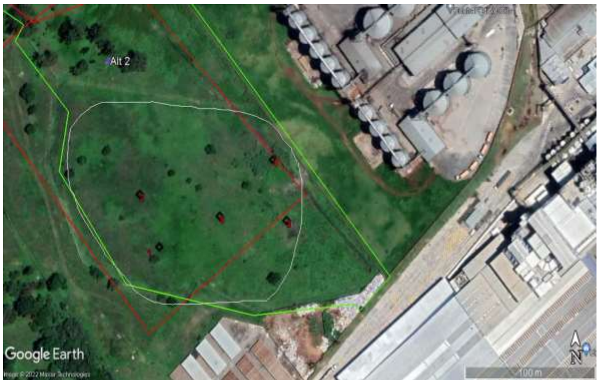
Figure 44: Closer view of area with new approximate extent of the midden area indicated based on the May 2022 mitigation work.