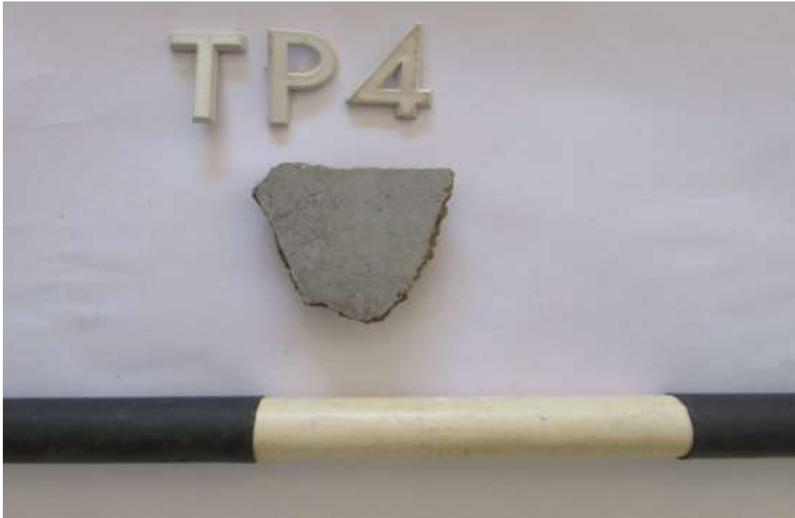
Figure 36: Fragment of a porcelain/ceramic tile.