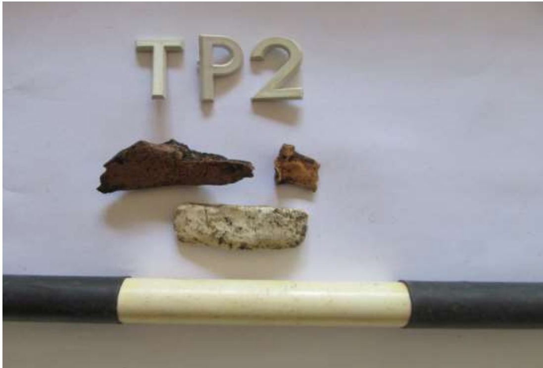
Figure 26: Faunal remains from the Test Pit.