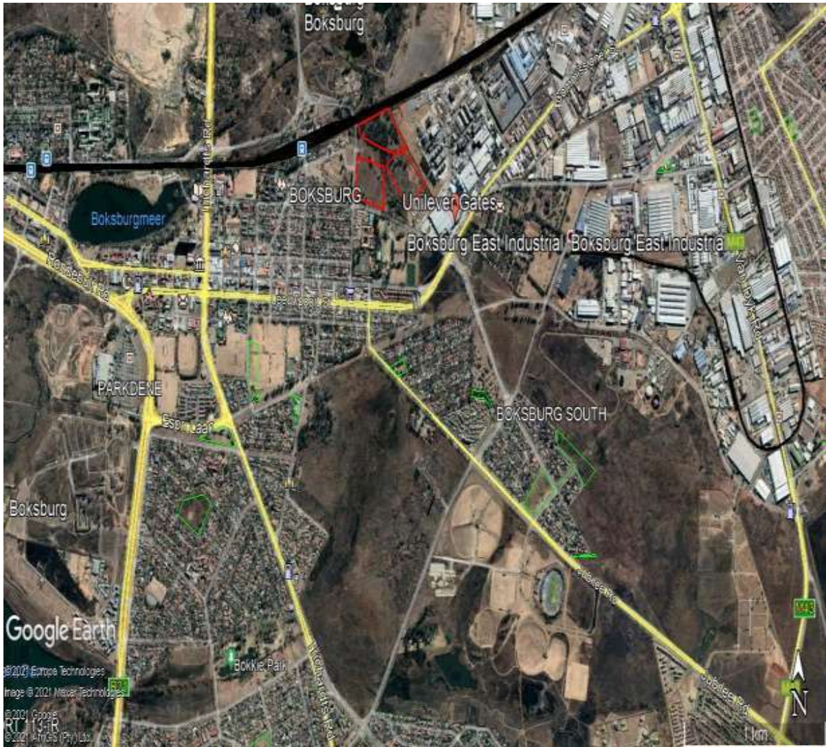
Figure 1: General location of the study & proposed development area in red polygons.

The general topography of the study & development area is flat and open, with no rocky ridges or outcrops present. The area is surrounded by various urban residential, business and industrial developments, while the area itself has been impacted in the recent past through powerlines, water and gas pipelines and servitudes. The informal dumping of building material and other refuse also occurs in the area. During the May 2022 mitigation work the vegetation (grass, weeds) cover in the area was extremely dense, limiting visibility and movement. Areas with cultural material originally identified and recorded could not be traced as a result and the focus of the Test Excavations was therefore to a large degree on “new” areas that were more open and where visibility was not hampered to such a degree.