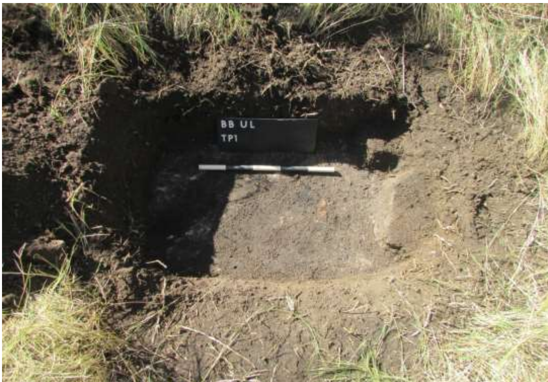
Figure 11: Test Pit 1.

The stratigraphy in the Test Pit consists of around 30cm of grass and top soil (dark brown) overlaying an ashy deposit at 0.30m depth. The cultural material is found on top of this ashy layer, with the ashy layer only about 5 to 10 cm in thickness. The cultural material deposit is not very rich, with only small fragments found mostly. The metal objects represents nails, wire and possible food tin fragments, as well as a lead bottle seal with the partial wording of London England visible. This is possibly from a liquor bottle and could also date to the late 19 th /early 20 th century. A piece of a leather shoe was also recovered, while the glass fragments represent liquor and possibly mineral water bottles. The porcelain pieces represent plates, saucers and cups.