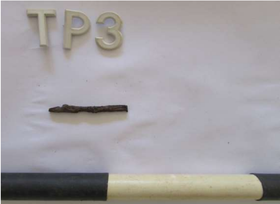
Figure 33: Metal nail.