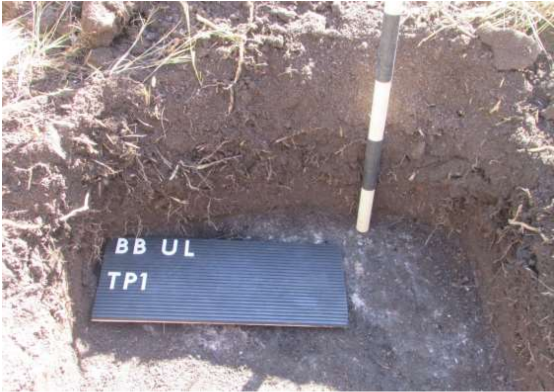
Figure 12: Closer view of Test Pit 1 with the ashy layer at the bottom visible.