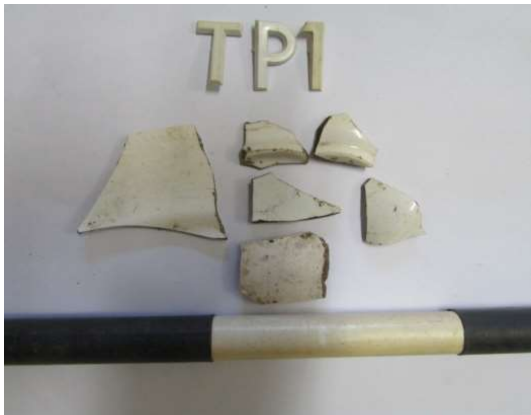
Figure 21: Porcelain plate, saucer and cup fragments.