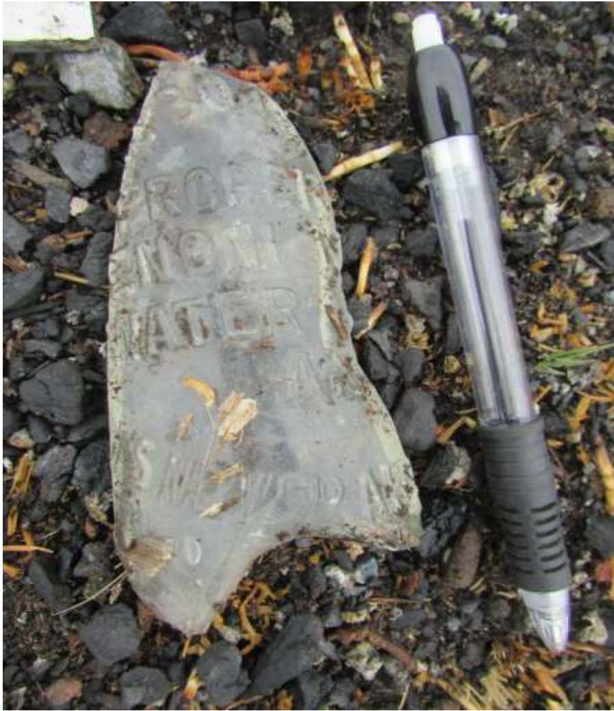
Figure 6: Close up of a mineral water bottle glass fragment. This bottle probably belonged to the Benoni Mineral Water Works.