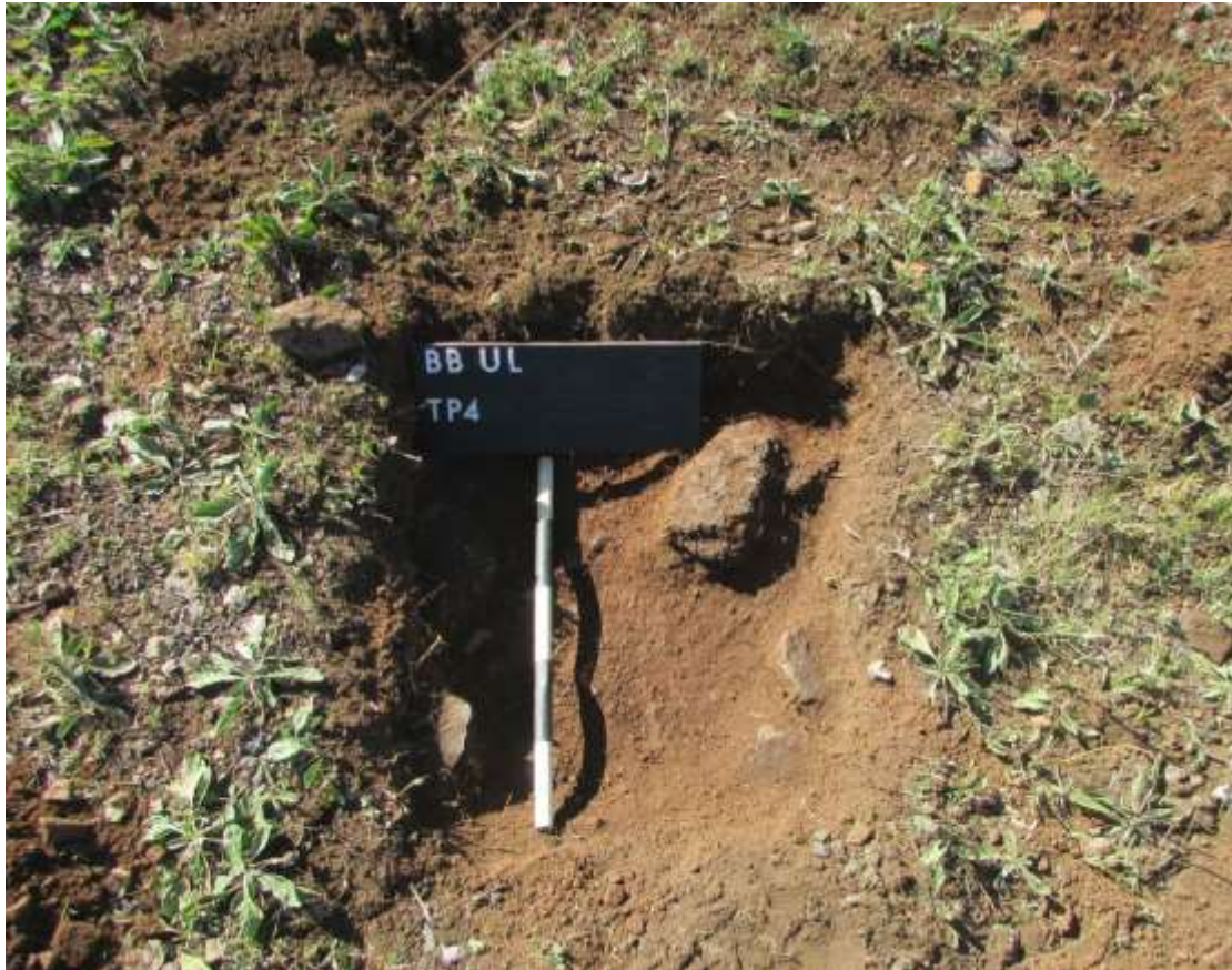
Figure 35: Test Pit 4.

The pit was fairly shallow with some ash and material found at a depth of around 20cm below the PSL. A number of rocks were encountered in the pit (waste rock from building material?) with no cultural material below this level. Very little cultural material was found in the pit (only 6 objects). This included a porcelain/ceramic tile fragment, 3 nails, one piece of a porcelain plate and an unidentified metal object. Last mentioned is possibly part of a mouth-organ.