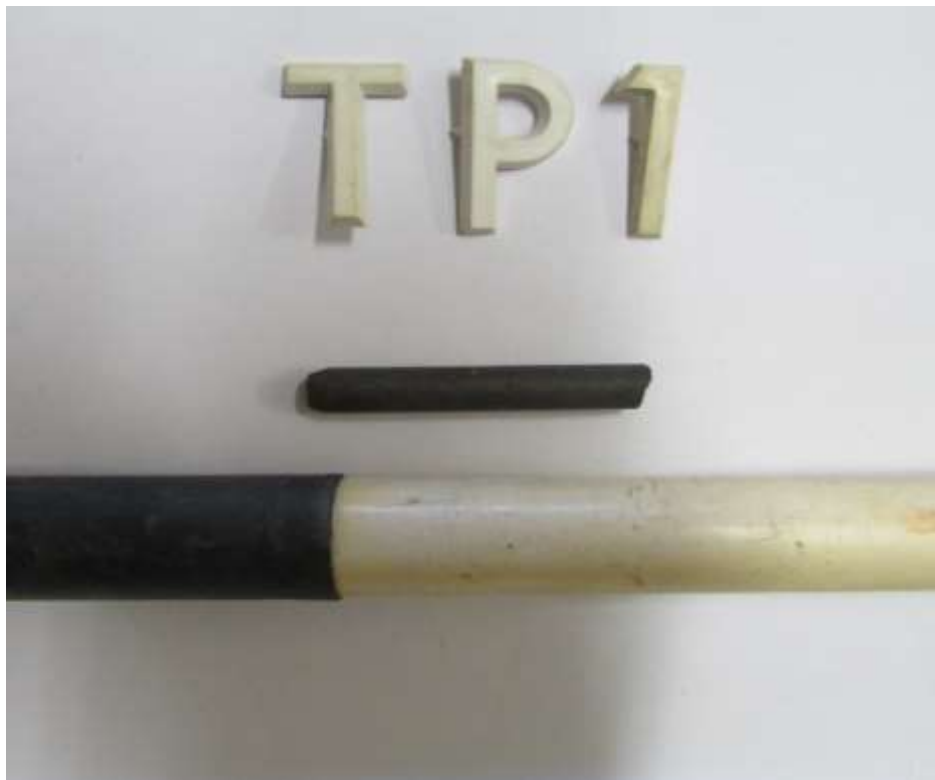
Figure 17: An old battery rod.