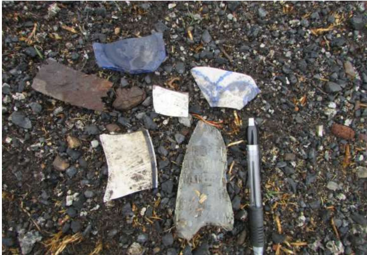
Figure 5: Some of the cultural material found in the area in October 2021.