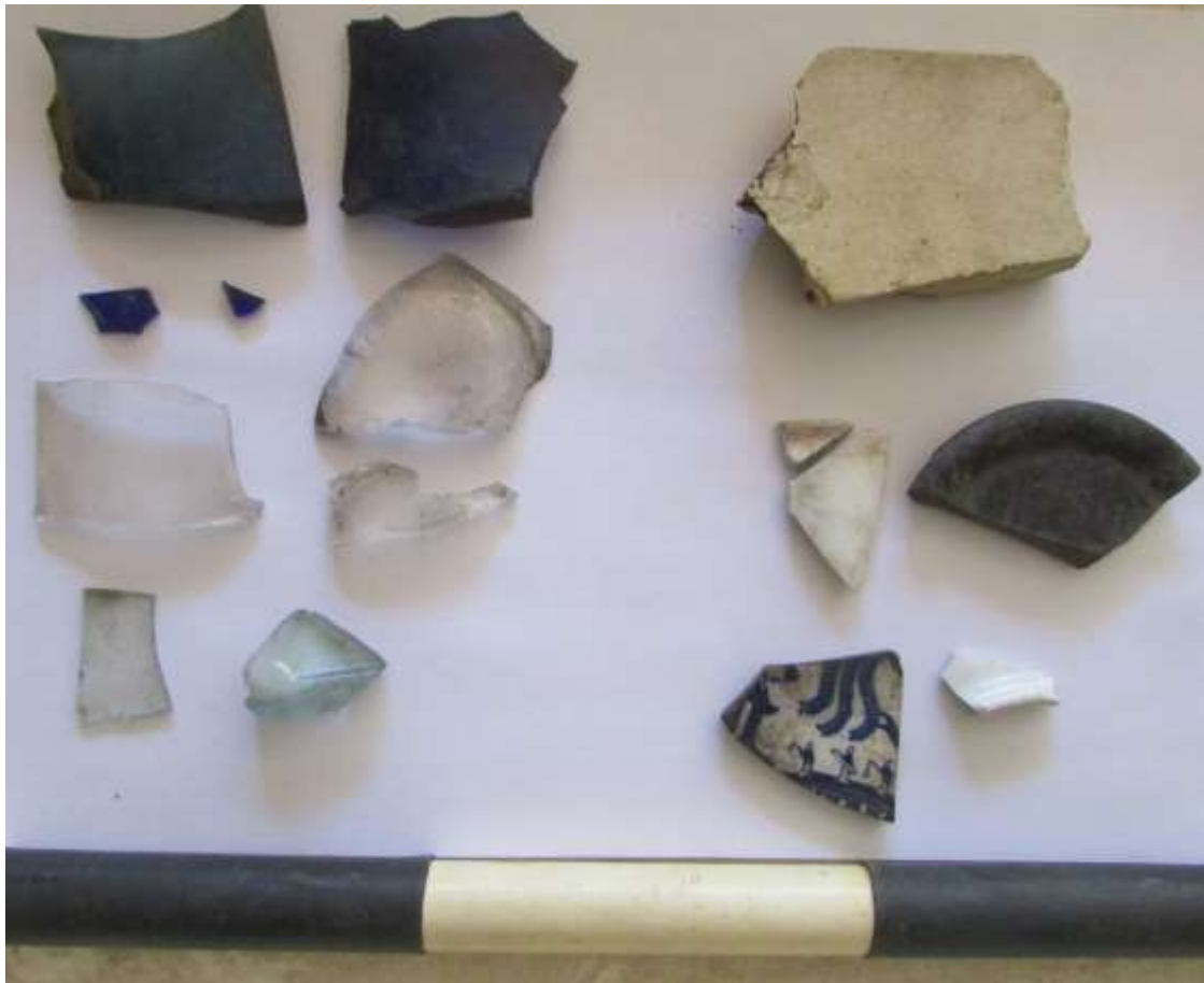
Figure 9: The cultural material sampled from the surface of the site in May 2022.