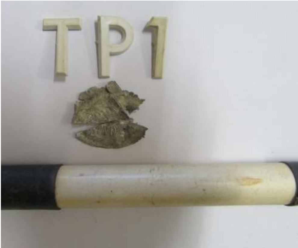
Figure 16: A lead bottle seal from Test Pit 1.