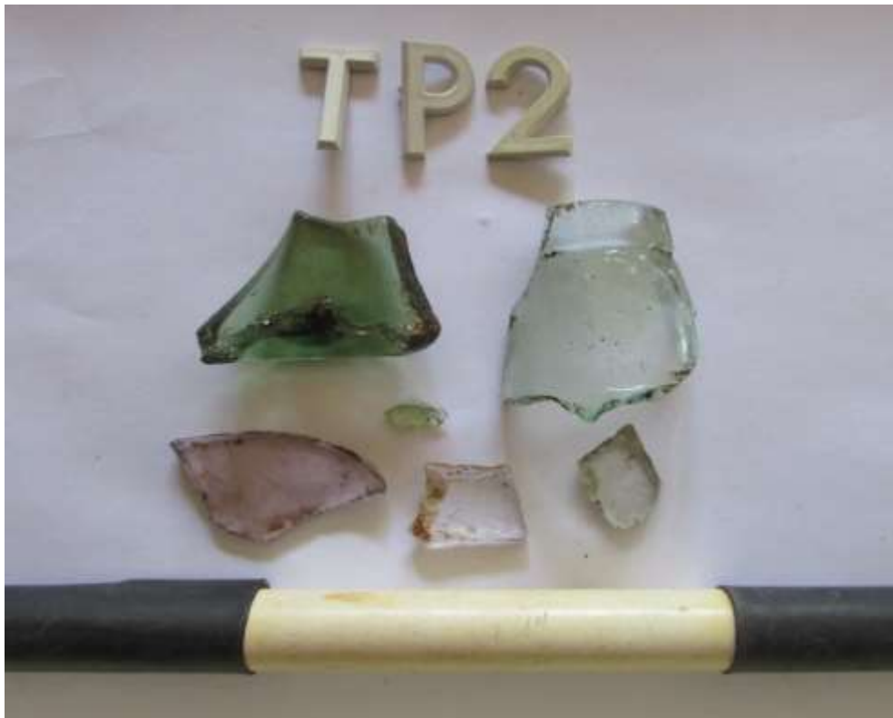
Figure 28: Glass bottle fragments. The bottle neck top right is from a late 19 th century mineral/sodawater bottle.