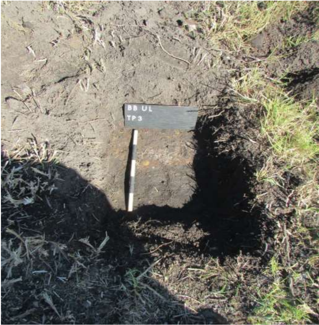
Figure 30: Test Pit 3.