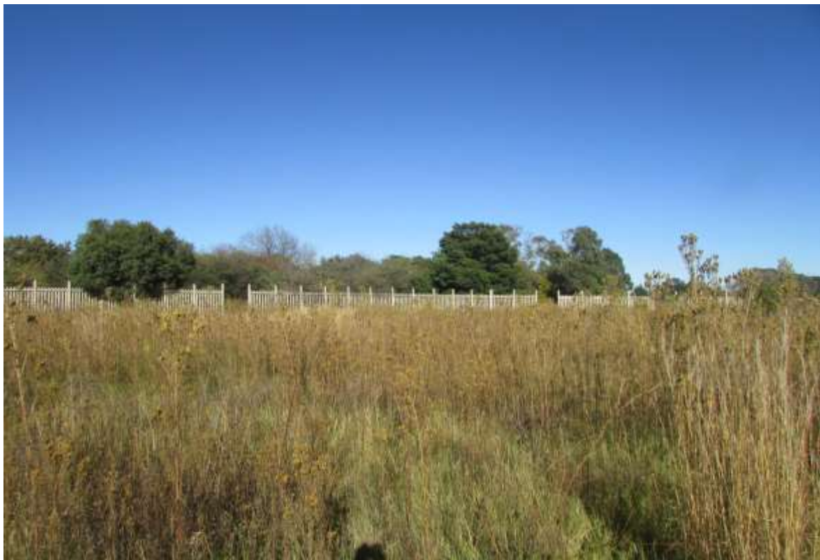
Figure 4: Another view showing the very dense vegetation in the area.