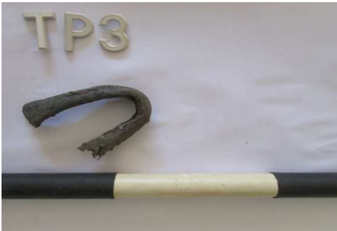
Figure 32: Piece of burnt rubber pipe/hose.