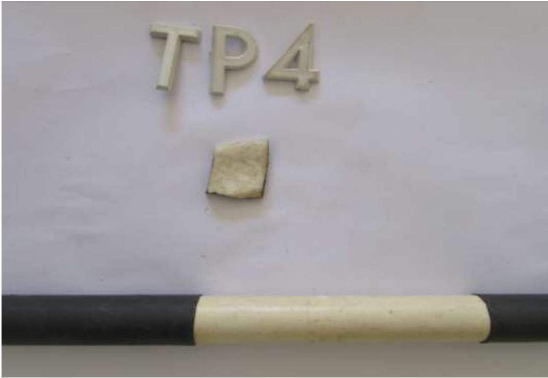
Figure 38: Piece of porcelain plate.