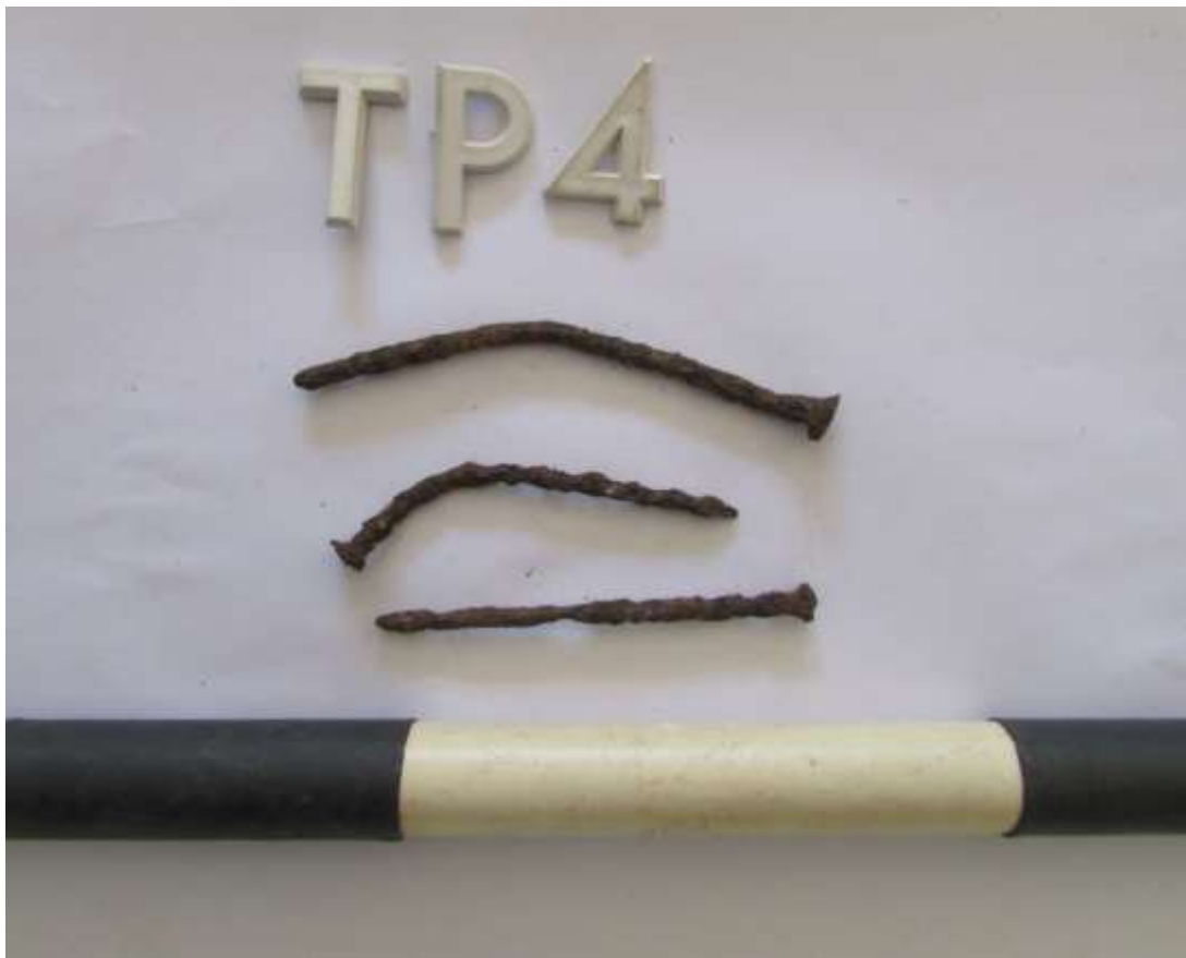
Figure 37: The nails from TP4.