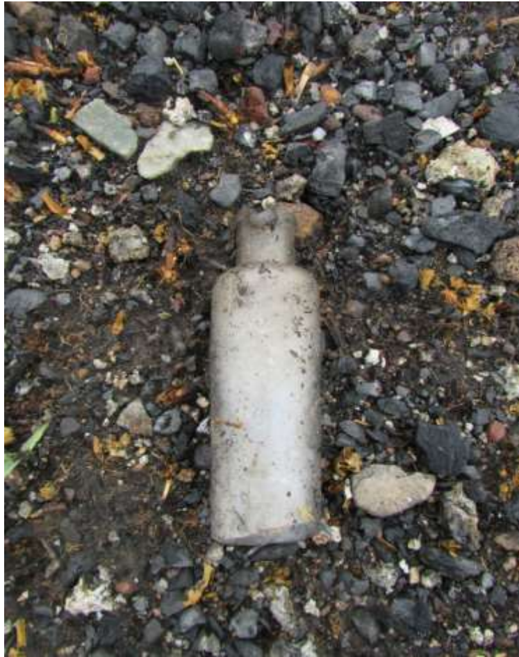
Figure 7: Medicine bottle from the surface of the site.