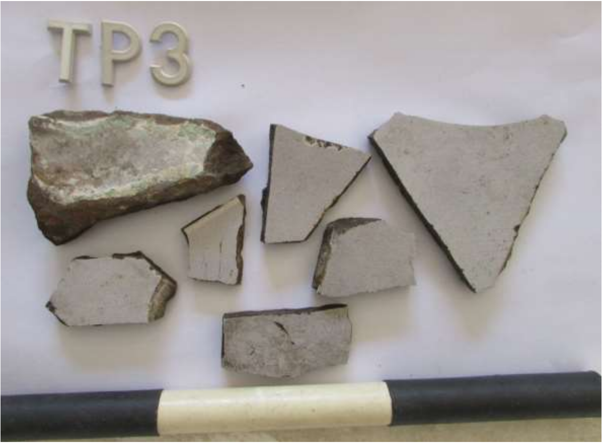
Figure 31: Ceramic and porcelain tile fragments from TP3.