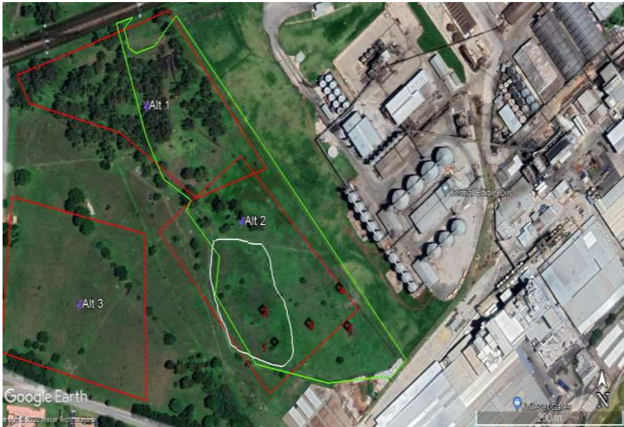
Figure 2: Closer view of the study & development area showing the 3 Alternatives, Erf 757 (green polygon), the approximate midden extent (white polygon) and the May 2022 test excavation locations (Google Earth 2022).