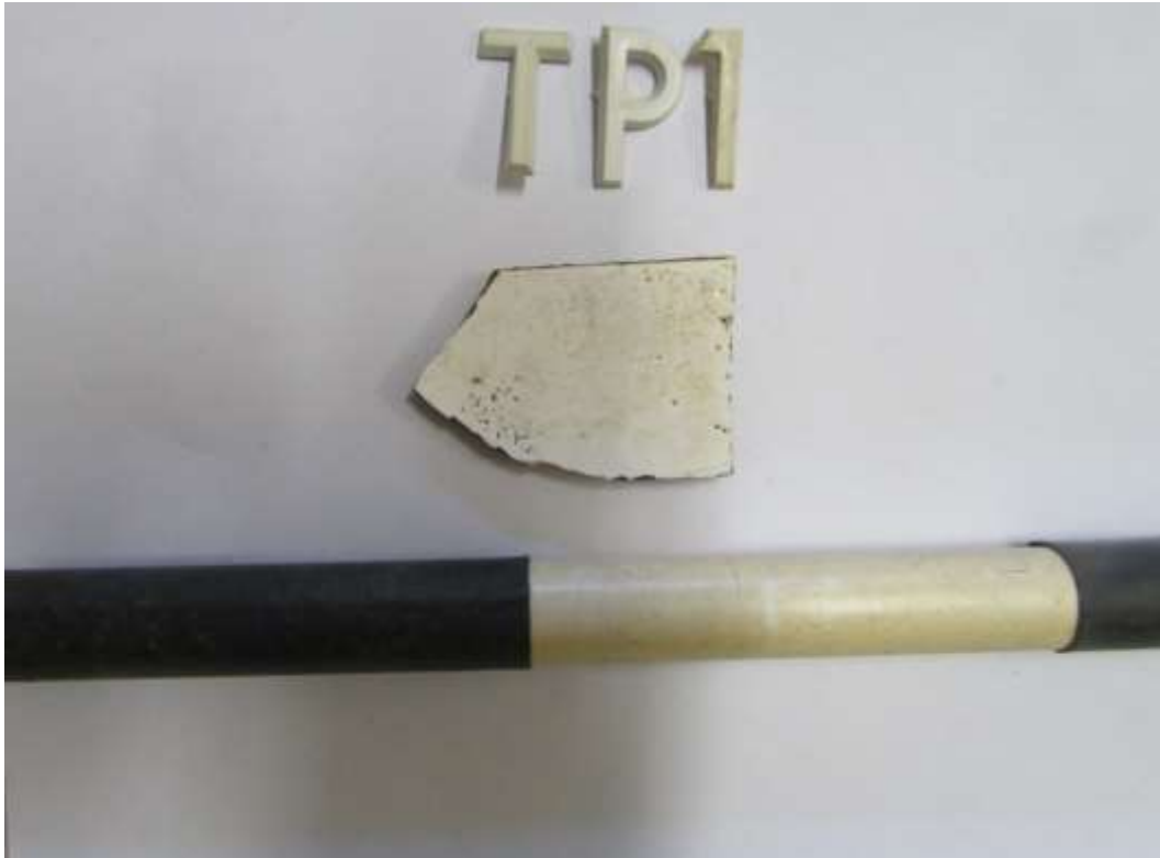
Figure 20: Porcelain tile fragment.