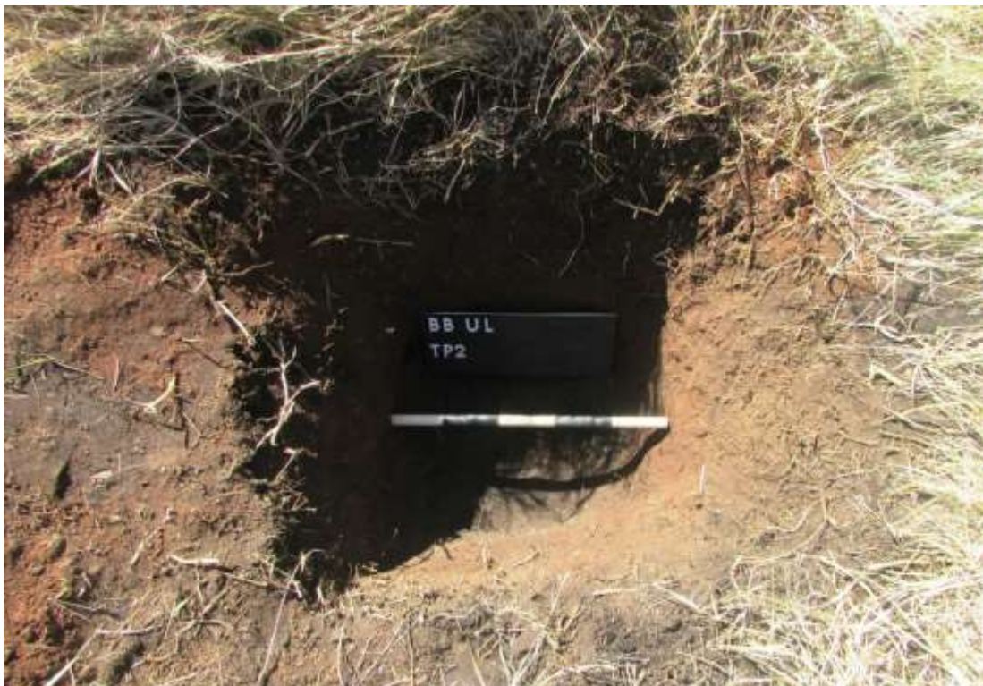
Figure 22: Test Pit 2.

One of the bottle fragments (part of a bottle top and neck) is typical of a mineral/sodawater bottle dating to the late 19th/early 20th century. It was marble-stoppered and the bottles are sometimes known as Codd-type bottles after Hiram Codd who invented the marble-stoppered bottle and patented it first in 1870 (Lastovica & Lastovica 1990: 26).