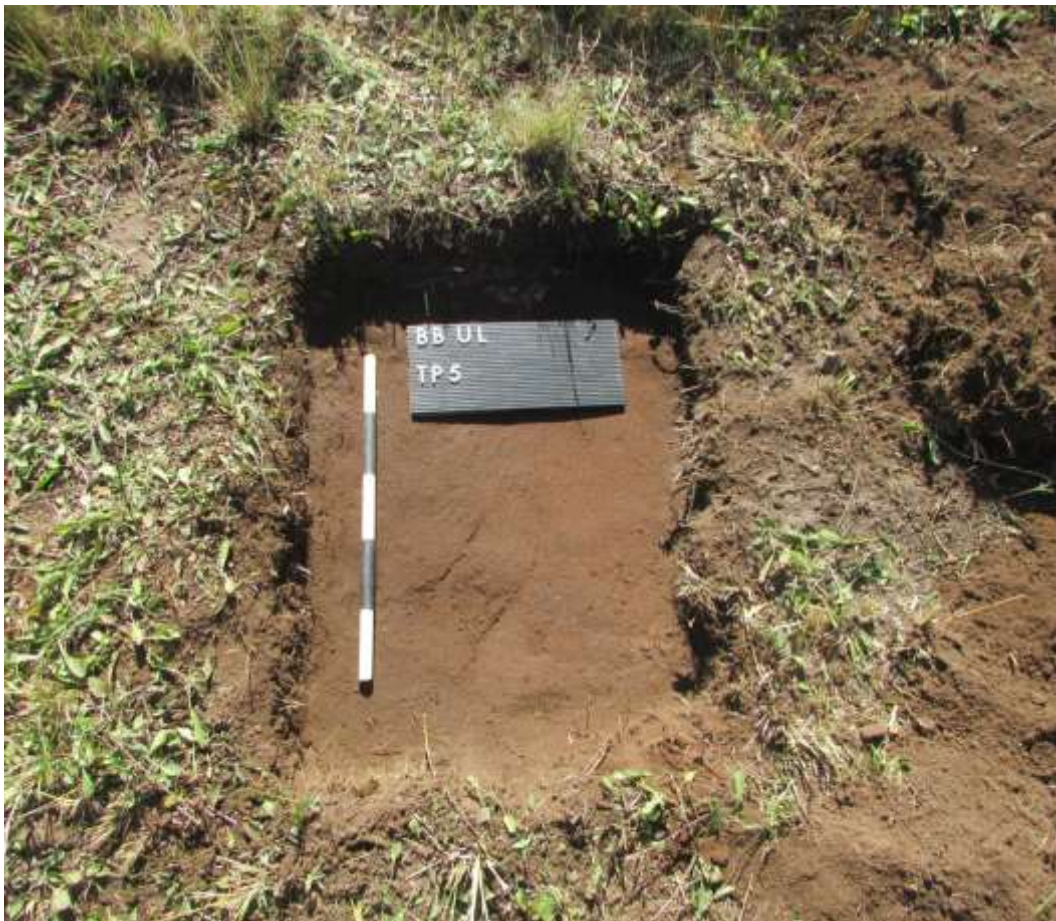
Figure 40: Test Pit 5.

This was a very shallow test pit of around 20cm in depth, at which level sterile soil was reached. Only a small thin section of ashy deposit was present and nearly no cultural material was present in this test pit. The only object recovered was a single nail.