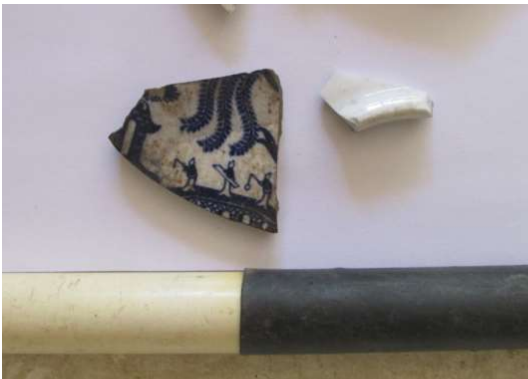
Figure 10: Close-up of the Willow Pattern decoration on a piece of porcelain.