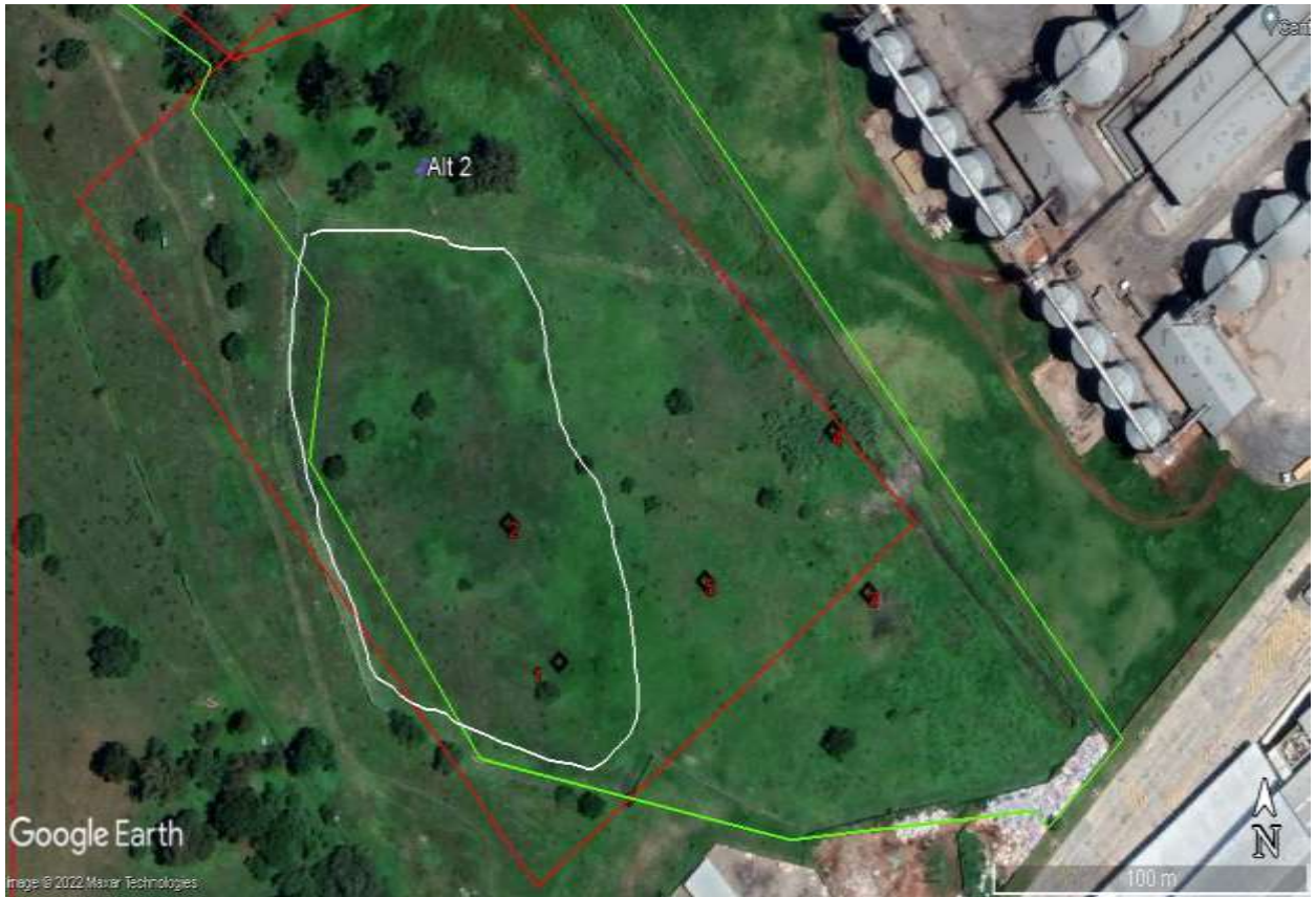
Figure 43: Closer view of the Alternative 2 footprint on Erf 757, with the original midden extent and location of the Test Pit excavations indicated (Google Earth 2022).