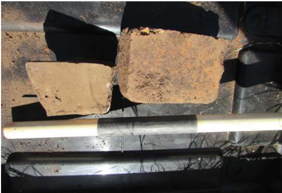
Figure 24: Bricks from Test Pit 2.