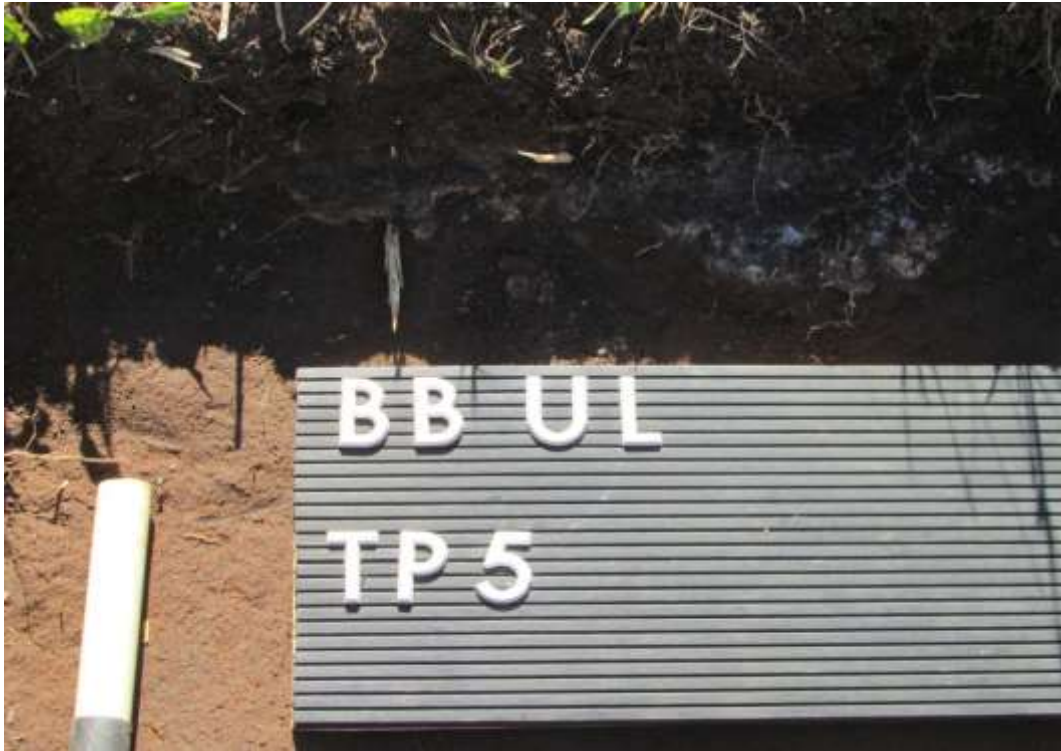
Figure 41: Close-up of the remnants of a thin layer of ash in the Test Pit.