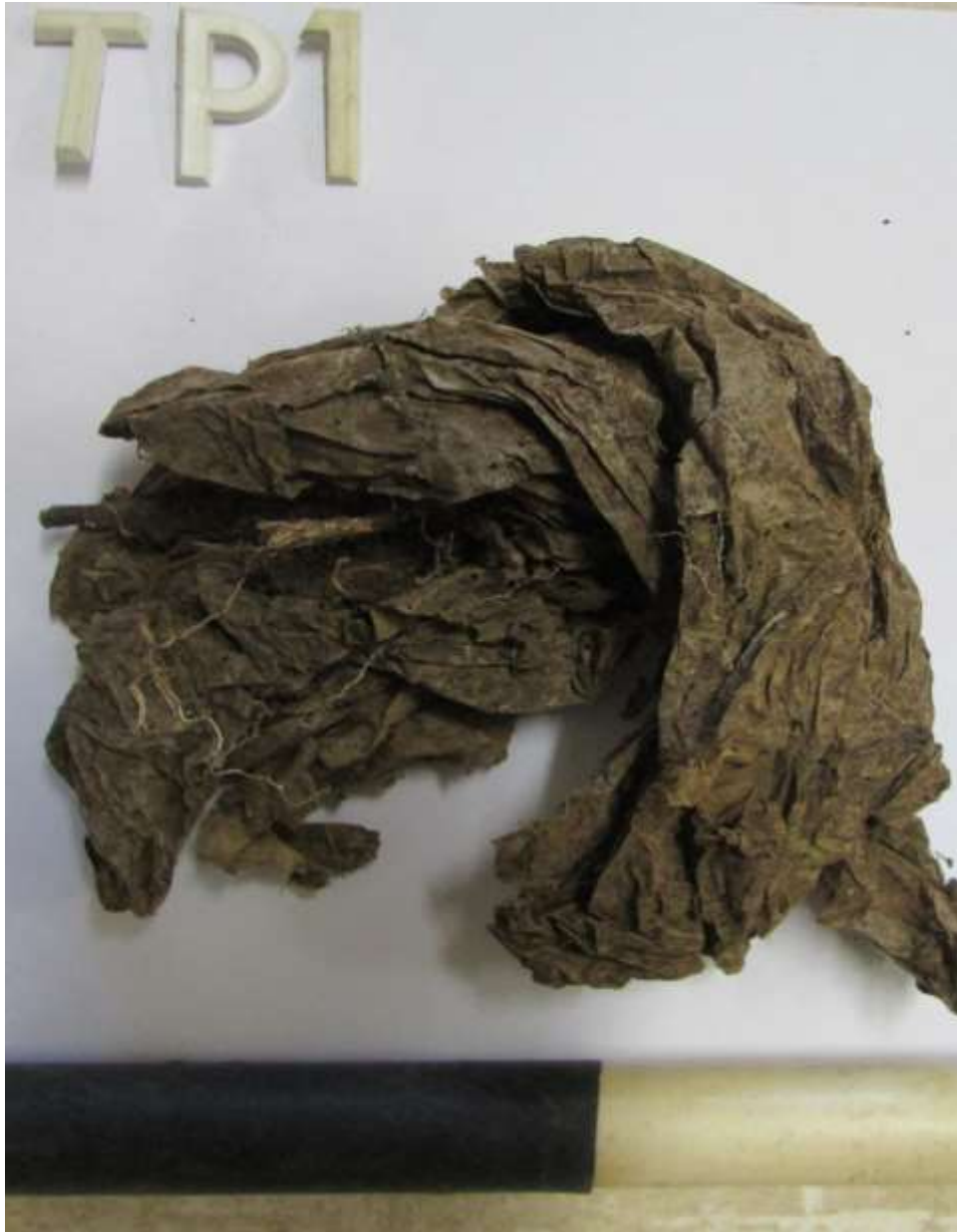
Figure 13: Modern plastic bag from Test Pit 1.