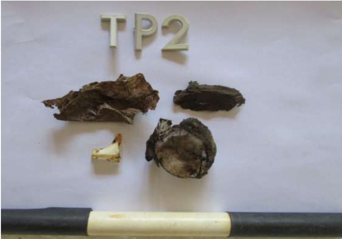
Figure 25: Modern-day plastic objects from Test Pit 2.