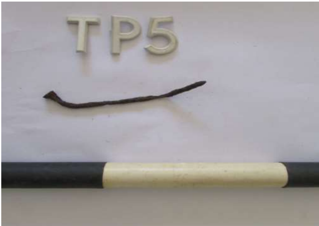
Figure 42: The only object found here was a single metal nail.