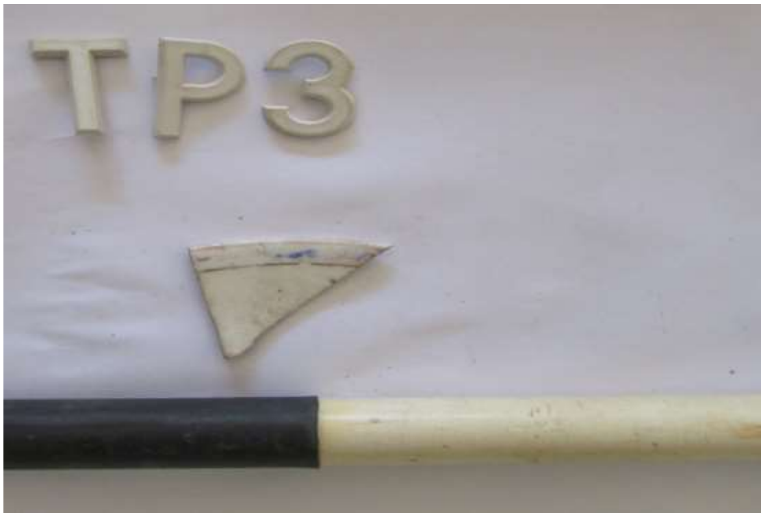
Figure 34: Piece of porcelain plate.