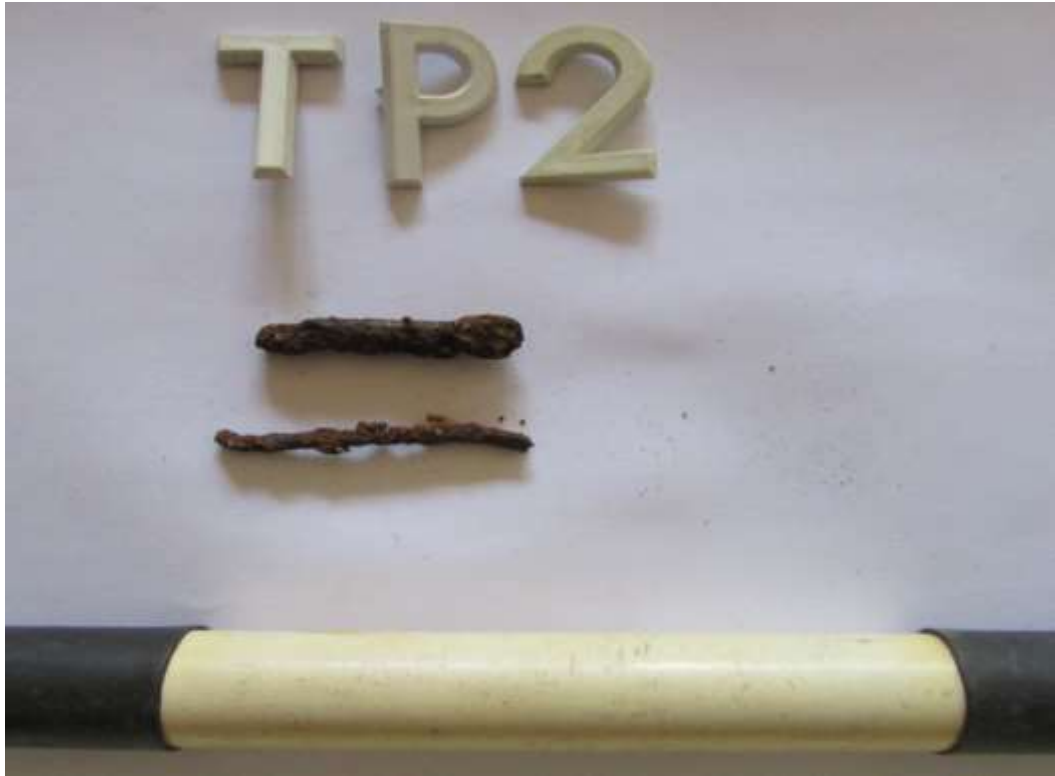
Figure 27: Nails from TP2.