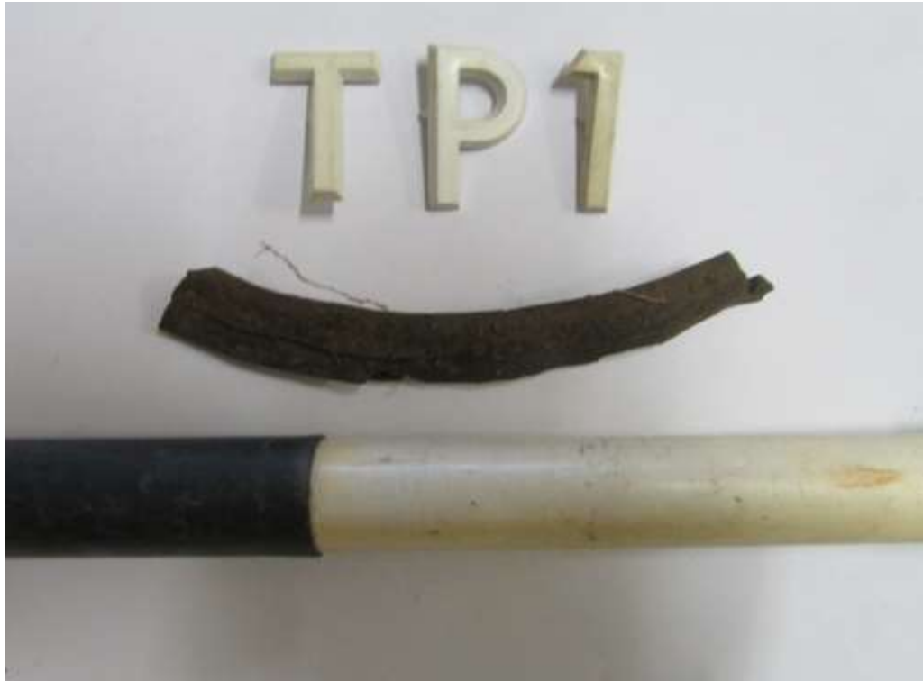
Figure 18: A piece of leather from a shoe.