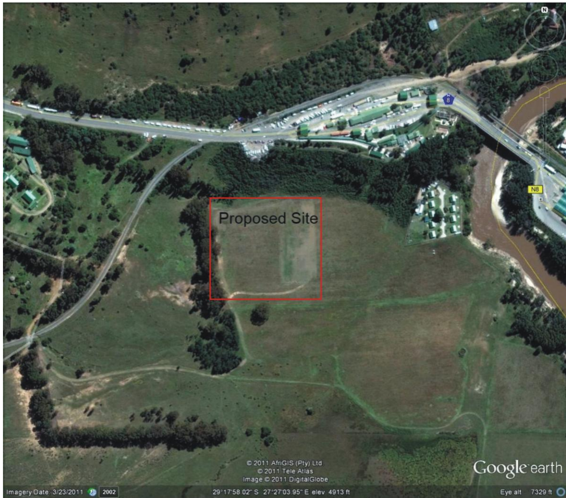
Figure 2. Aerial photograph of the proposed site.