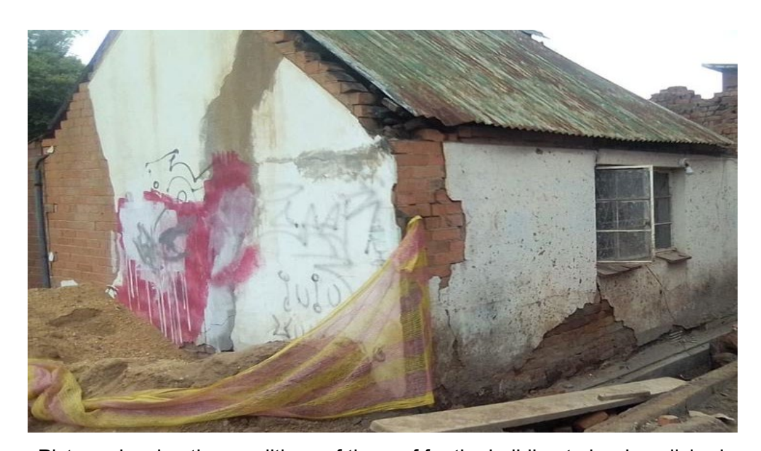
Picture showing the conditions of the roof for the building to be demolished