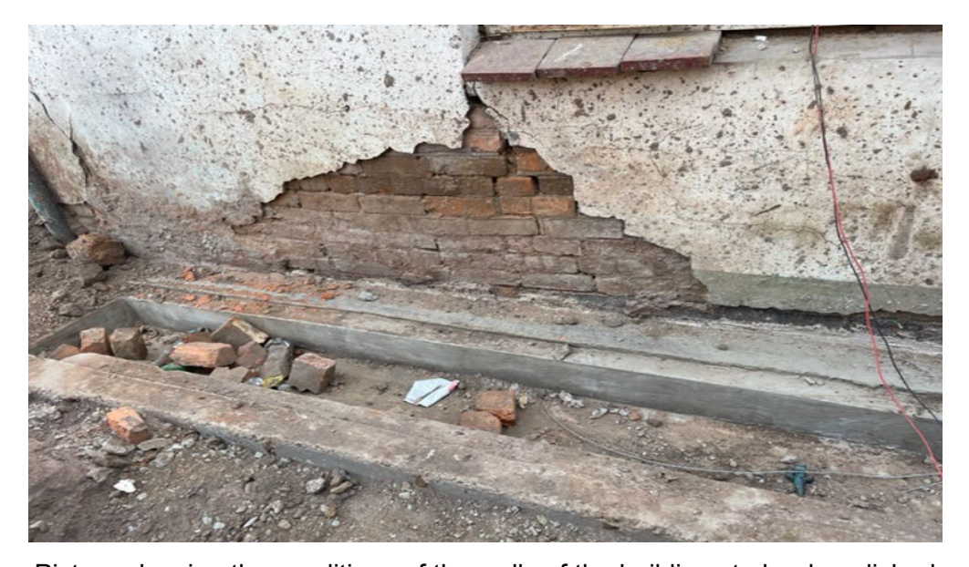
Picture showing the conditions of the walls of the buildings to be demolished