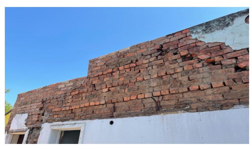
Picture showing the conditions of the beam filling for the building to be demolished