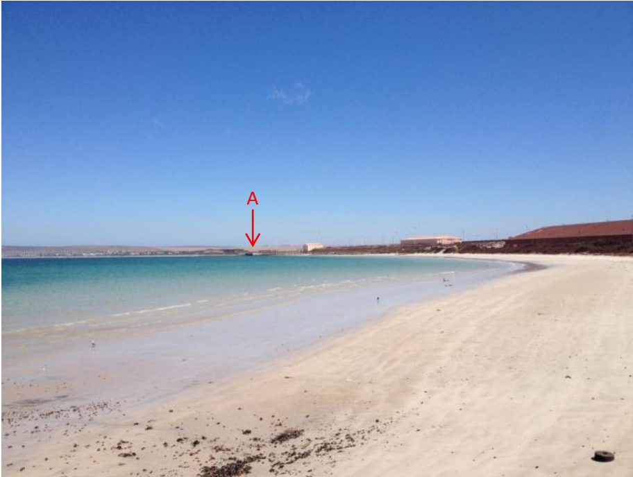
Pane 10: Looking west from the existing rock revetment along the beach towards the Moss gas Quay (A).