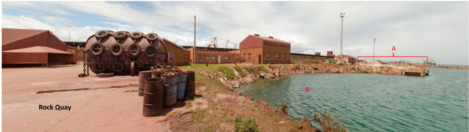
Pane 7: Looking south west from the Rock Quay towards the existing GMQ (A) over the proposed reclamation area indicated by Point B.