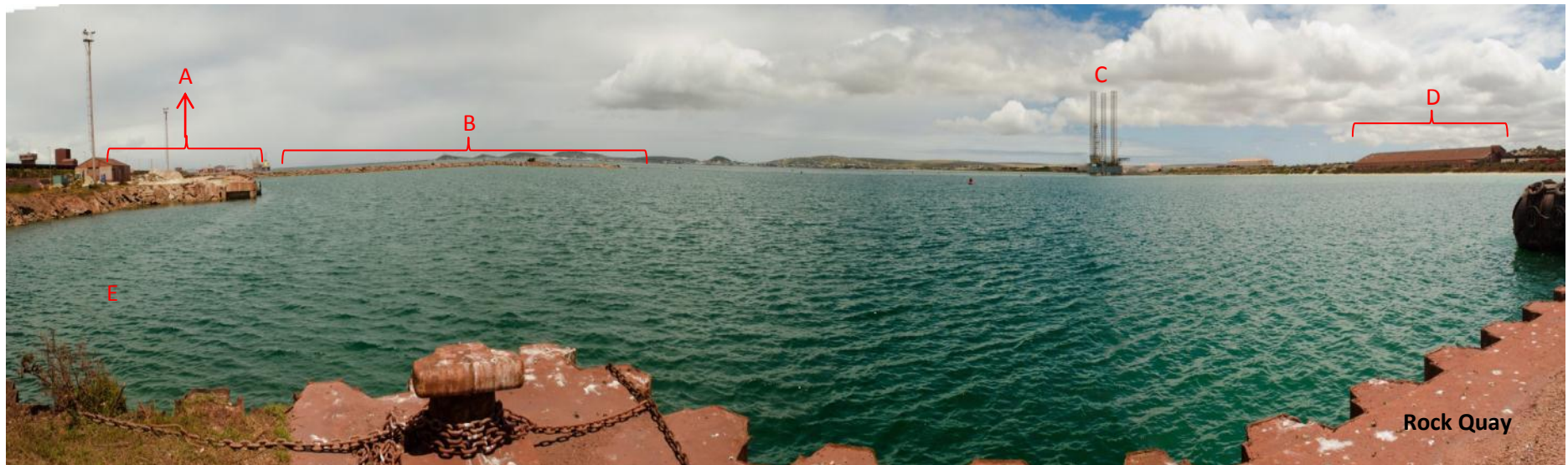
Pane 4: Looking towards the existing GMQ (A) and breakwater (B) from the southern end of the Rock Quay. The reclamation area is indicated by Point E. The Moss gas Quay (C) and warehouses (D) are visible in the background.