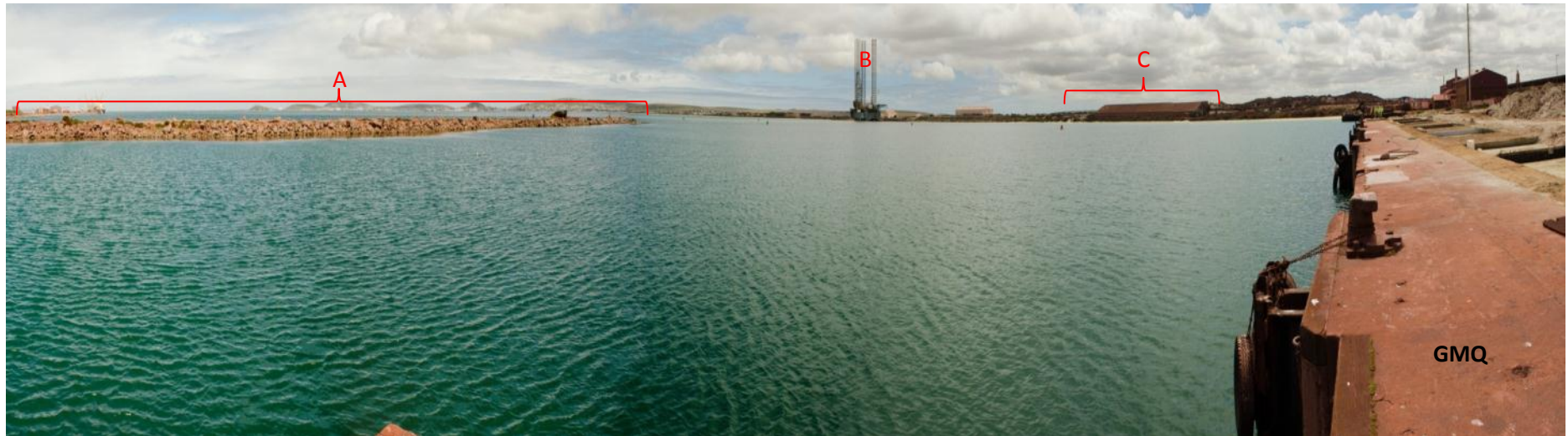
Pane 3: Looking north west from the southern end of the GMQ towards the breakwater (A). Warehouses (C) and Moss gas Quay (B) visible in the background.