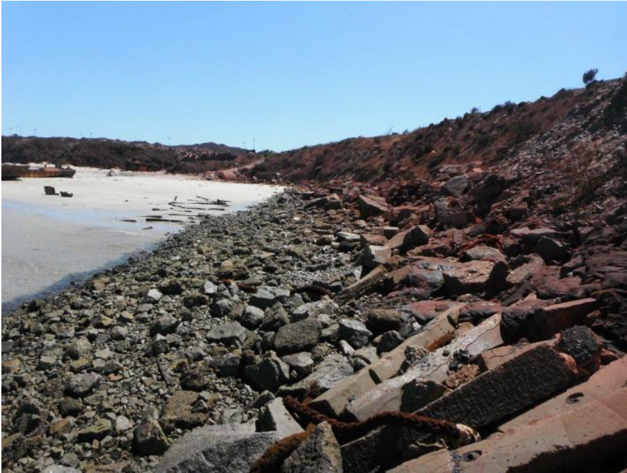
Pane 8: Looking north west from just north of the Rock Quay along the rock revetment that is to be upgraded.