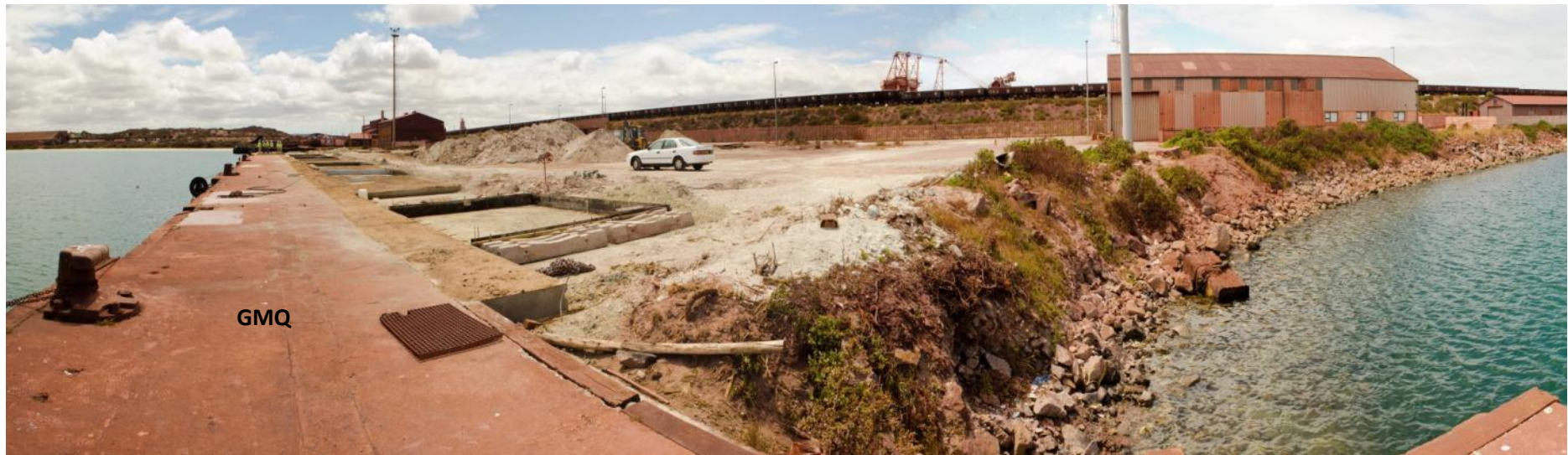
Pane 2: Looking north east from the southern end of the GMQ. Railway lines and stacker/reclaimers in the background.