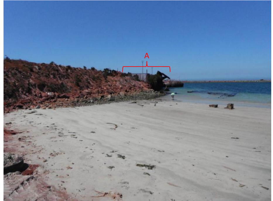
Pane 9: Looking south west from the beach towards the Rock Quay (A). The rock revetment that is to be upgraded lies to the left of the visible beach area.