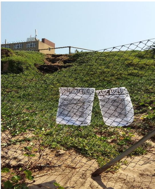
Figure 4: North End of Sea Wall Location