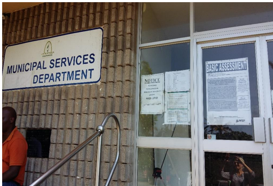
Figure 7 KwaDukuza Municipal Offices