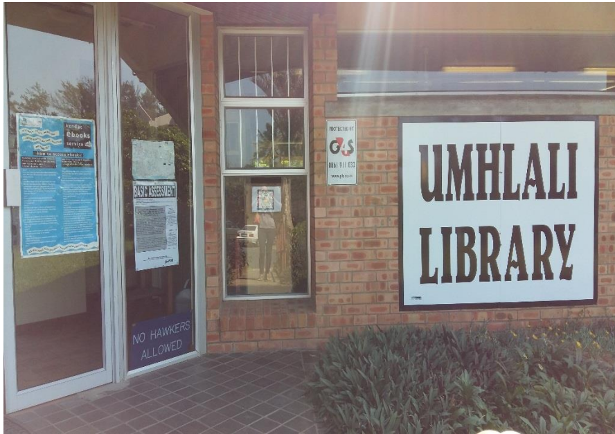
Figure 6 Umhlali Library