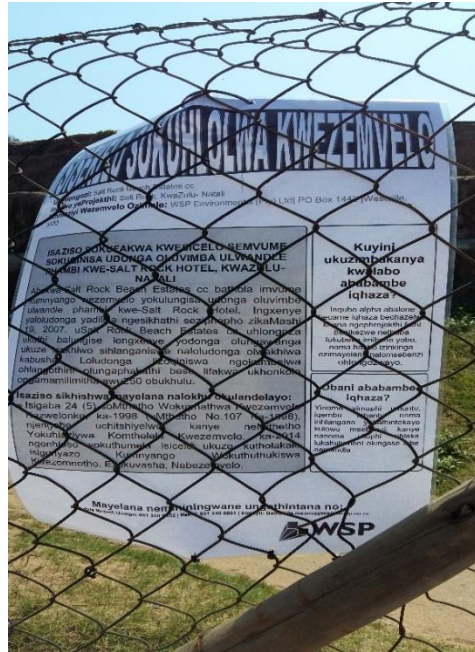
Figure 3: Mid Portion of Sea Wall Location