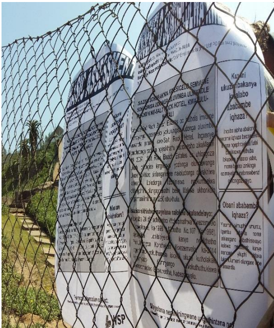
Figure 2: South End of Sea Wall Location