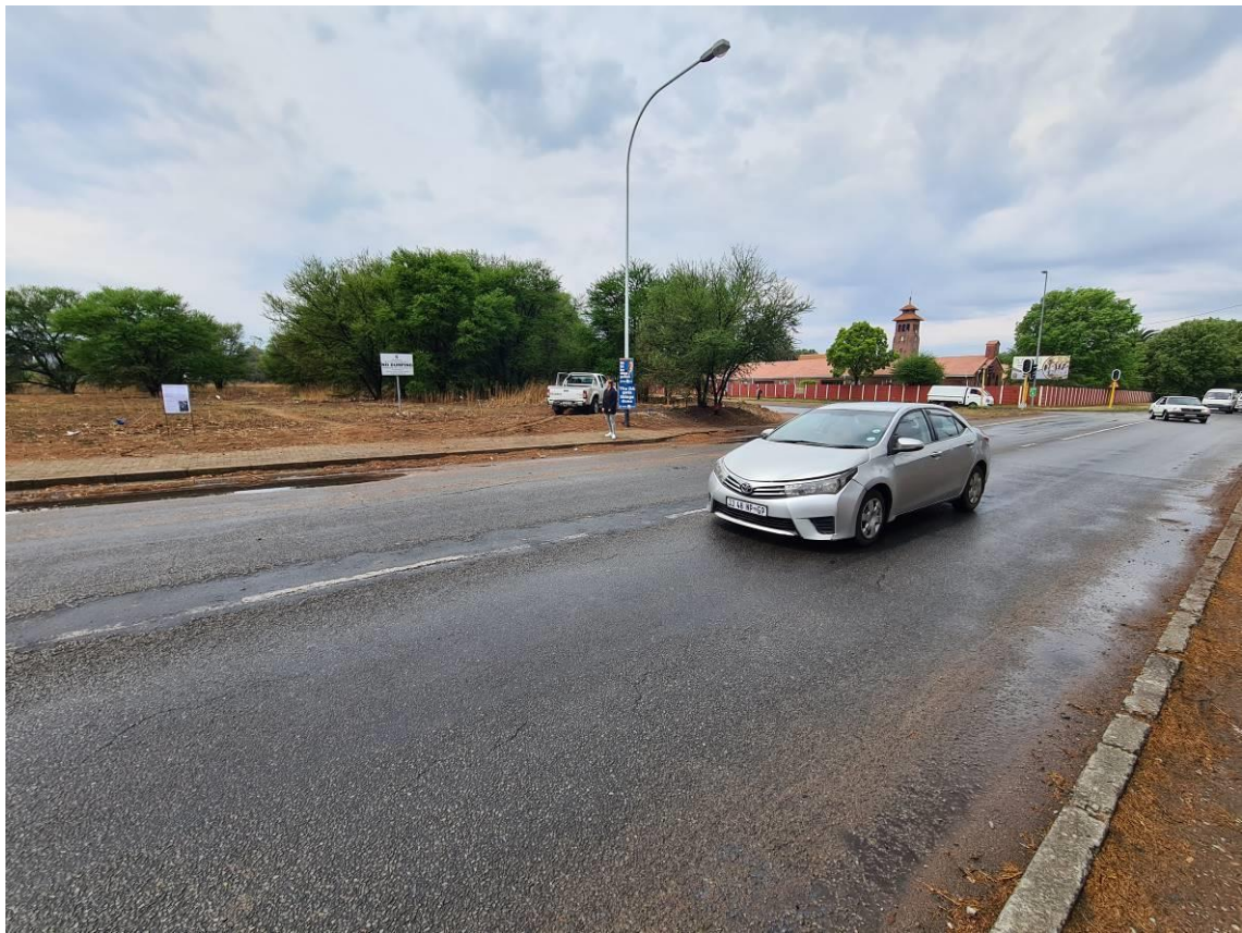
Photo 3. Site Notice at the site on the corner of St. Dominic's and Kruger Street.