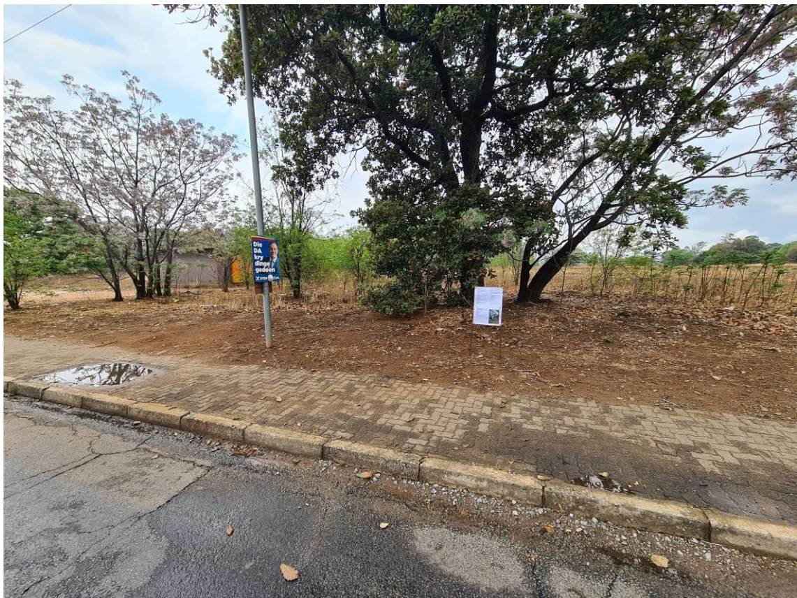
Photo 4. Site Notice at the site by the intersection of Kruger and Du Plessis Street.