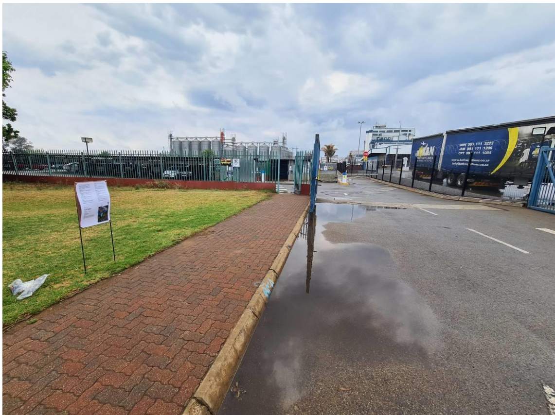
Photo 2. Site Notice at the main entrance of the Unilever Factory off St. Dominic's Street.