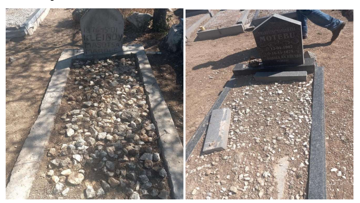
Figure 2& 3: Some of the damaged graves

The current issue is that there are people busy erecting iron corrugated informal housing around the burial ground. When the complainants go and check the side, they always see new housing.