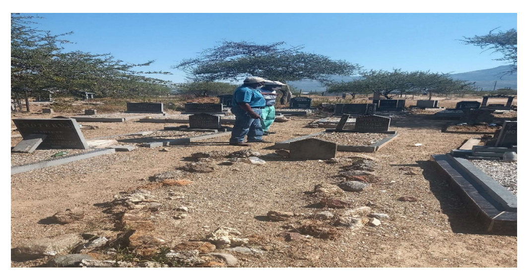
Figure 1: The burial Ground

It was stated that the yard was fenced, and the invaders destroyed the fence in 2020. The Complainant, who is currently 67 years, approached the Tribal Authority for assistance but there was no success. A Case was opened and heard in Schoonoord court wherein it was dismissed indicating that the complainants are refusing services to be brought to the people.