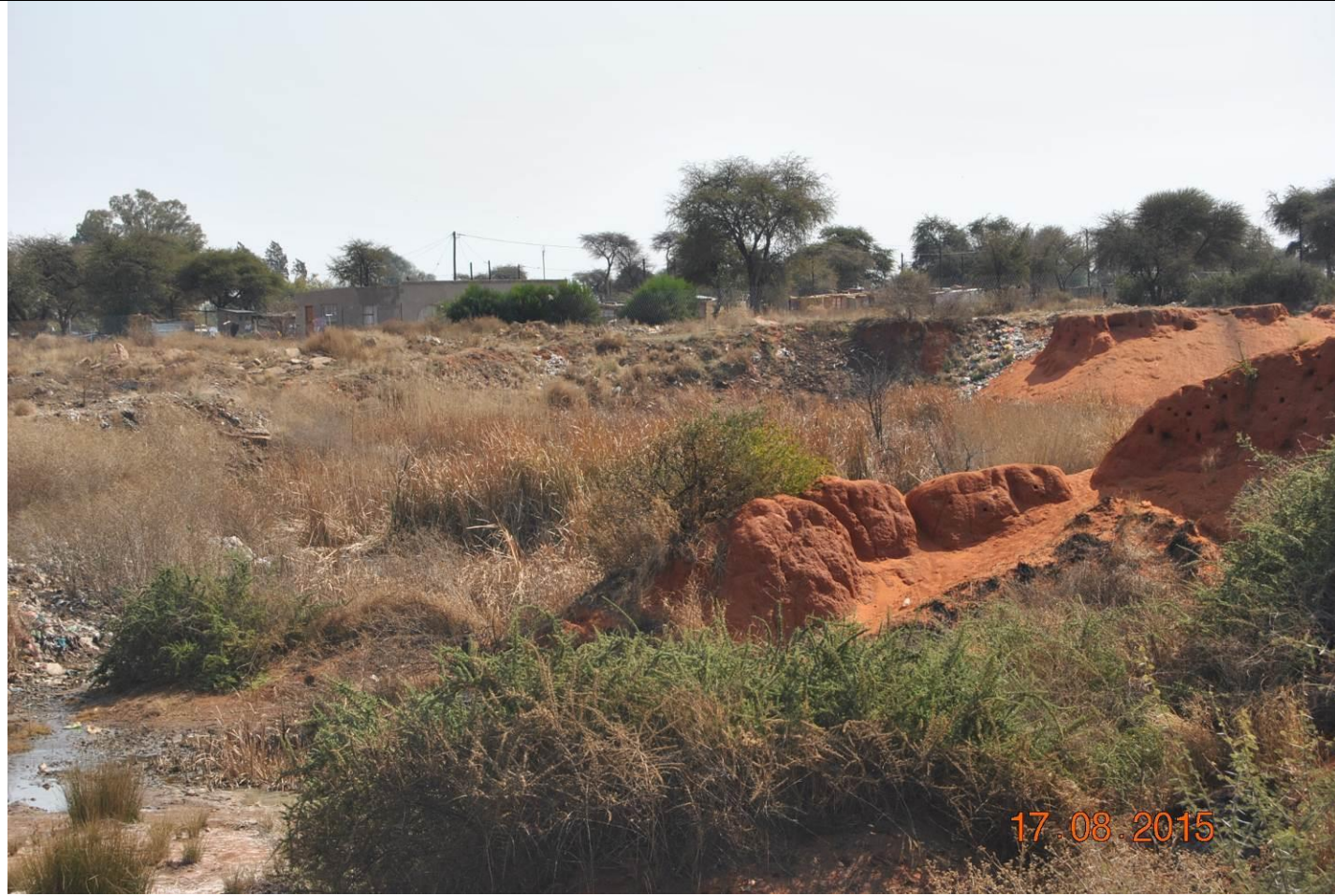
Evidence of the wetland to the left, previous quarrying and erosion to the right.