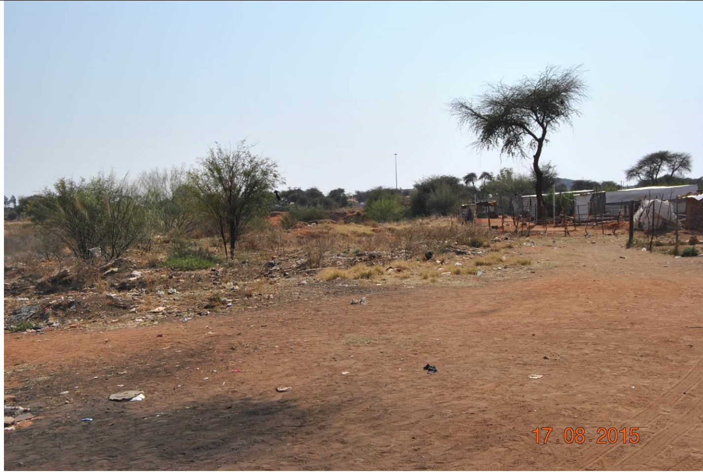
Semi-formal housing within the existing perimeter of the landfill