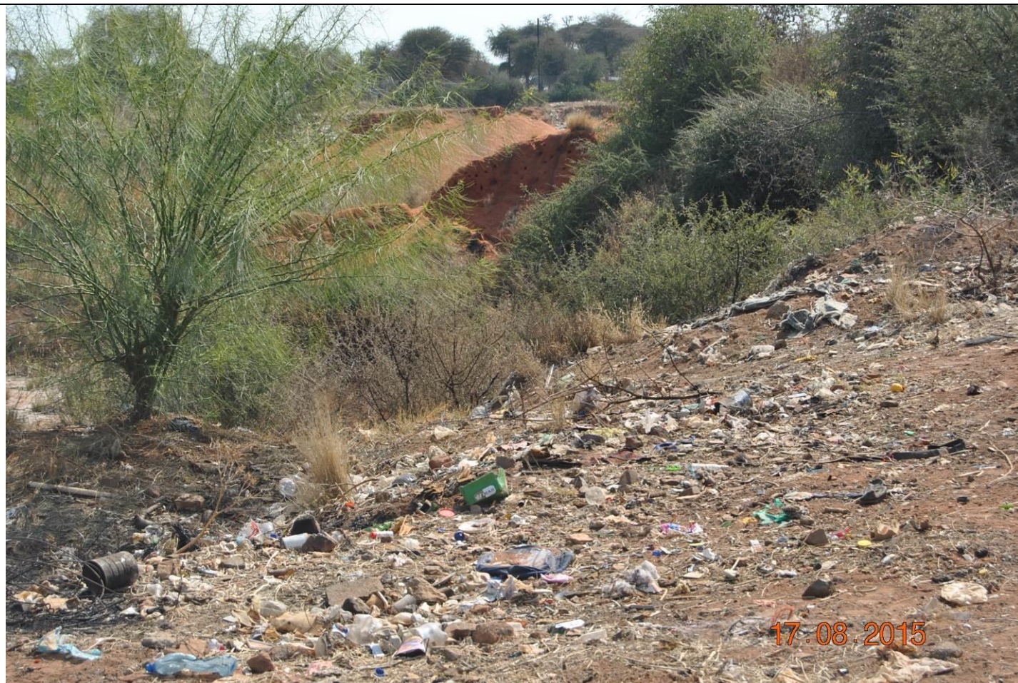
Illegal dumping within the landfill perimeter.