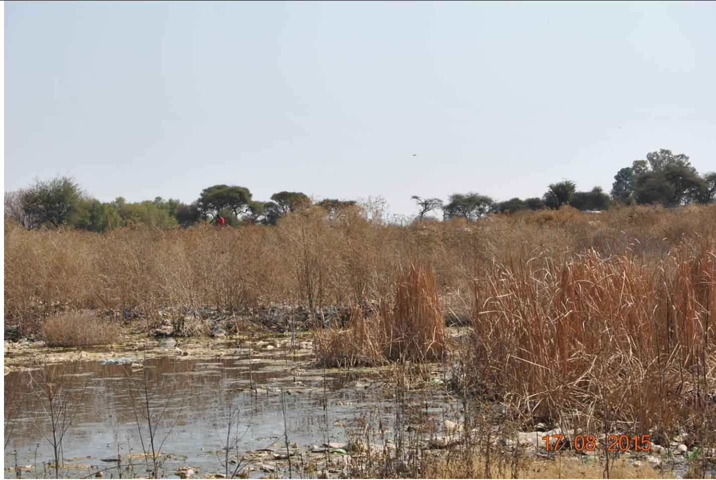
Wetland in the centre of the landfill