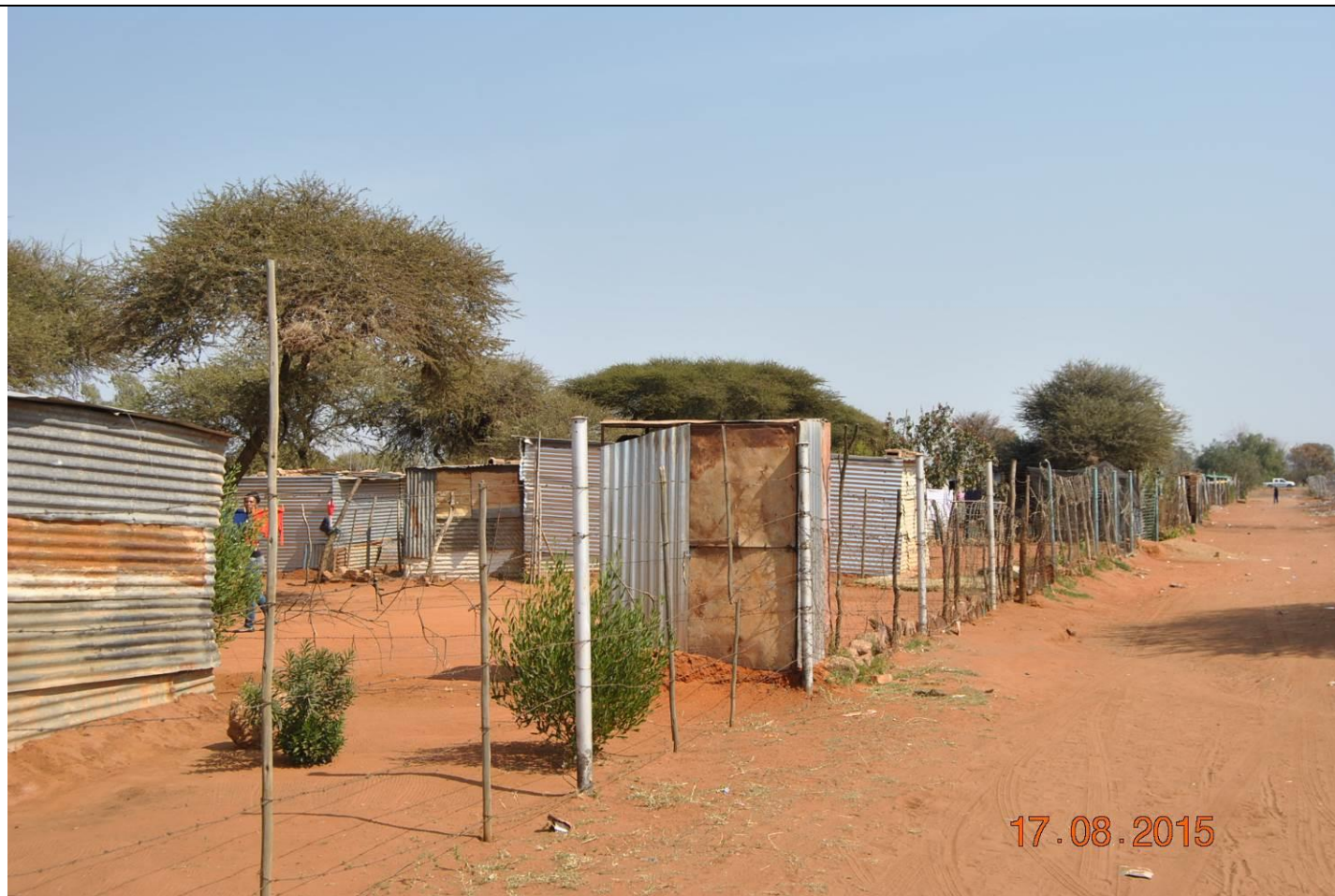
Semi-formal housing within the landfill boundary, on the eastern side.