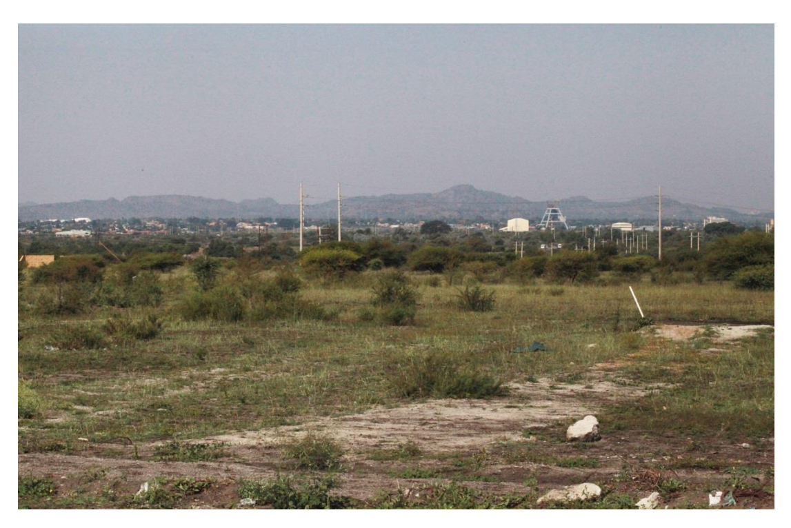
Photo 4 View of the study area alongside the R 510 road.