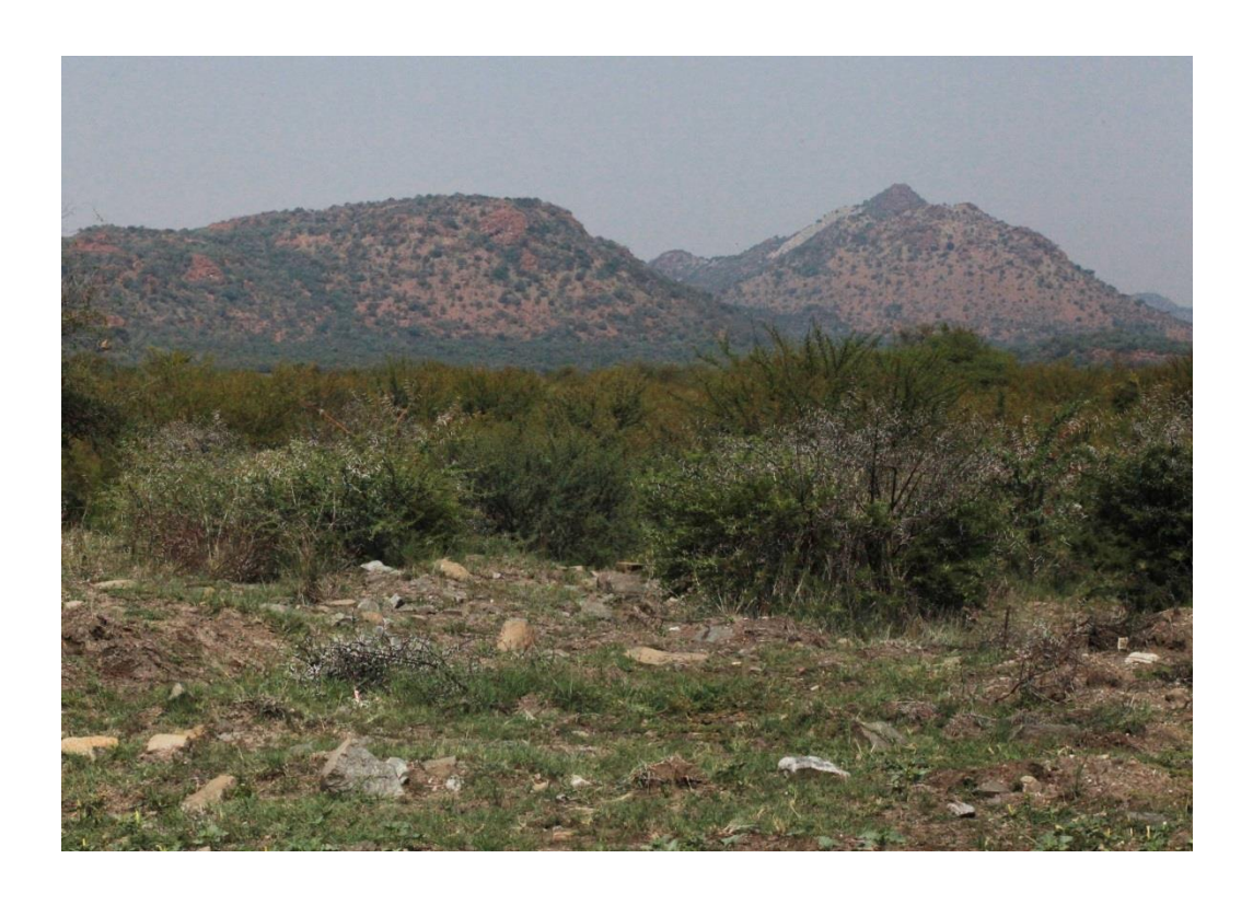
Photo 5 Loose stones and building material at ecologically disturbed area at Stream Crossing A at the site.