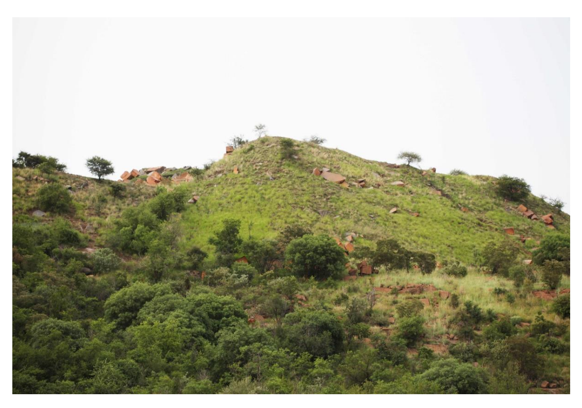
Photo 1 Area at rocky hill where excavations have taken place.