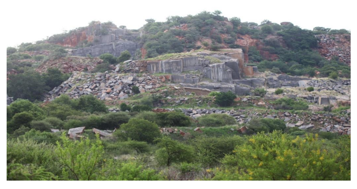
Photo 2 Mining activities are conspicuous on the northern side of the rocky hill of the study area.