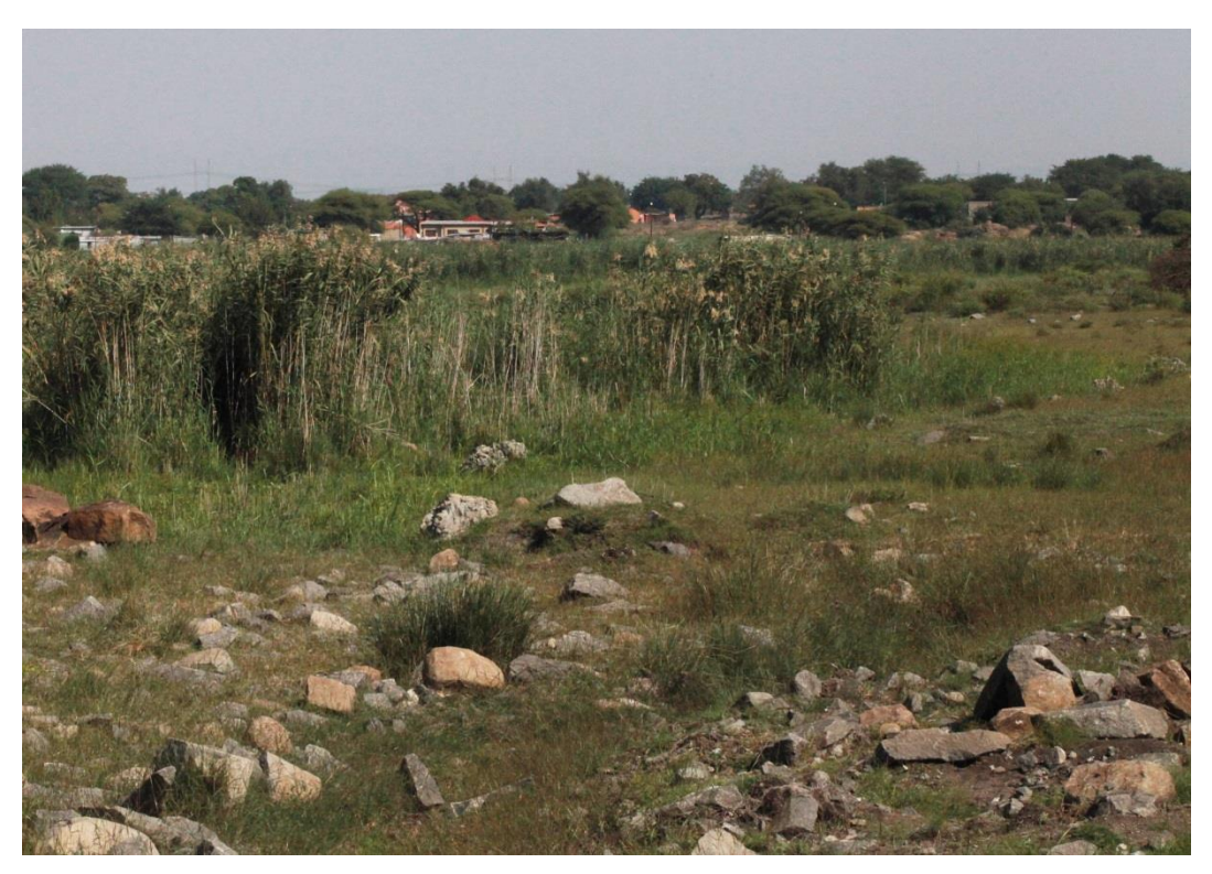
Photo 7 Small narrow drainage line opposite the road at Stream Crossing 3. This narrow drainage line runs towards the Bospoort Dam.