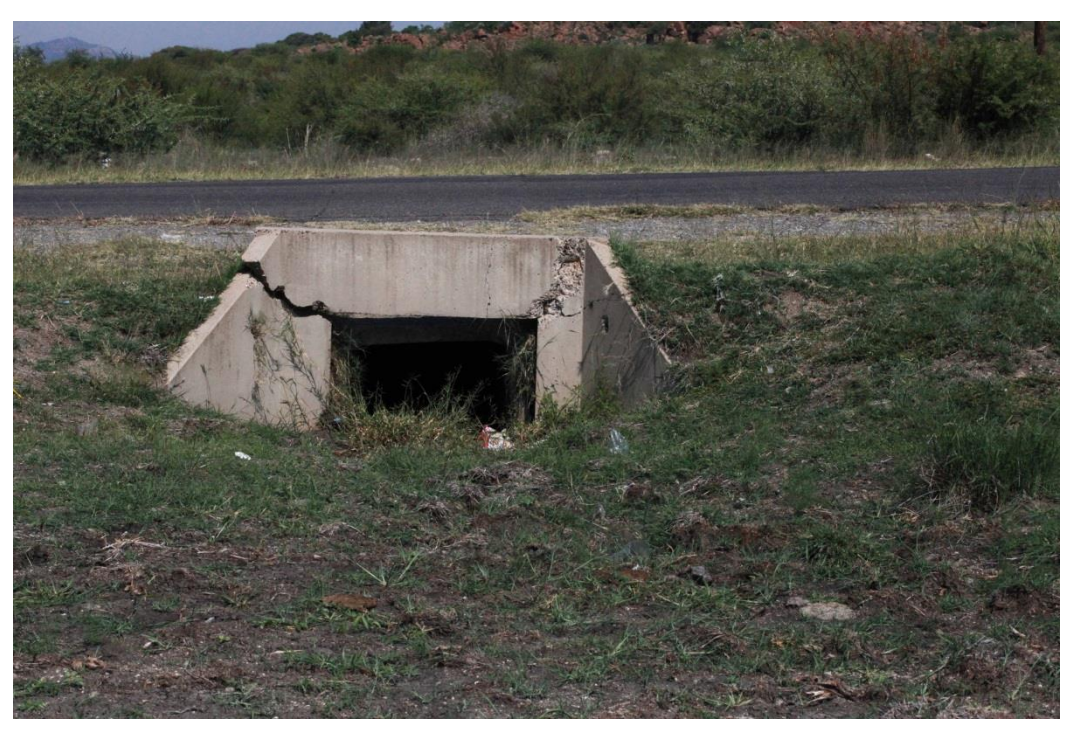
Photo 6 Culvert at the northern side of the tar road at Stream Crossing A.