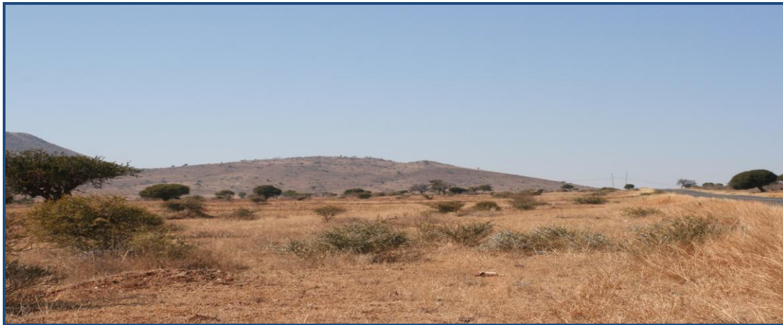
Figure 5: View of the tarred road to Sebitse from the proposed Tshatane substation 1