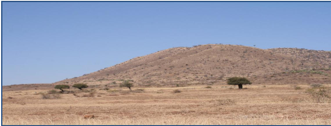
Figure 4: View of the low mountains from south west of Tshatane substation Alternative 1