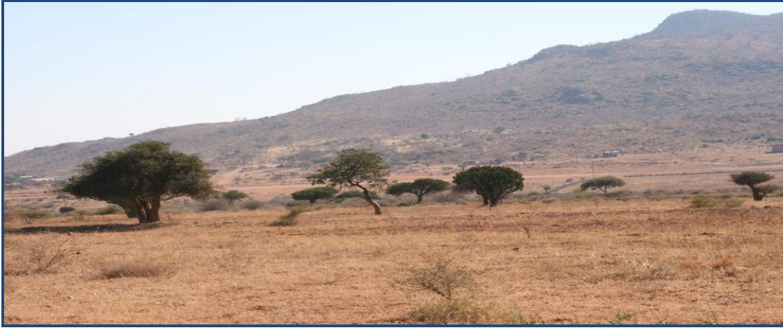
Figure 1: Alternative 1: Tshatane substation