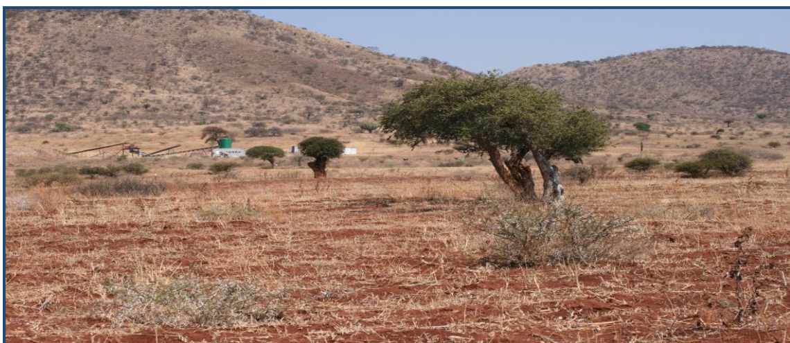
Figure 6: Structures to the south east of route alternative 1