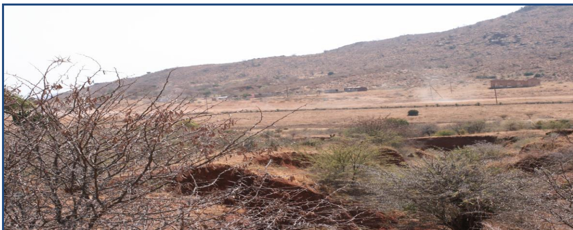
Figure 3: Eroded non-perennial river to the north west of Tshatane substation_Alternative 1