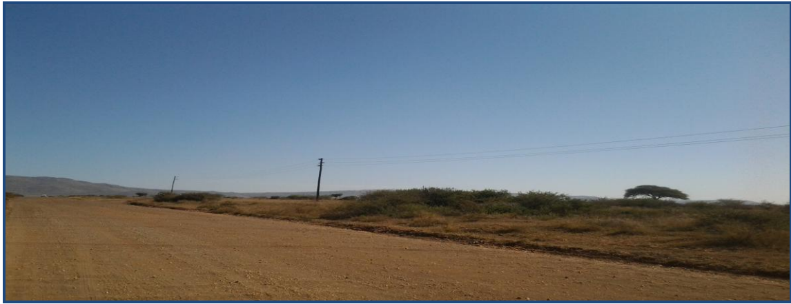
Figure 39: Gravel road near Marulaneng