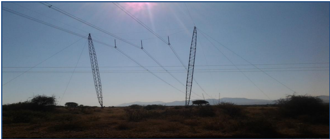
Figure 40: Alternative 1 & 2 will run parallel the existing line near Marulaneng