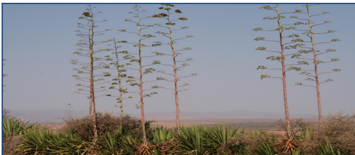
Figure 35: Agave americana demarcates agricultural fields