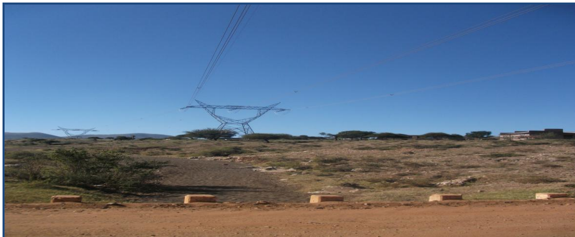
Figure 34: Option two will run parallel the existing line, next to a non-perennial river. There is no adequate ROW