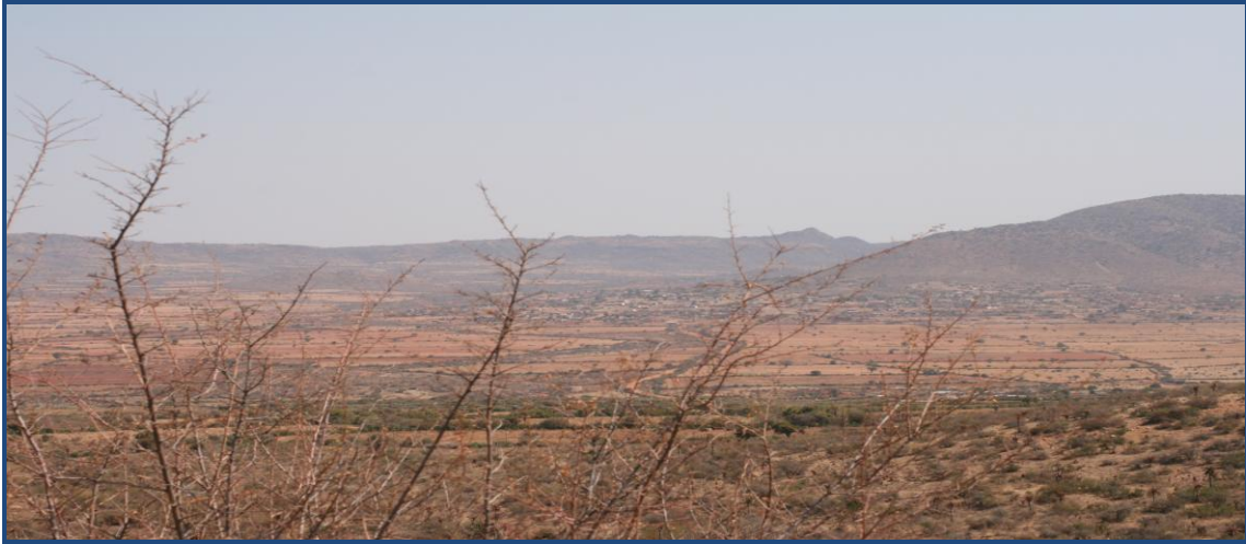
Figure 36: View of the lanscape that the lines will traverse