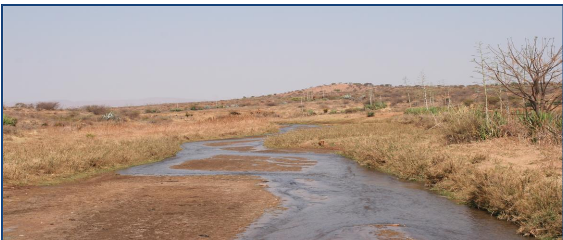
Figure 38: The lines will cross Lepellane River, absence of the riparian zone should be noted