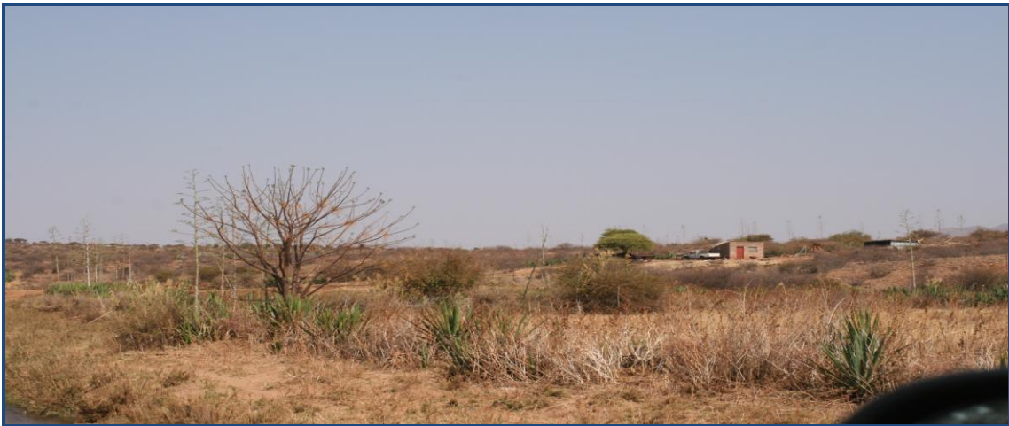
Figure 37: The lines will traverse behind the structure/house