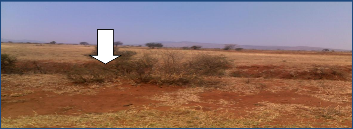
Figure 42: Erosion dongas within the project area