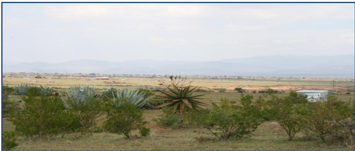
Figure 45: View of the areas to the north of substation