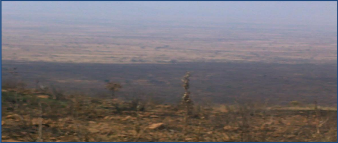
Figure 41: View of the open veldt the lines will cross