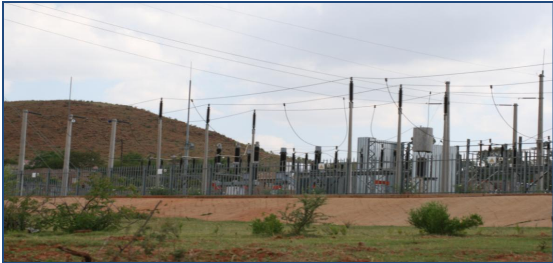
Figure 47: Existing Jane Furse substation