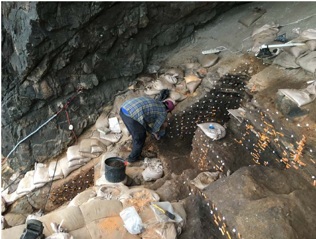
Figure 6. Current extent of excavation, showing long section along west wall. Photo date: July 11, 2018