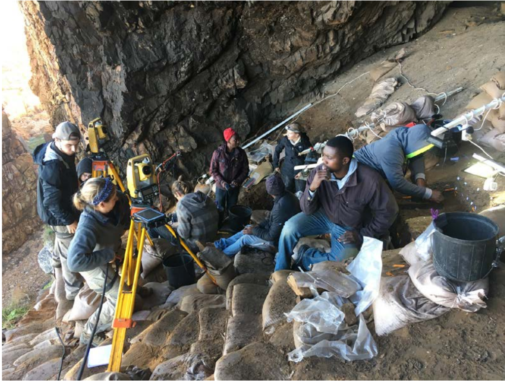
Figure 7. Site excavation. Photo date: June 20, 2018