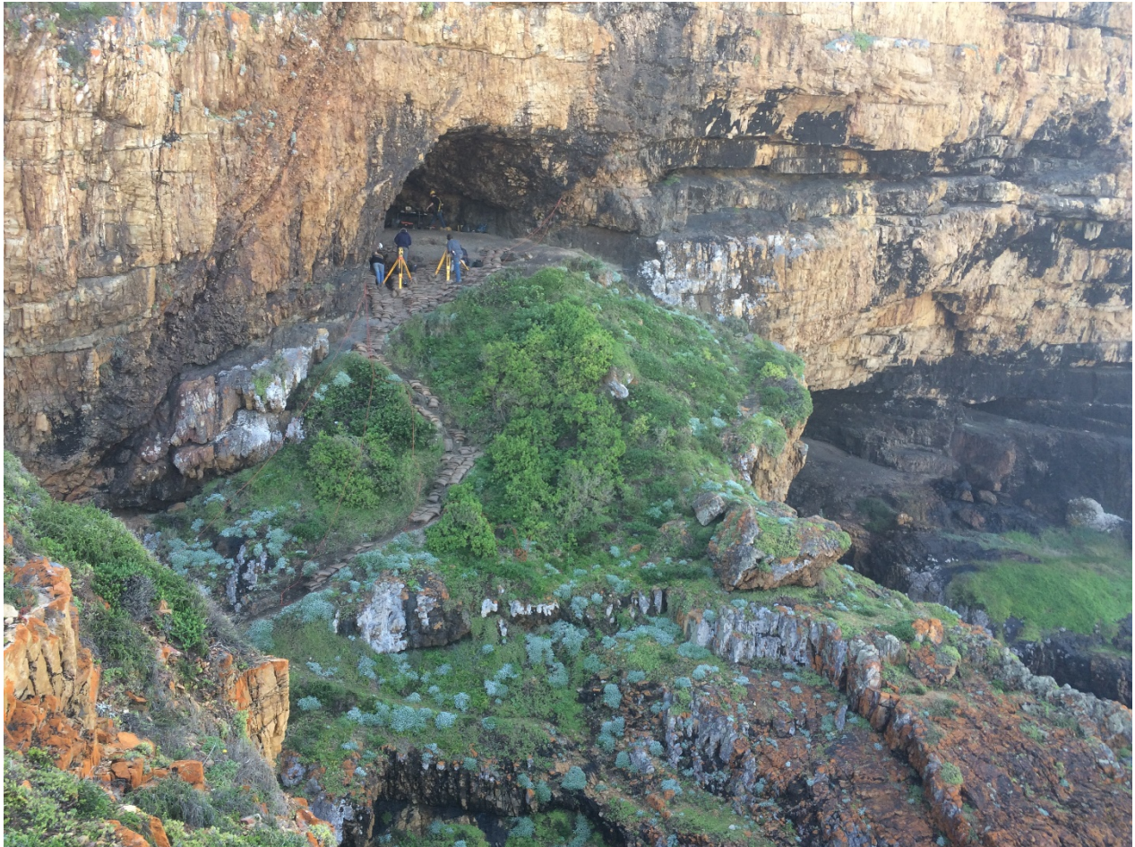
Figure 2: KEH 1 during July 2015 excavation