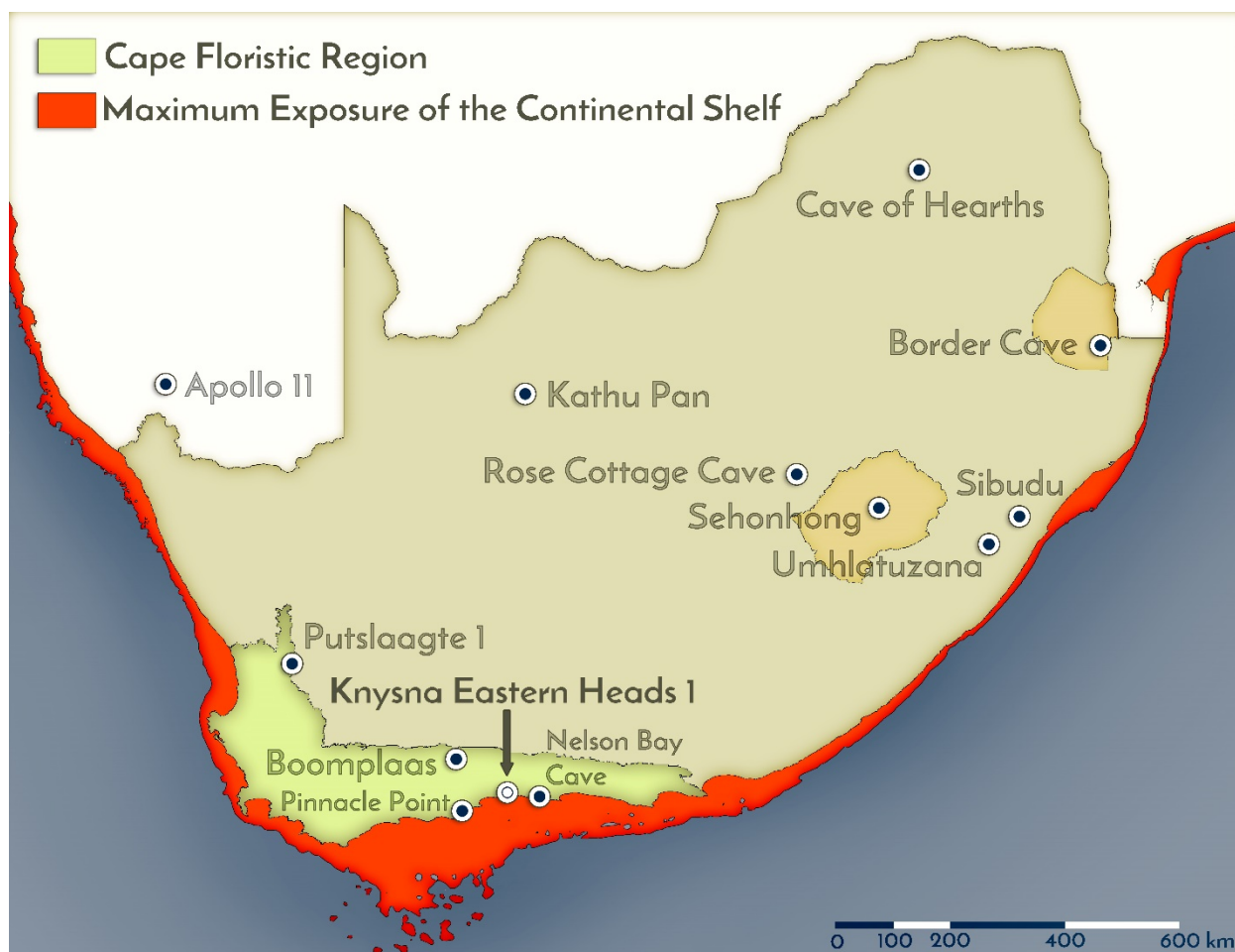
Figure 1: Map showing the location of KEH 1 together with other MSA and LSA localities.

The archaeological site at Knysna Eastern Heads Cave 1 (KEH 1) , see Figure 1) was identified in 2012, and excavated under HWC permit 2237 beginning in December of 2013. This permit was renewed in 2016 and is currently valid through February 23 rd , 2019. To date, a total of twenty-seven weeks of excavation have been completed – primarily in July and August each year of 2015 through 2018. The study of KEH 1 is a multidisciplinary project involving research scientists from South Africa, the United States, Canada, Brazil, Spain, and Australia. In addition, more than two dozen students from four countries, including South Africa, have participated in the associated research and fieldwork. The KEH-1 project is funded through grants from the U.S. National Science Foundation, the Leakey Foundation, the Templeton Foundation, the University of Texas at Arlington, the Hyde Family Foundation, and private U.S. donors. Initial results have been presented at conferences and workshops in the U.S. and South Africa, and peer review publication is in preparation.