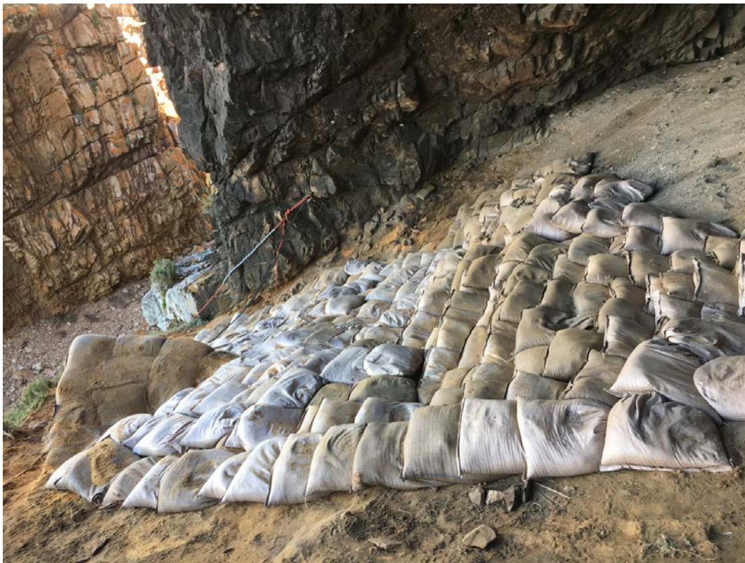
Figure 8. End of season sand bag barrier. Photo date: July 13, 2018