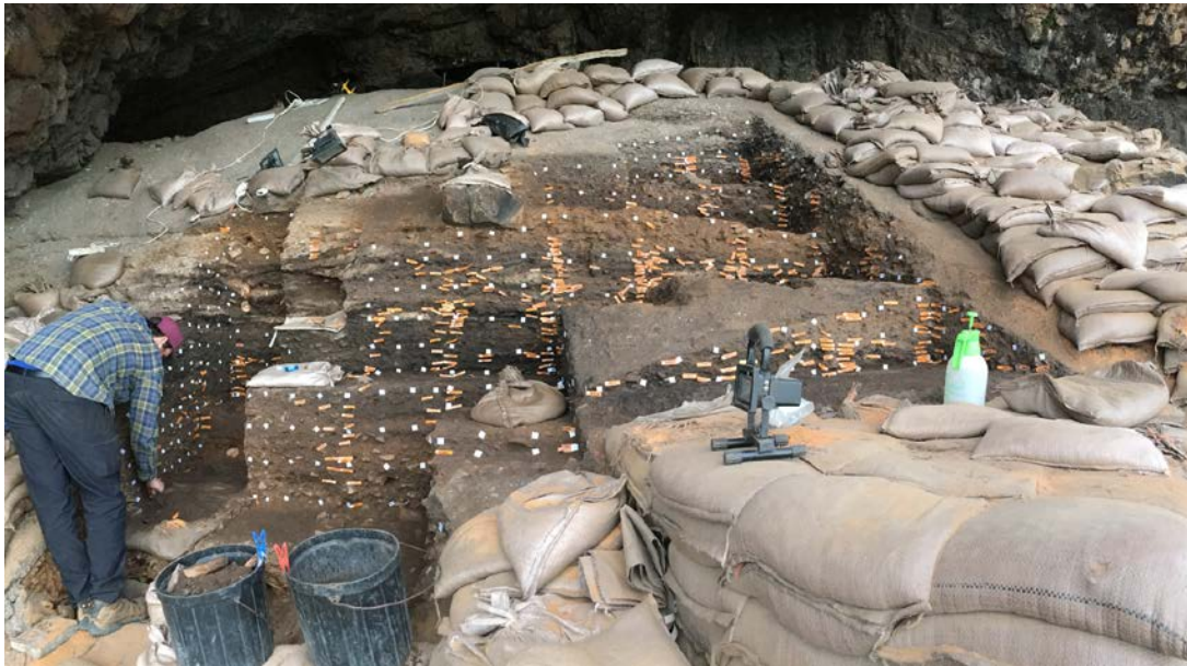
Figure 5. Current extent of excavation. Photo date: July 11, 2018