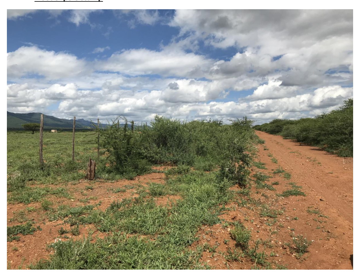
6. Picture no 6: showing where the power line will be running

5. <u>Picture no 5 : showing where the power line will be running and the dismantled woodenpole stump</u>