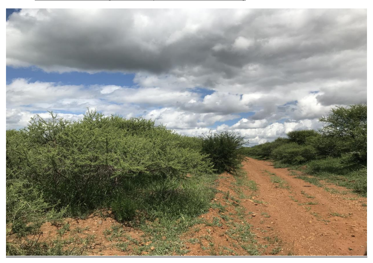
<u>8 Picture no 7: showing the power line will be running, wooden pole stump and property boundary fence</u>