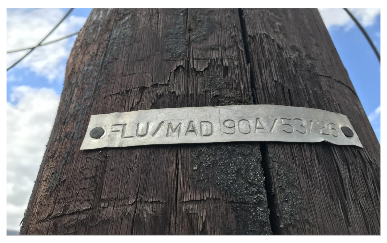
2. Picture no 2: showing the Existing Power pine and the access road