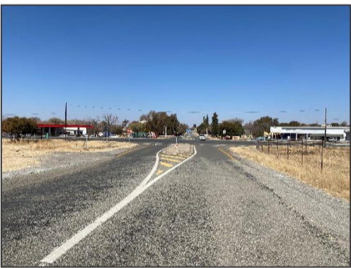
Plate 10: Power Line will cross over Bree Street.