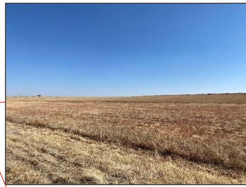
Plate 2: Taken towards the west. Plate 7: Passing underneath an existing power line.