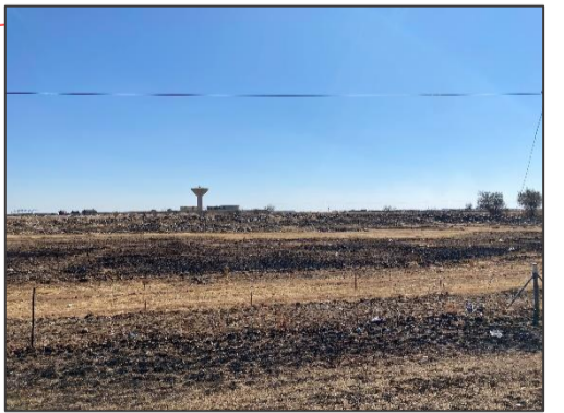
Plate 19: Waste disposal site located within corridor. Water tower visible on the horizon.