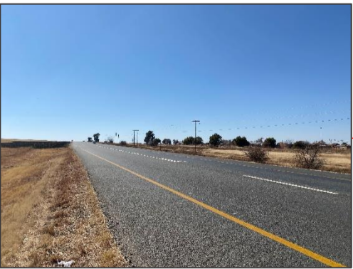
Plate 14: View of the R30 and a portion of power line corridor taken towards the north.