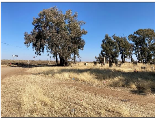
Plate 13: Cemetery located within corridor.