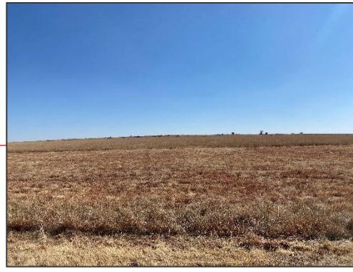
Plate 3: Taken towards the north west. Plate 6: Crossing stormwater channel and S478.