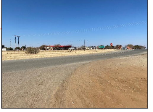
Plate 18: Power Line crossing the S494.