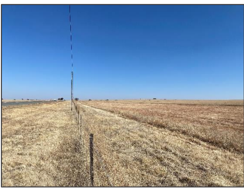
Plate 1: Taken towards the south west. Plate 8: Old quarry within corridor.