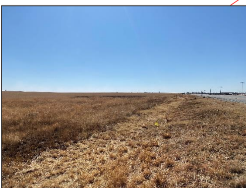
Plate 15: Beginning of power line route.