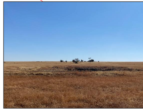
Plate 17: Gravel pit located within corridor.