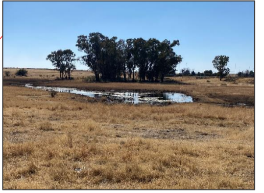
Plate 12: Wetland system within 200m corridor.