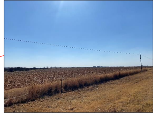
Plate 11: Power line will have to be placed within agricultural fields for ~5,25Km.