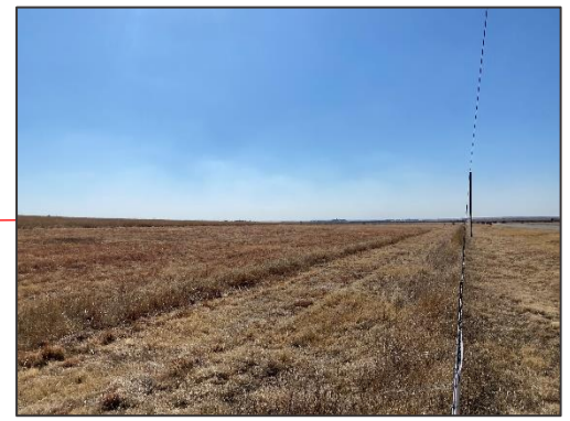
Plate 4: Taken towards the north. Plate 5: Power line will cross R30.