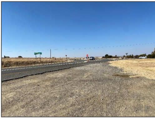
Plate 9: Power Line will cross over the R708.