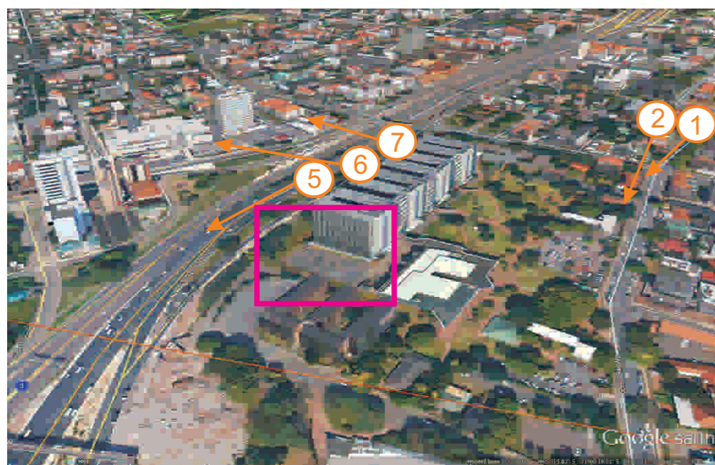
VIEW AT 8 (Ariel view from above)