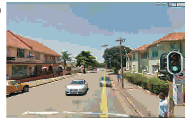
VIEW AT 2 (Down Steve Biko Rd)