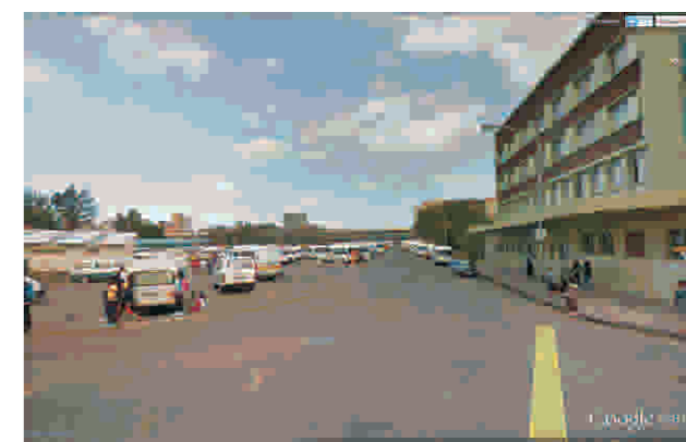
VIEW AT 4 (residential at Hoylake Drive)