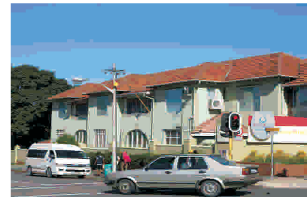
VIEW AT 1 (Building E - Existing un-changed office)