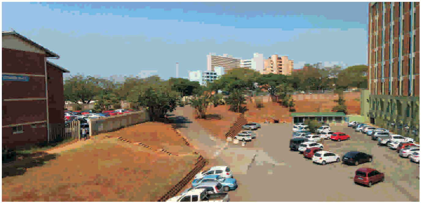
VIEW AT 14 (from the existing library)