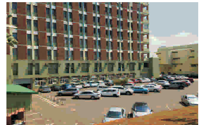
VIEW AT 10