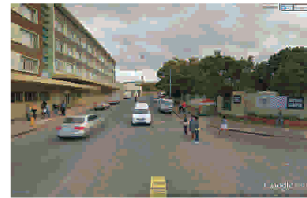
VIEW AT 3 (Steve Biko and )