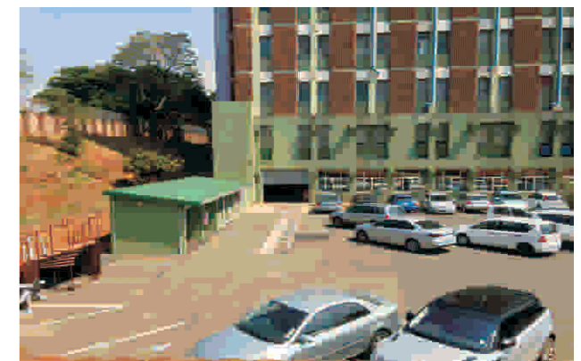
VIEW AT 9 (Position of proposed building)