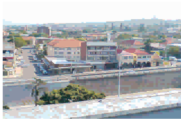
VIEW AT 7 (From above the S-Block and across the N3 highway)