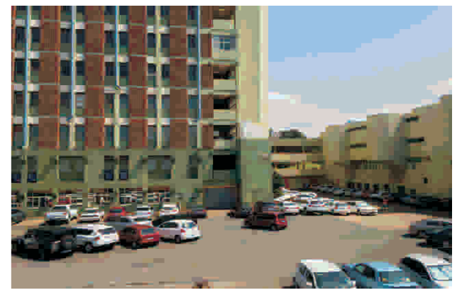
VIEW AT 12