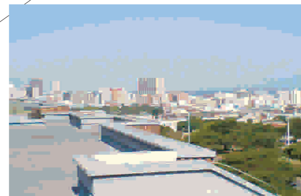
VIEW AT 5 (From above the S-Block and across the N3 highway)