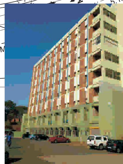
VIEW AT 11