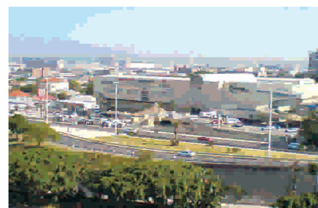
VIEW AT 6 (From above the S-Block and across the N3 highway)