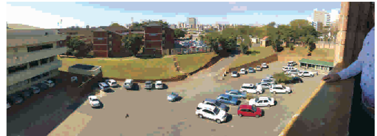
VIEW AT 13

NEIGHBOURING BUILDINGS ON SITE, 47 BOTANIC GARDENS RD