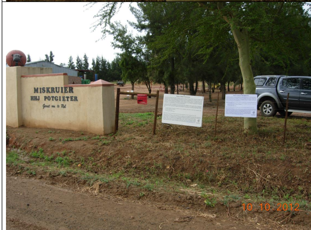
Site Notice Board