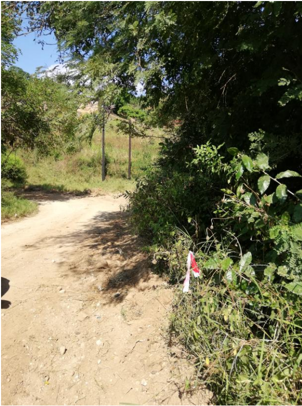
Figure 1 The new t-off point