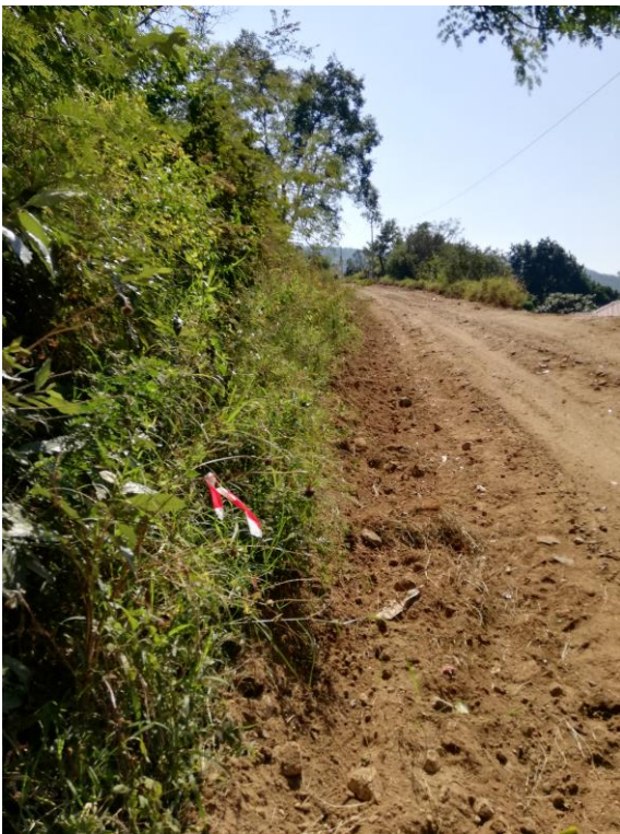
Figure 2 The line runs to the left of the gravel road shown in the picture