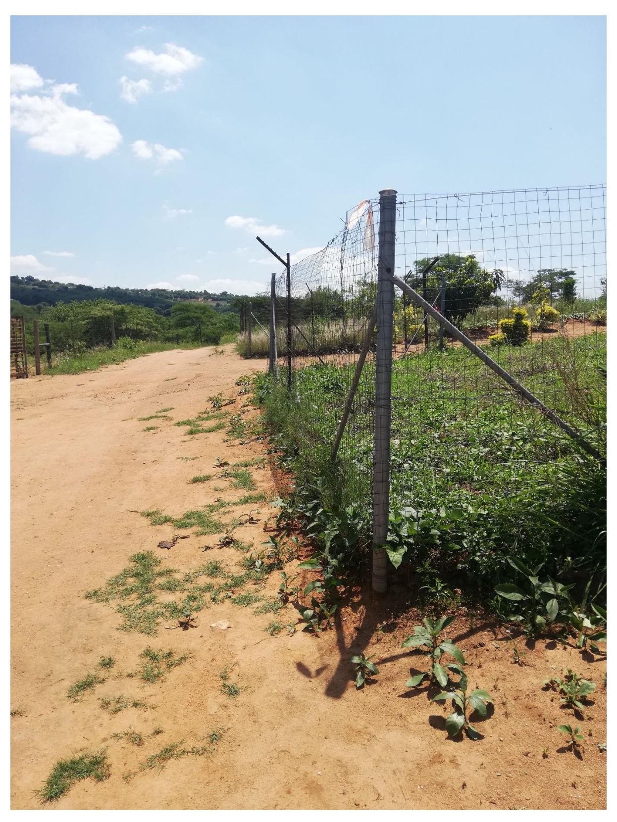
Figure 9 Point of supply and Transformer position