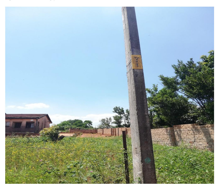
Figure 2 The T-Off pole