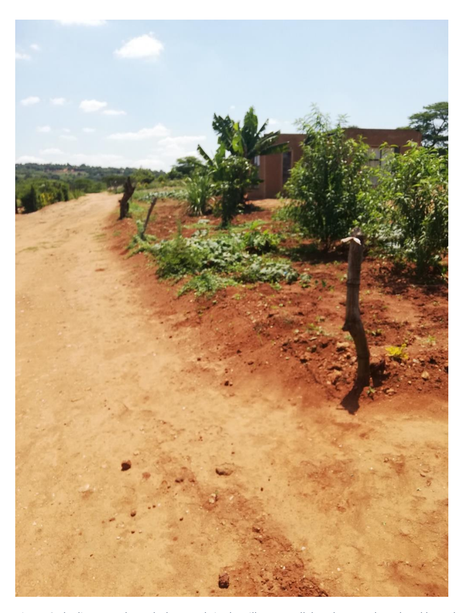
Figure 8 The line runs through the stands in the village parallel to the gravel road and boundary fence