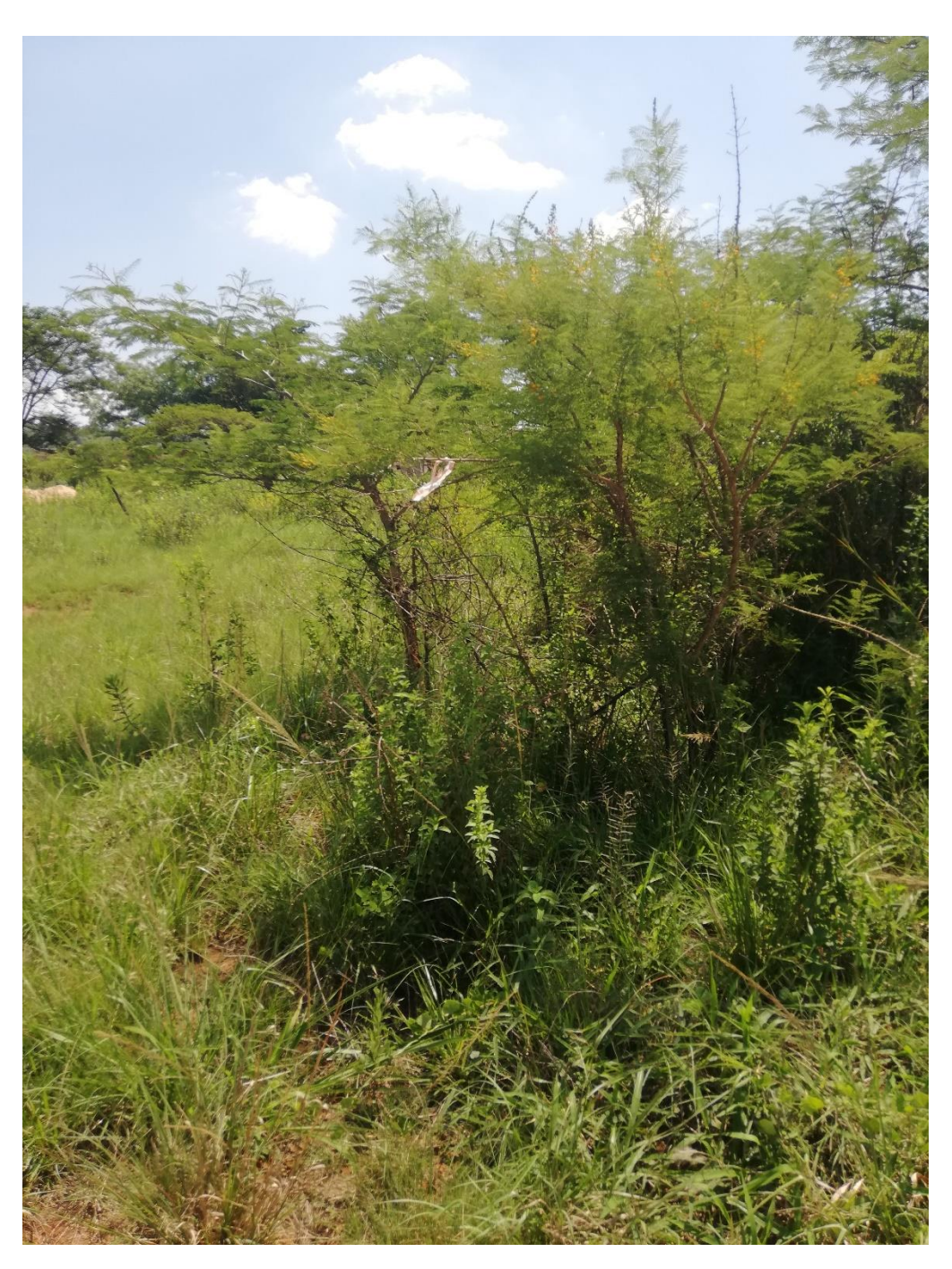
Figure 7 Pole position along the dirt road