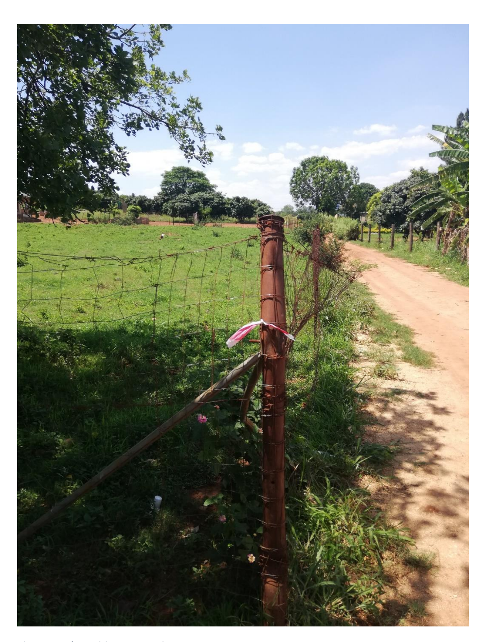
Figure 4 Pole position peg on site