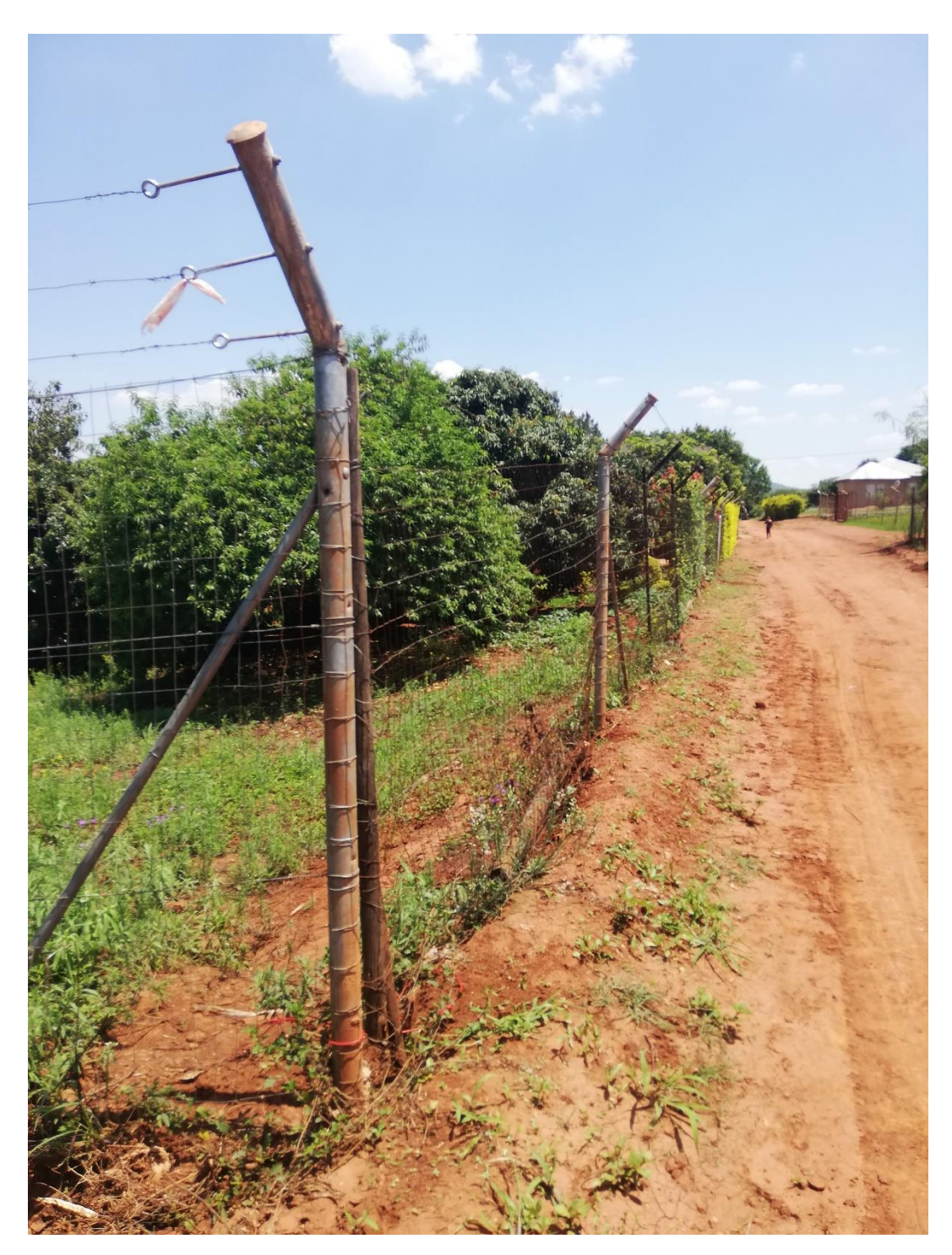
Figure 3 Pole peg in the field