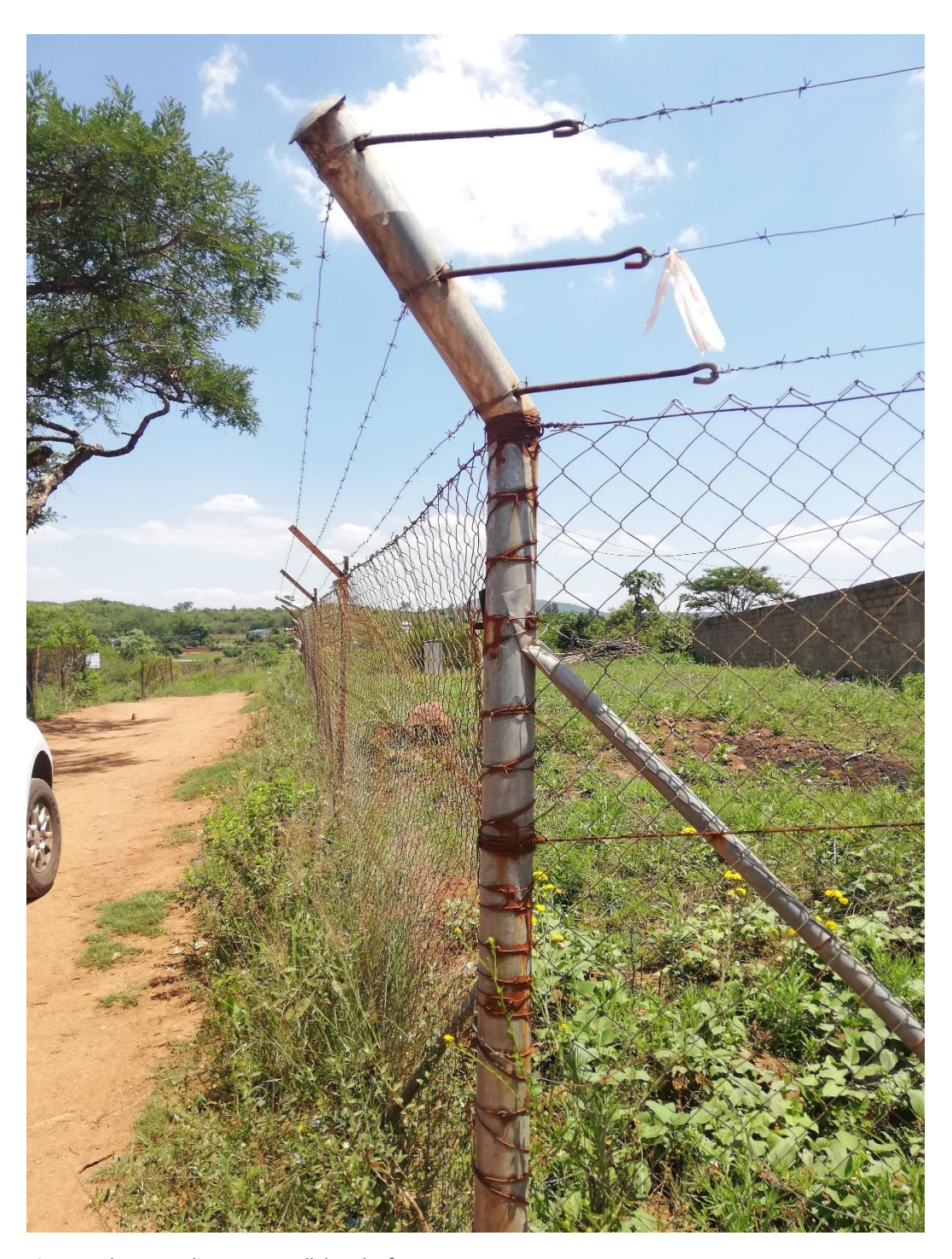
Figure 5 The power line runs parallel to the fence