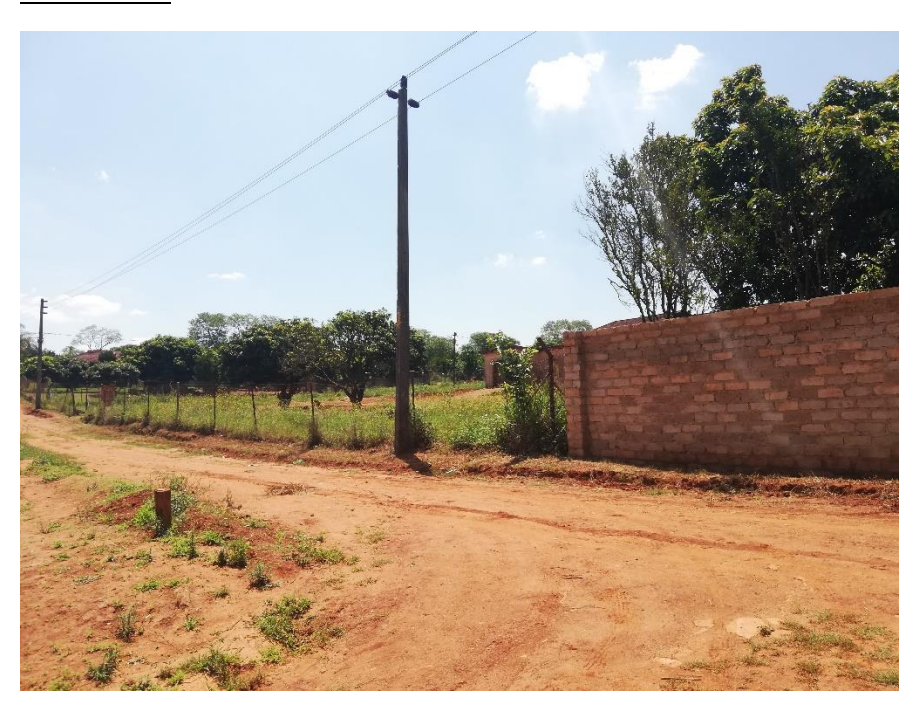
Figure 1 The existing power line on site