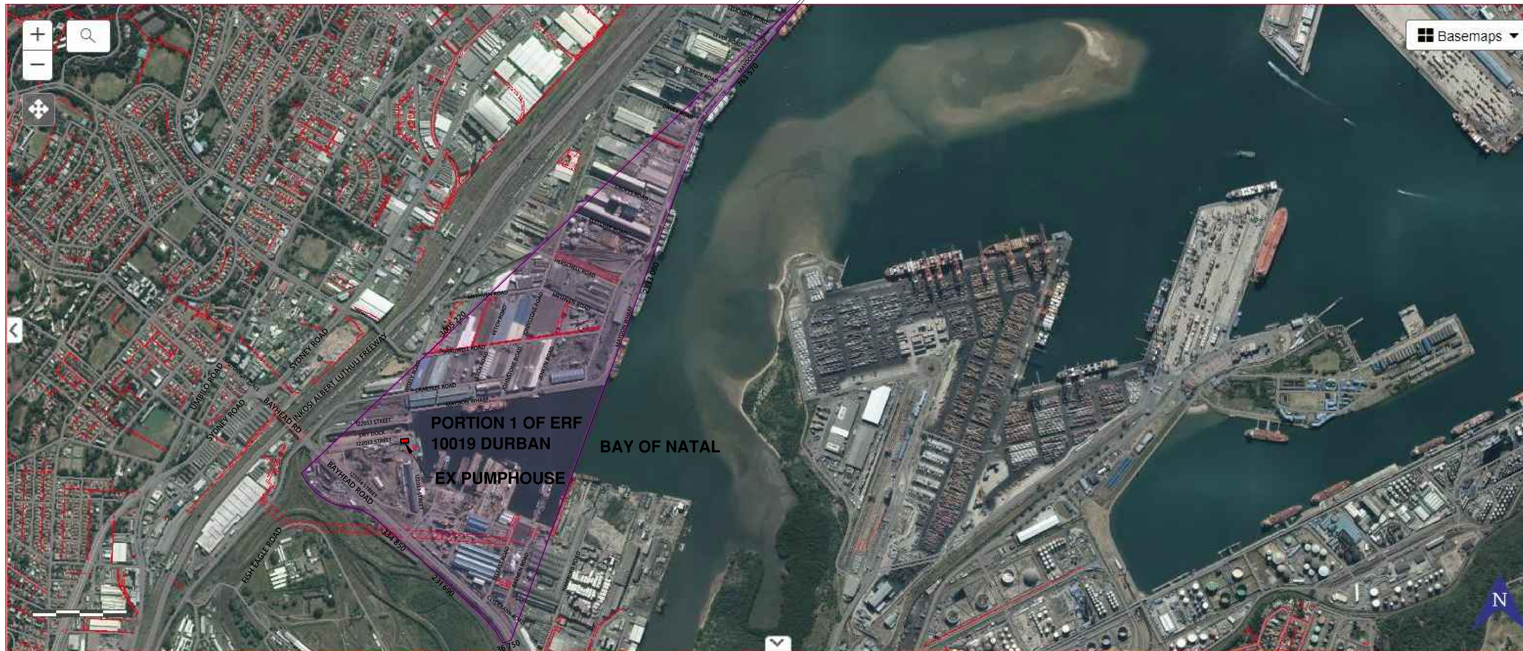
W E S N SITE & LOCALITY PLAN (scale 1:10 000)

OCCUPANCY CLASSIFICATION: LOW RISK COMMERCIAL - B3