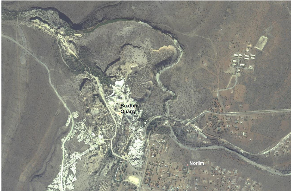
Figure 2-2: Site layout