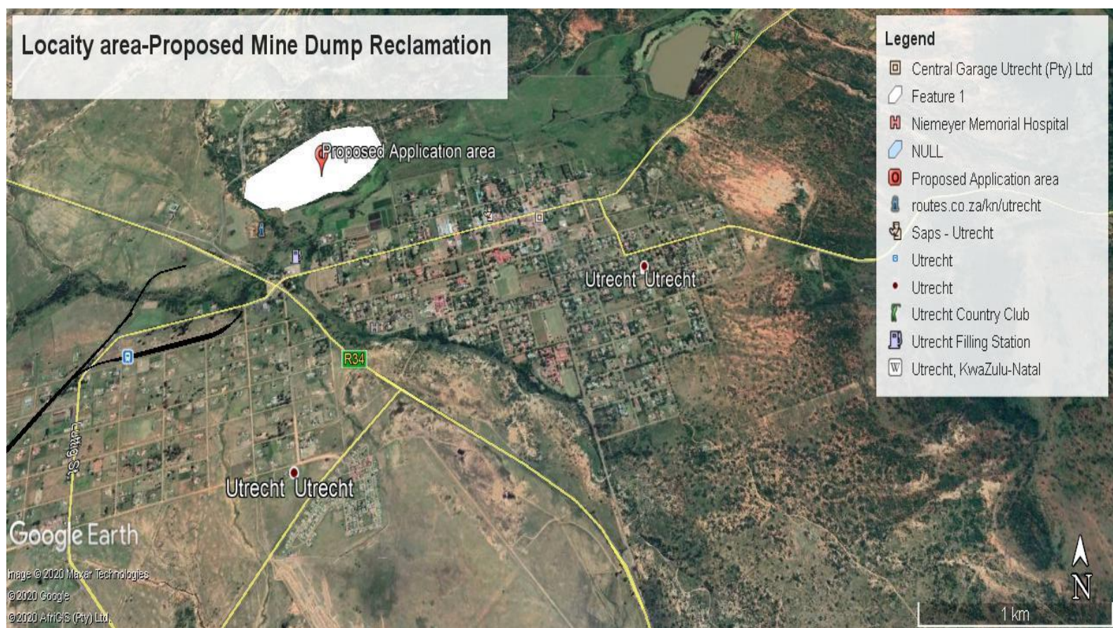
Figure 1: Study locality area

The mining site is located at Utrecht area under Emadlangeni Local Municipality and Amajuba Magisterial District. The mining project covers an area of approximately 41.5 hectares in total. See figure 1 below, the map showing the location of the proposed mine dump.