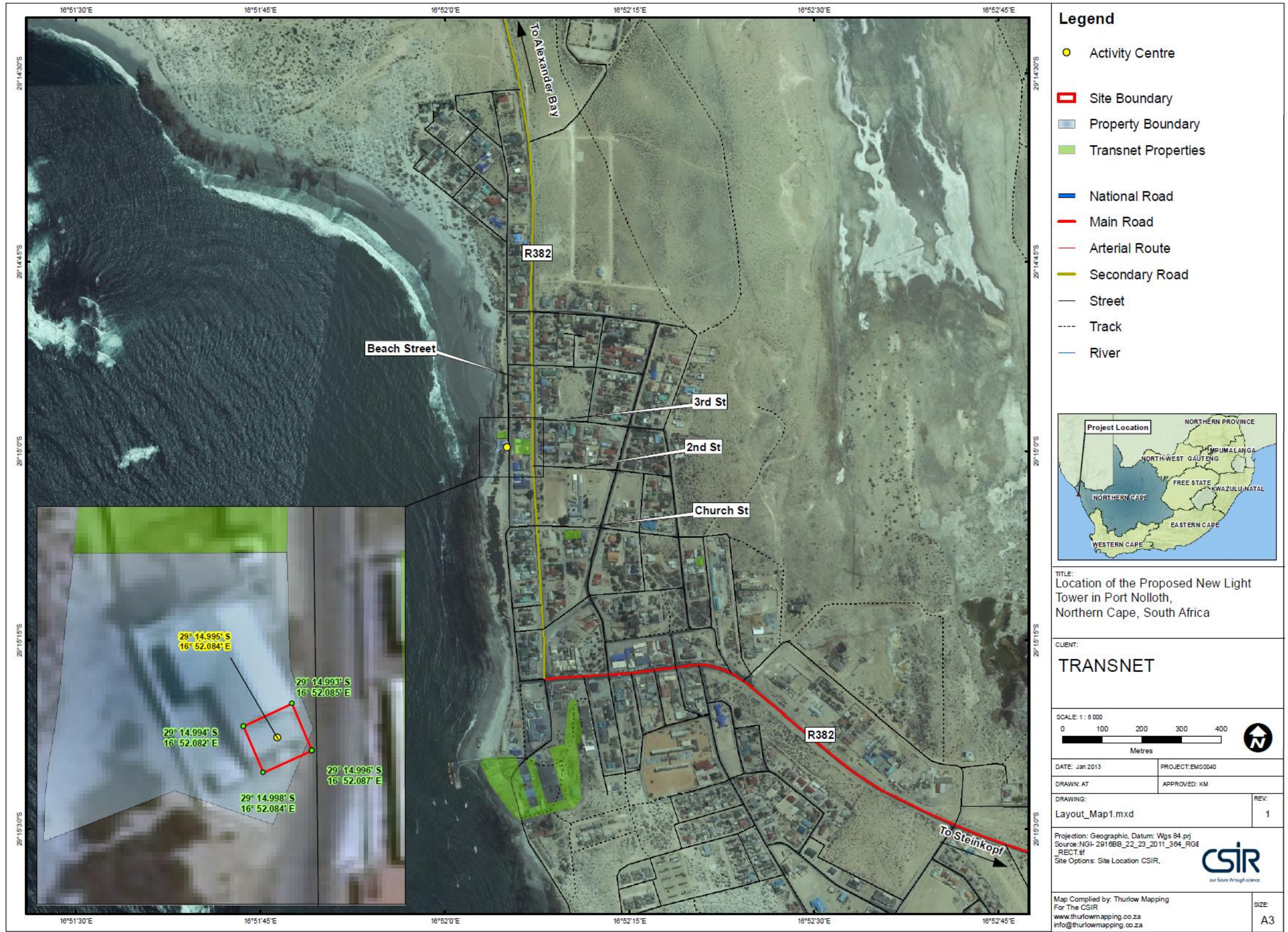
Appendix A.1: Locality map