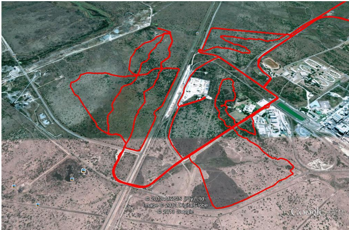
Figure 5 GPS track of the surveyed area 2 . North reference is to the top.

If required, the location/position of any site was determined by means of a Global Positioning System (GPS) 1 , while photographs were also taken where needed. The survey was undertaken by doing a physical survey via off-road vehicle and on foot (Figure 5). The size of the area that was surveyed is approximately 8 000 Ha and the survey took four eight hours to complete.