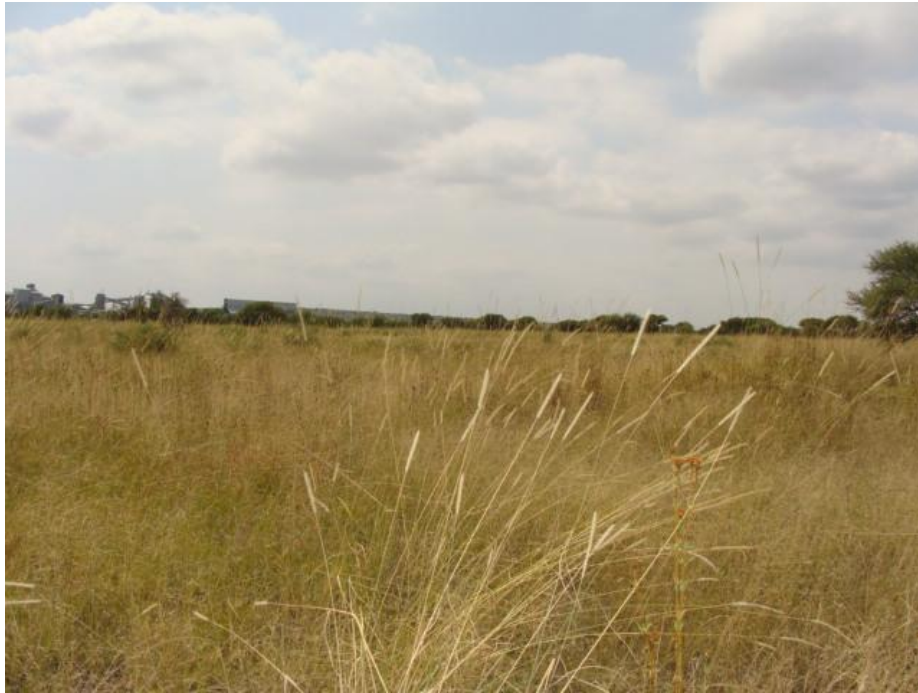
Figure 8 General view of the vegetation in the area of option 2 for the Waste Rock Dump.