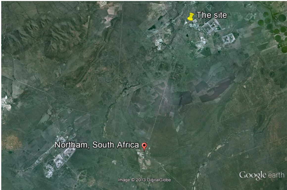
Figure 2 Location of the site in relation to the town of Northam.