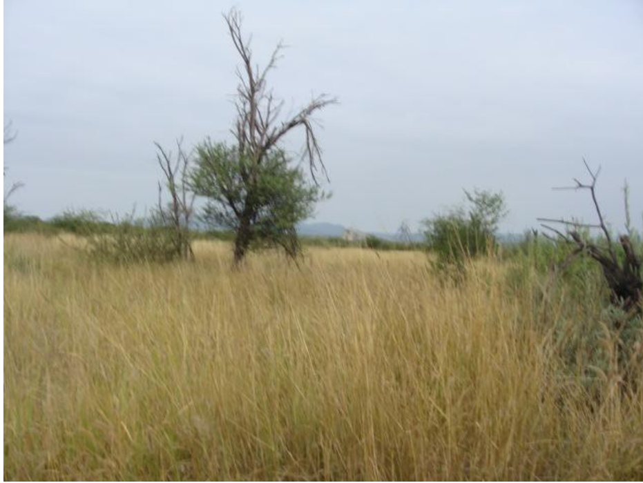
Figure 6 General view of the vegetation cover at the preferred site for the Waste Rock Dump.