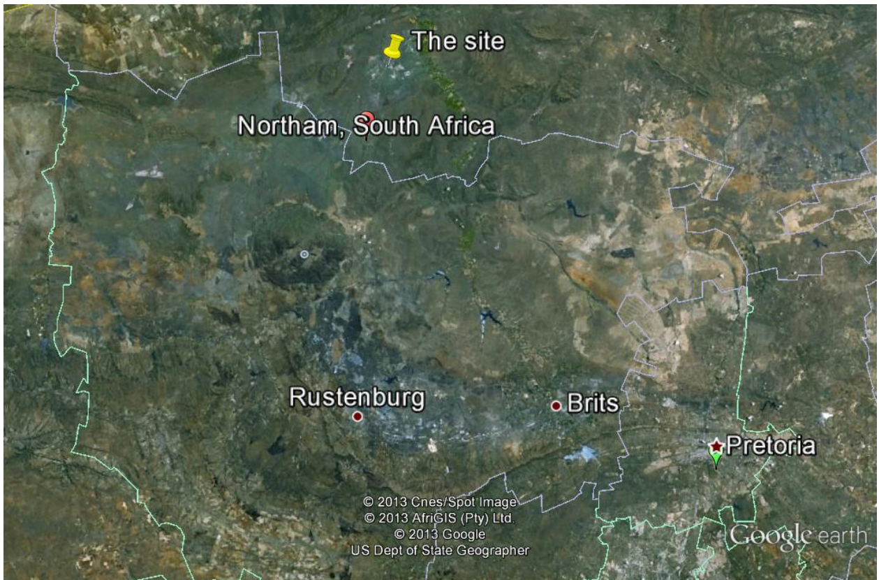
Figure 1 Location of the surveyed site in the Limpopo Province.

The development would entail the sinking of the central shaft as well as the associated infrastructure needed for its operation. This includes a waste rock dump, access roads, a railway link, ventilation shaft, ore silo, offices and other buildings, parking area and other necessary infrastructure.