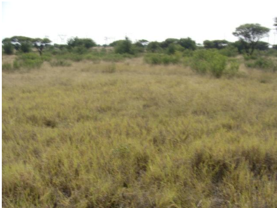
Figure 7 General view of the vegetation cover in the area where the Central Shaft is planned. This is also option 1 for the Waste Rock Dump.