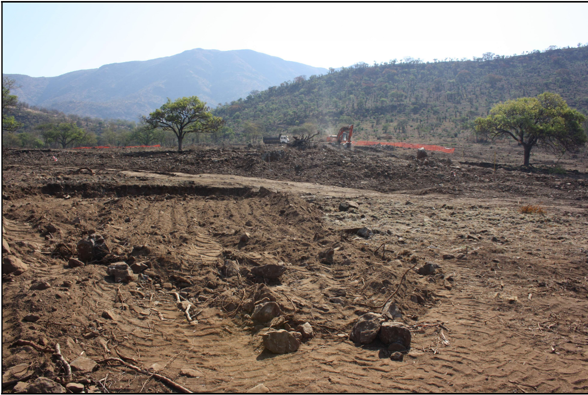
Figure 4: View of the affected site under construction

The site is situated at the following global positioning system co-ordinates South 24° .59' .25.1" and East 29 ° .53.56.01