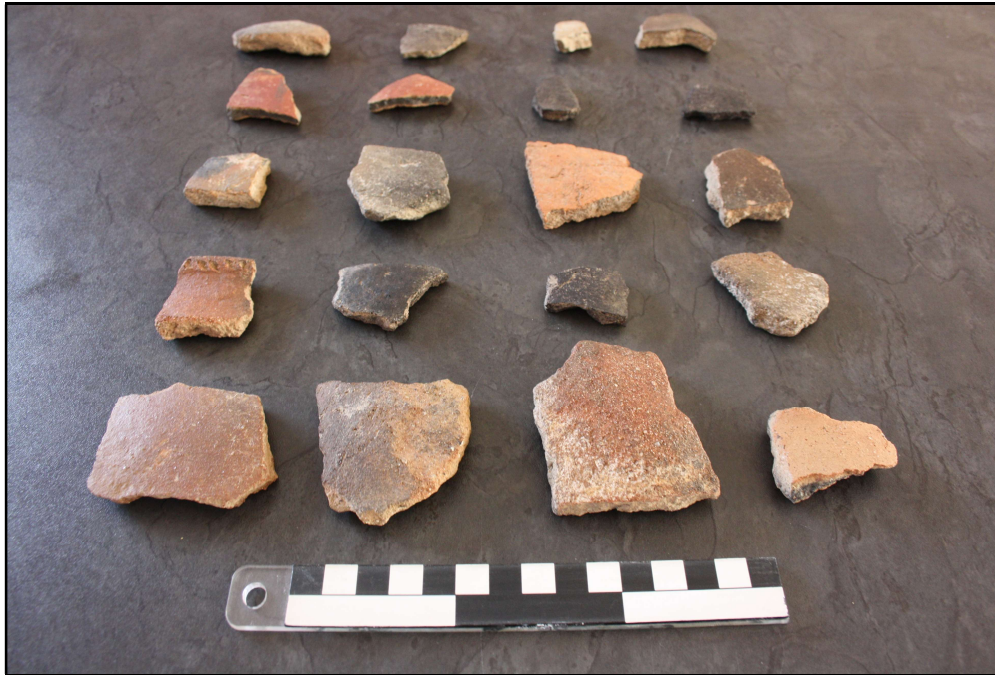
Figure 5: a small representative sample of collected ceramic shards.

perhaps Botswana, dating to between about AD 1300 and 1500. According to the ceramic evidence, in some places Icon incorporated earlier Eiland elements (Huffman 1980, in Press). This phase predates the oral record. Because Eiland cultural remains were also found, this site may add to the evidence of the merging of Eiland and Icon in about the 13 th – 14 th centuries.