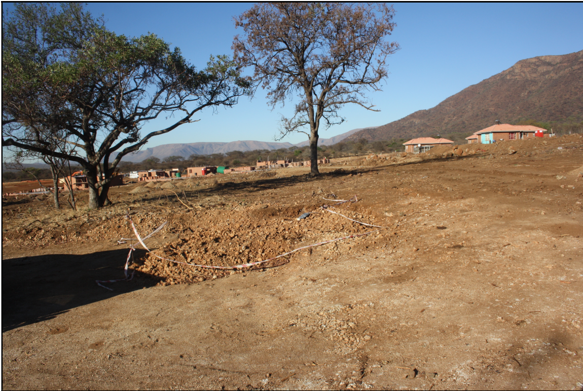
Figure 3: View of the affected site, with newly constructed houses at the background.