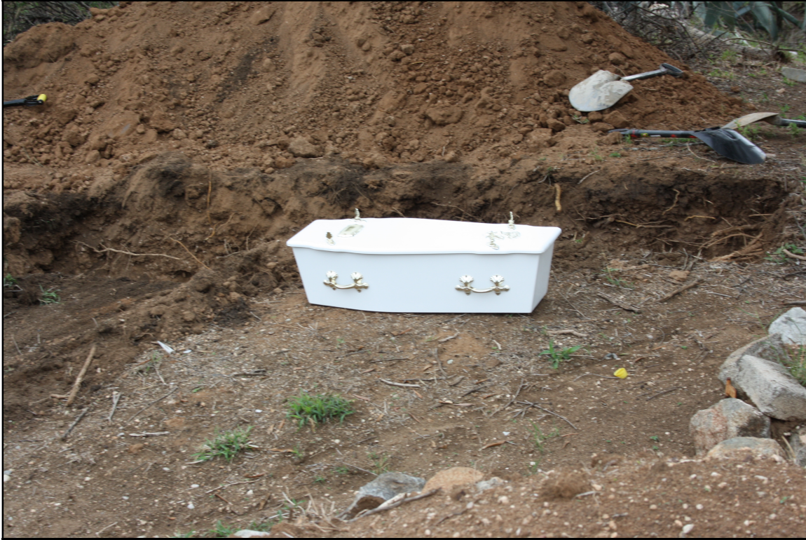
Figure 6: Reburial process with the remains inside the wooden coffins

area has been demarcated and was previously used for reburial of all individual's graves exhumed within the Dehoop dam basin, these individual's original burial grounds were affected by the dam development process. The cemetery site is at global positioning system co-ordinates, South 24°.57' .05.04" and East 29 ° .58.03.08. This concluded the process and the local community member expressed their satisfaction with the proceedings.