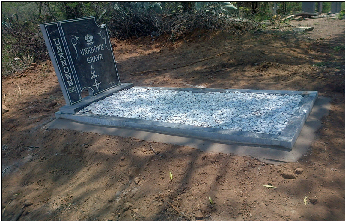
Figure 8: View of the Grave dressings