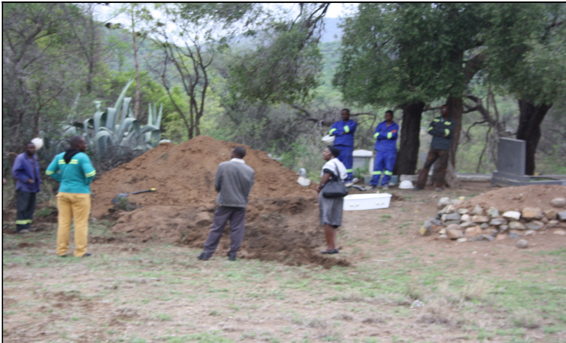
Figure 7: View of the community members who attended the reburial process