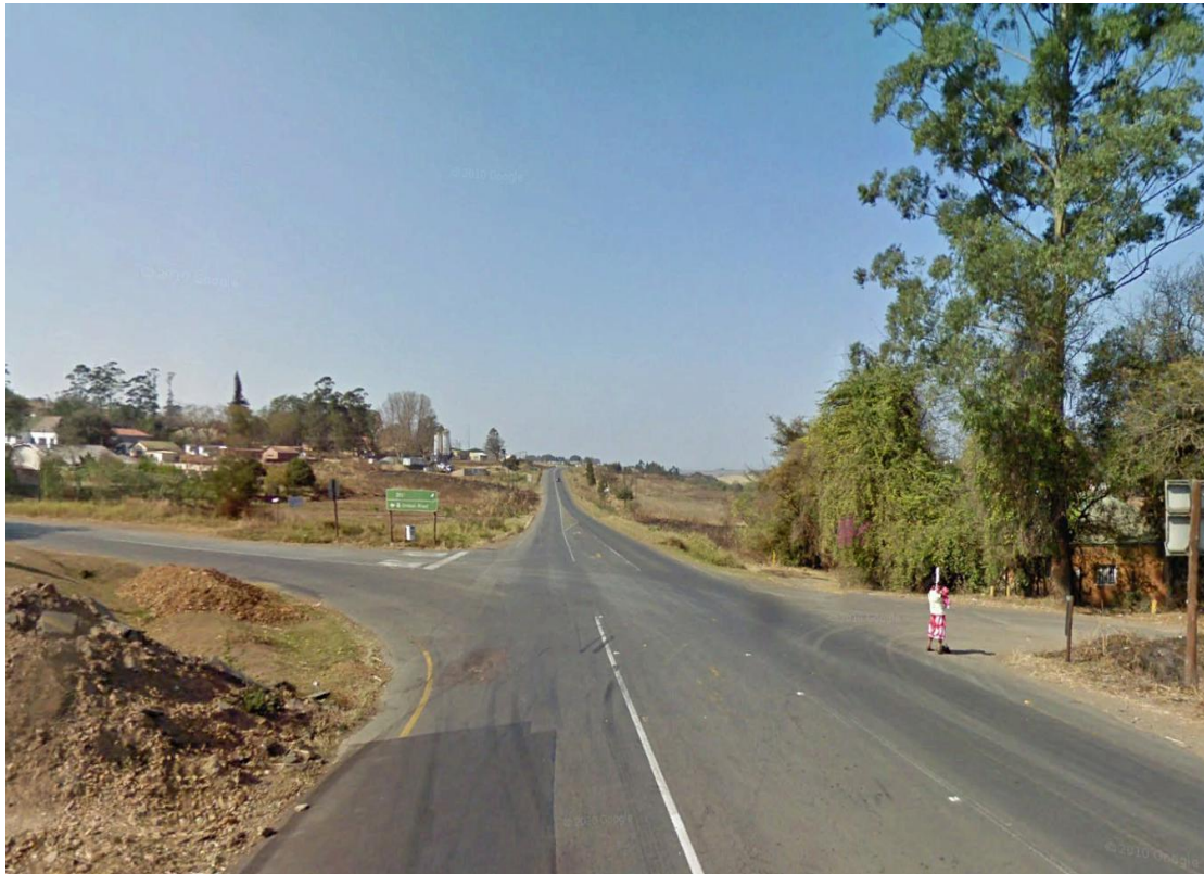
Figure 17 – R603 Provincial Road

View of Provincial Road R603 showing position of possible pipe jack