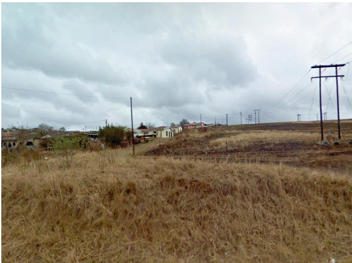
Figure 14 – Farm 881 Portion 5

View of embankment of Mapstone Dam on Farm 881 Portion 5