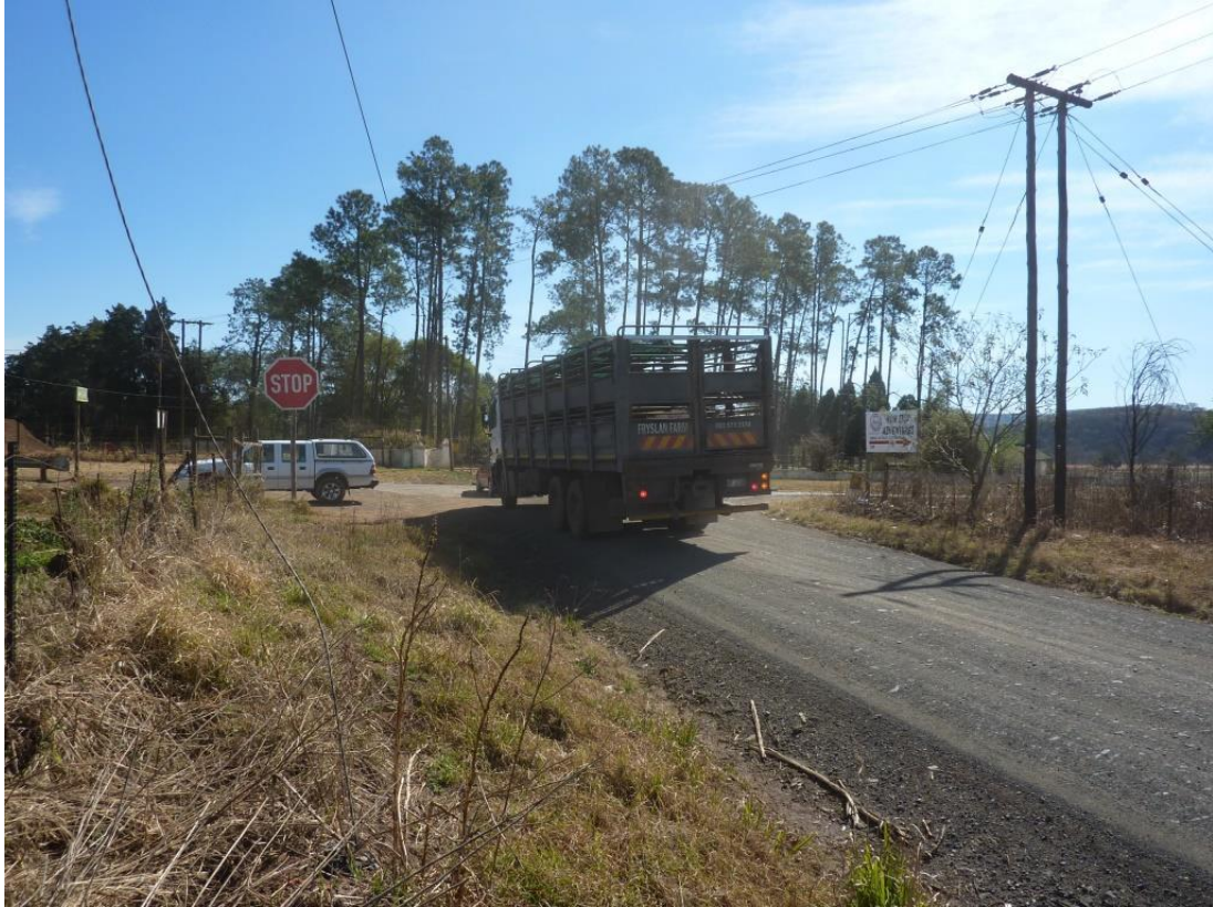
Figure 3 – Intersection of R56 and D360 Roads

View of intersection between Provincial Road R56 and District Road D360