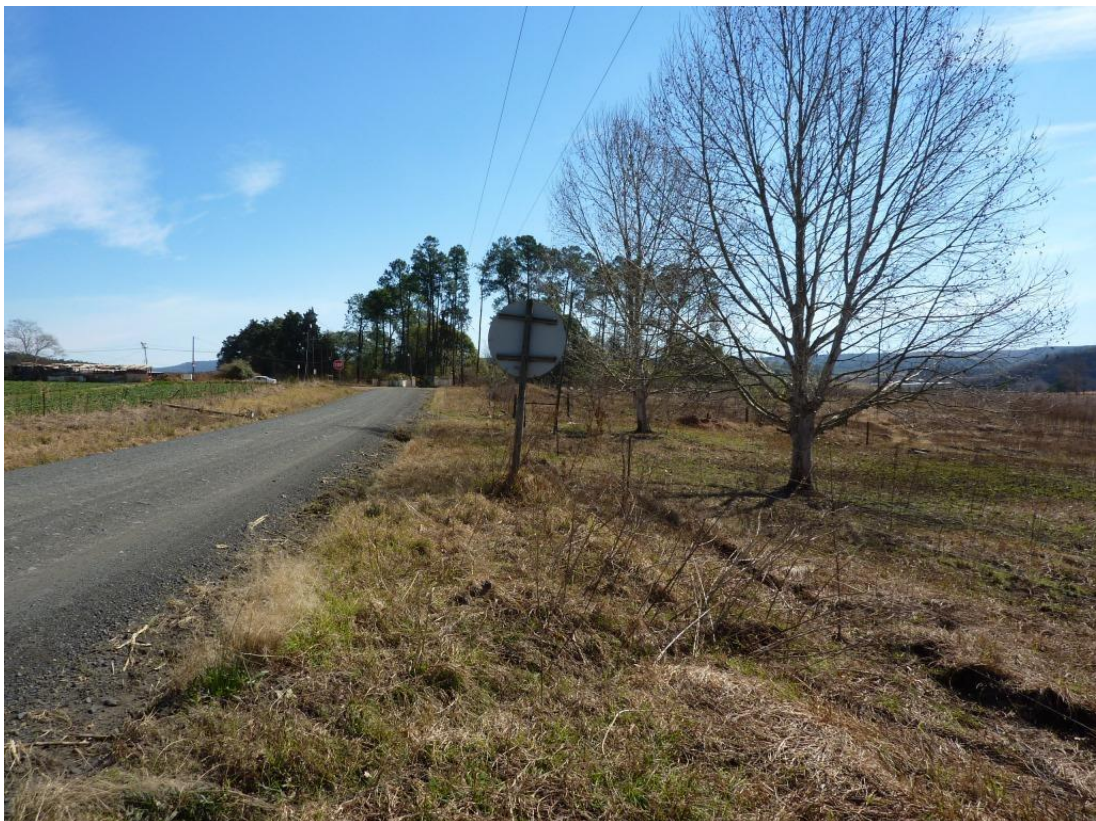
Figure 4 – D360 District Road and Farm 1295 Portion 44 and Portion 26

View of intersection between Provincial Road R56 and District Road D360