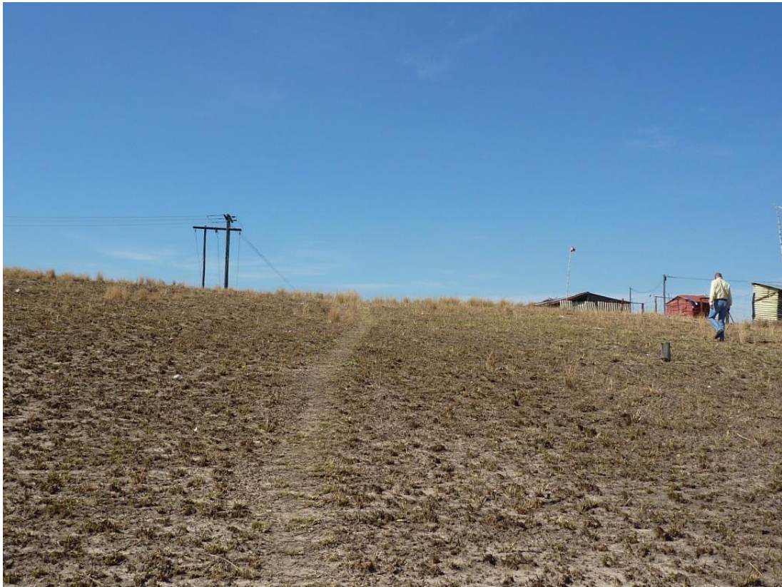
Figure 13 – Farm 881 Portion 5

View of embankment of Mapstone Dam on Farm 881 Portion 5