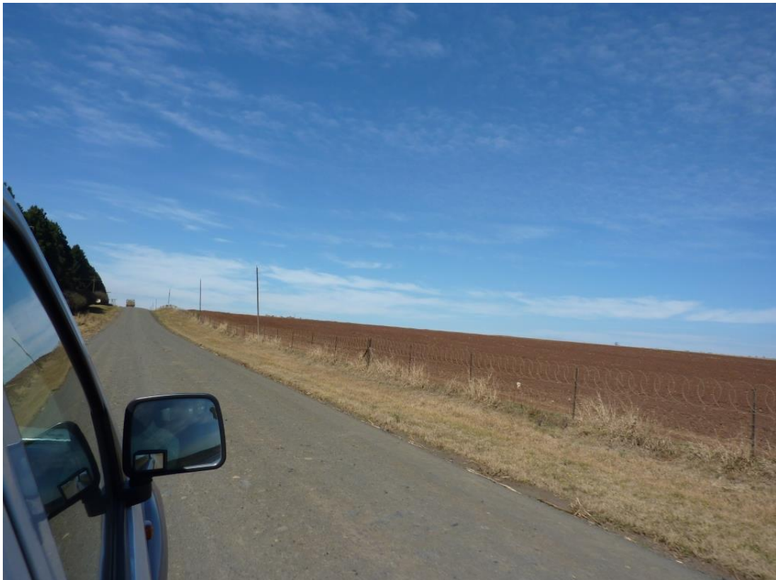
Figure 6 – D360 District Road and Farm 1295 Portion 24

View of District Road D360 with Farm 1295 Portion 44 (Brasfort Park) on the left and Farm 1295 Portion 26 (Brasfort Park) on the right