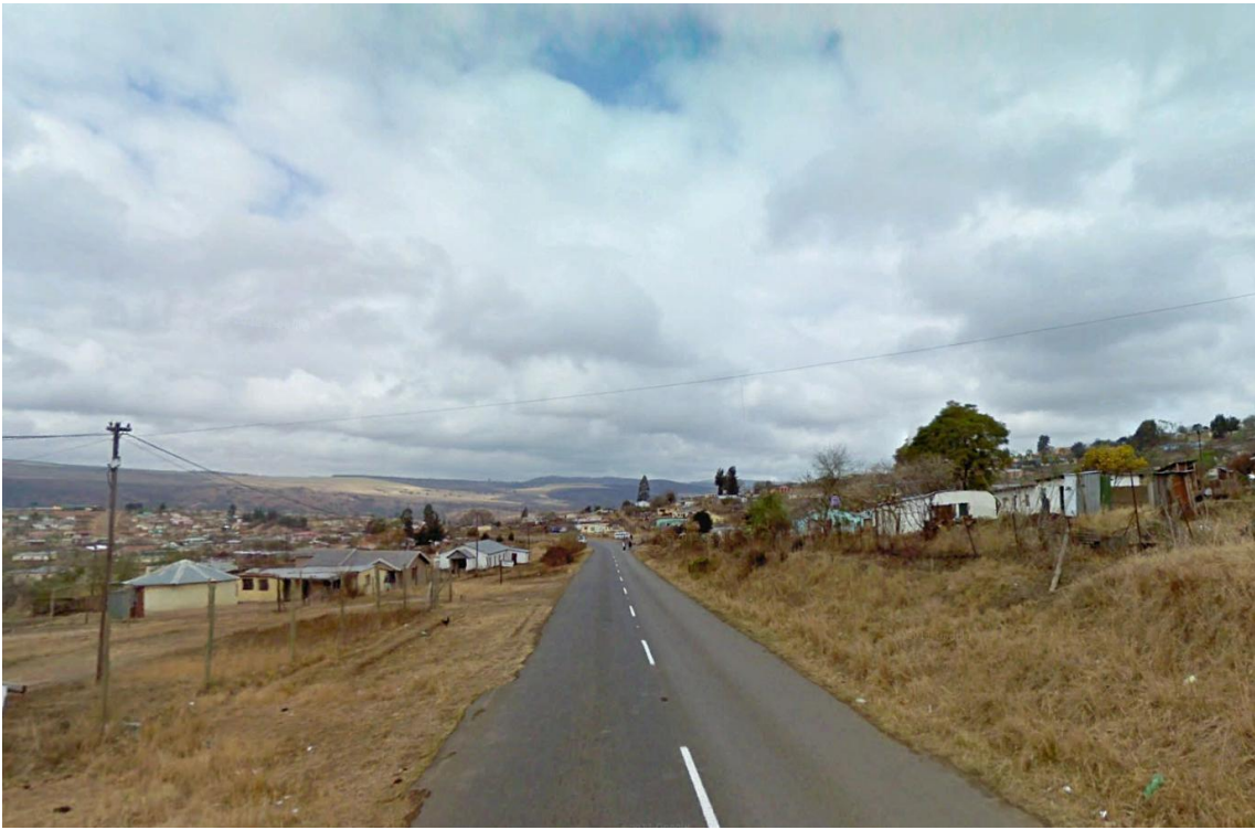
Figure 15 – P117 Provincial Road

View of Provincial Road P117 at proposed pipe crossing