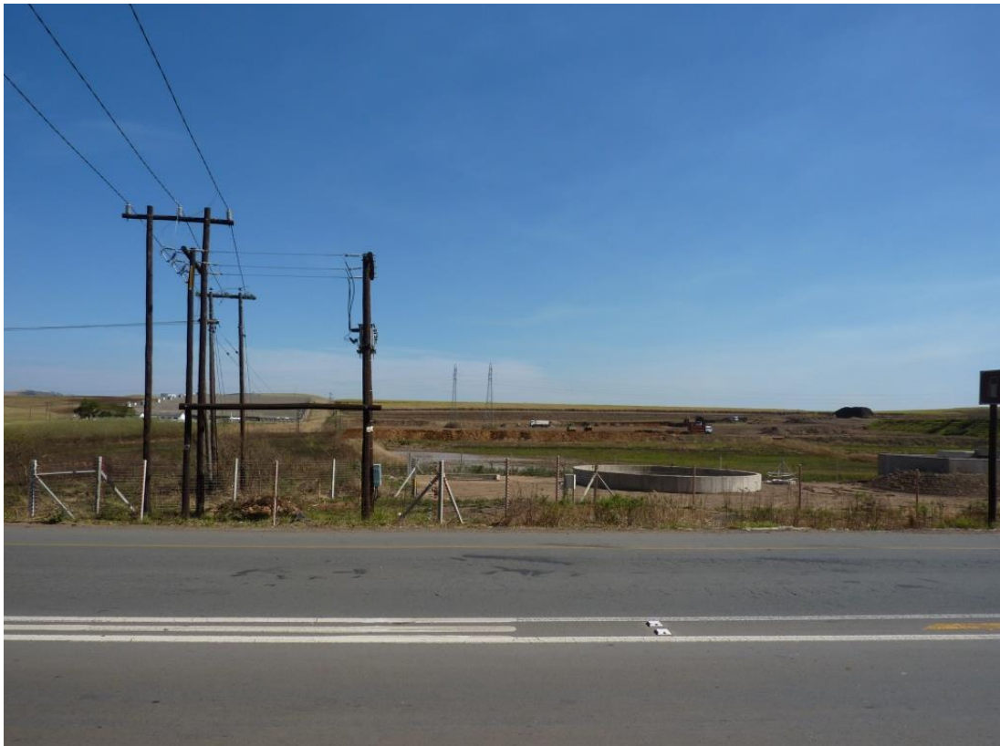
Figure 16 – R603 Provincial Road and Farm 885 Portion 114

View of Provincial Road P117 at proposed pipe crossing