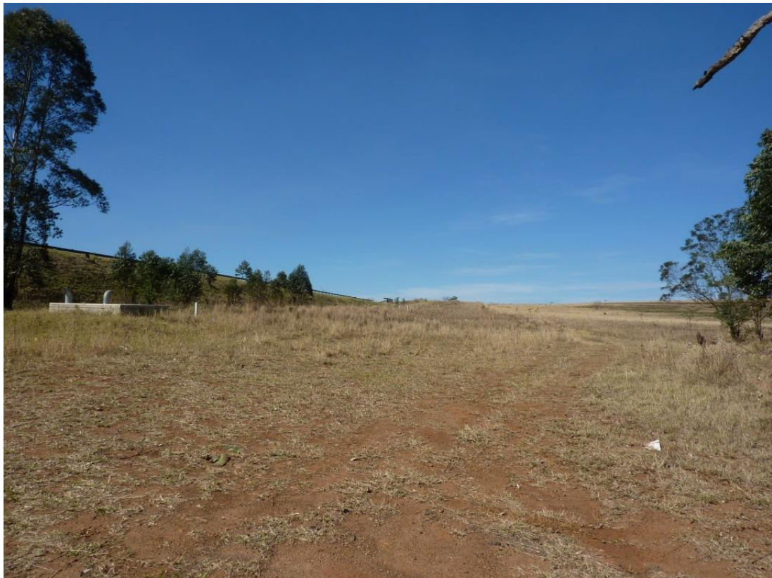
Figure 18 – Tie-in to '57 Pipeline

View of Provincial Road R603 showing position of possible pipe jack