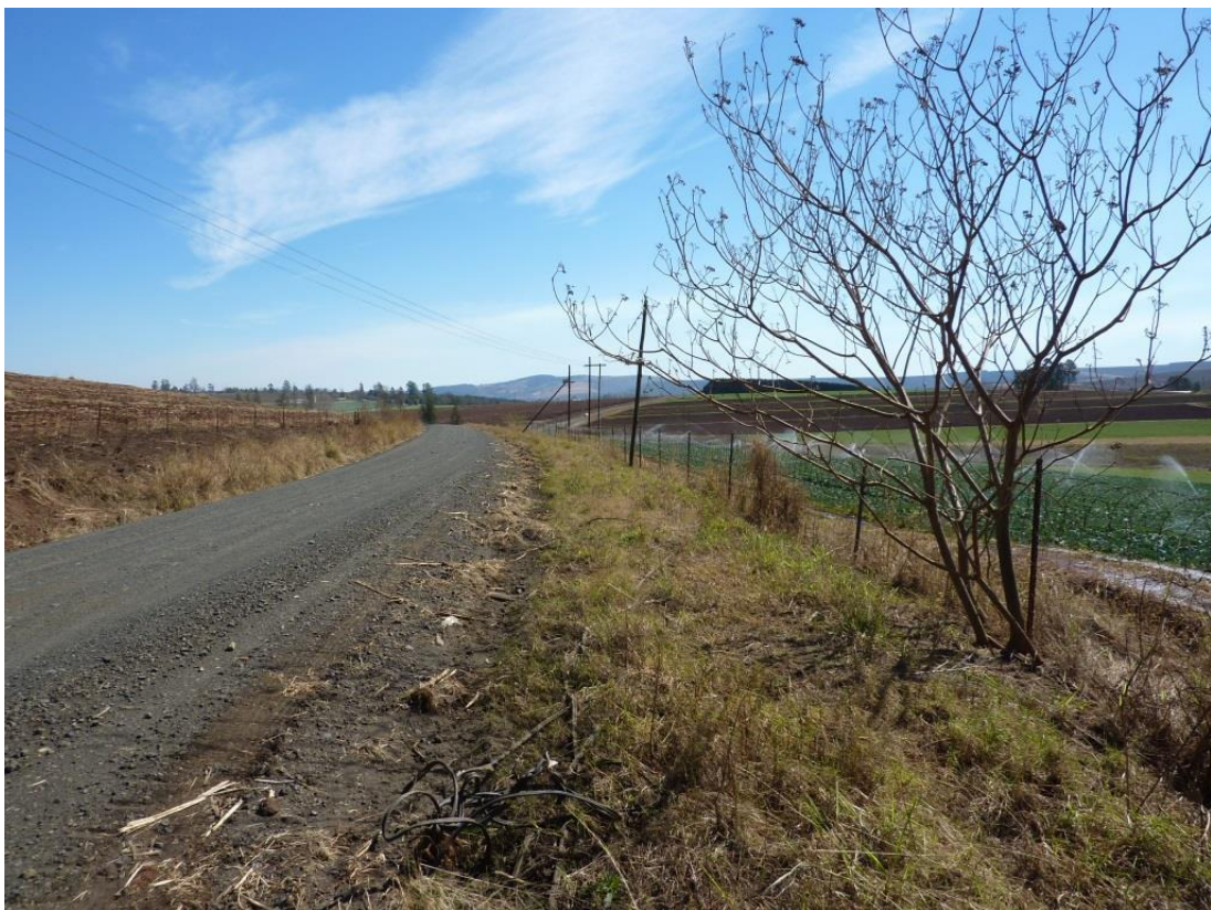
Figure 10 – D360 District Road and Farm 1295 Portion 6

View of District Road D360 with Farm 1295 Portion 20 (Brasfort Park) on the left