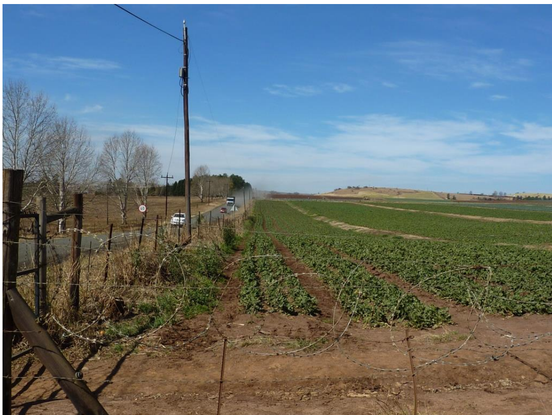
Figure 2 – R56 Provincial Road and Farm 1295 Portion 22

View of the site for the proposed Water Treatment Works on Farm 849 Portion 0 (Nels Rust) in the background and Farm 1295 Portion 22 (Brasfort Park) in the foreground