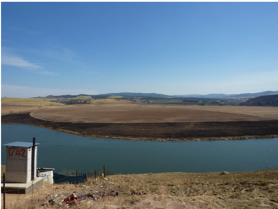
Figure 12 - Mapstone Dam and Farm 1295 Portion 6

View of Mapstone Dam and Farm 1295 Portion 6 from Farm 881 Portion 5