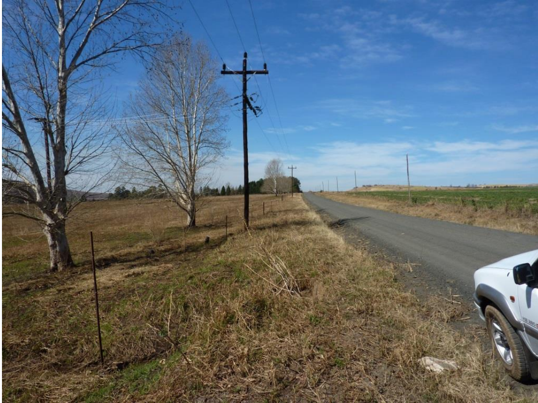
Figure 5 – D360 District Road and Farm 1295 Portion 44 and Portion 26

View of District Road D360 with Farm 1295 Portion 44 (Brasfort Park) on the left and Farm 1295 Portion 26 (Brasfort Park) on the right