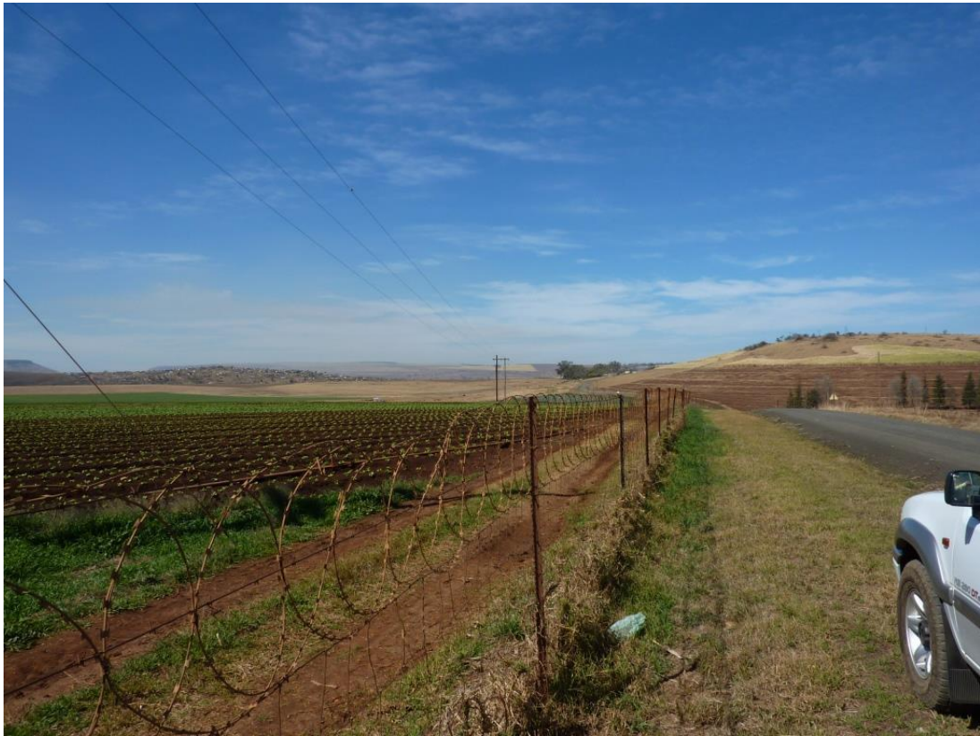
Figure 9 – D360 District Road and Farm 1295 Portion 20

View of District Road D360 with Farm 1295 Portion 20 (Brasfort Park) on the left