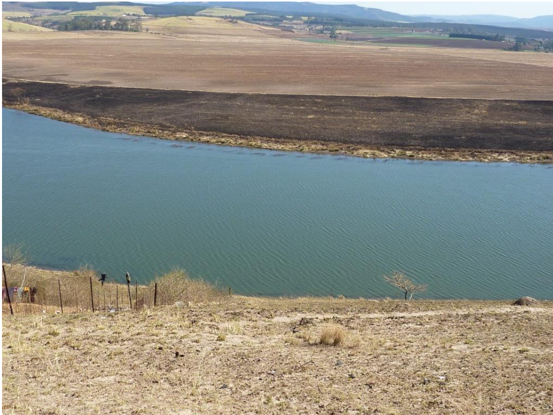
Figure 11 – Mapstone Dam and Farm 1295 Portion 6

View of Mapstone Dam and Farm 1295 Portion 6 from Farm 881 Portion 5