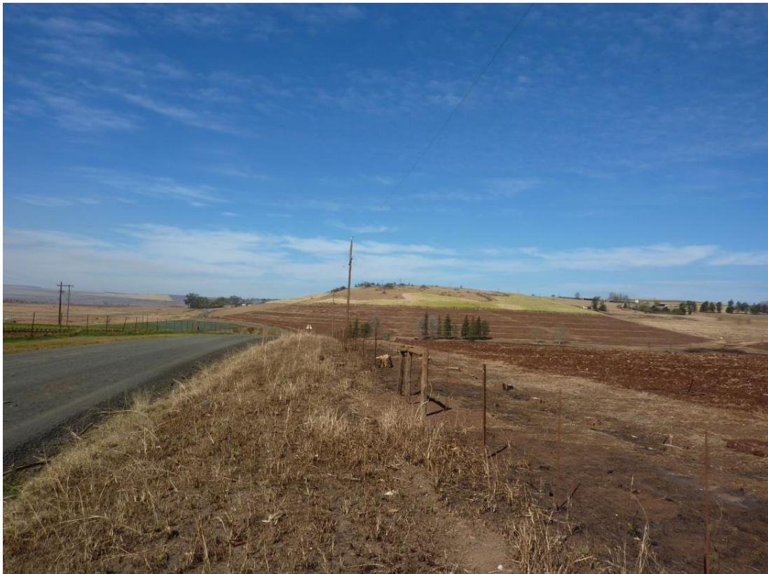
Figure 8 – D360 District Road and Farm 1295 Portion 54

View of District Road D360 with Farm 1295 Portion 24 (Brasfort Park) on the left and Farm 1295 Portion 43 (Brasfort Park) on the right