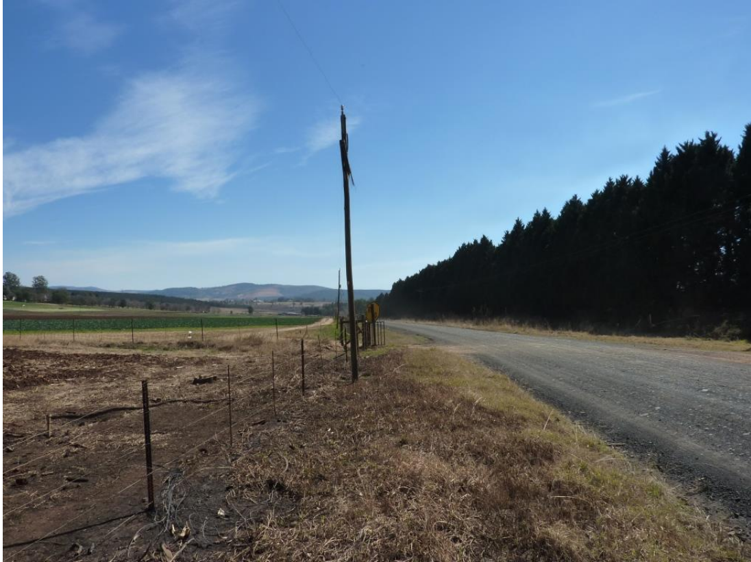
Figure 7 – D360 District Road and Farm 1295 Portion 24

View of District Road D360 with Farm 1295 Portion 24 (Brasfort Park) on the left and Farm 1295 Portion 43 (Brasfort Park) on the right