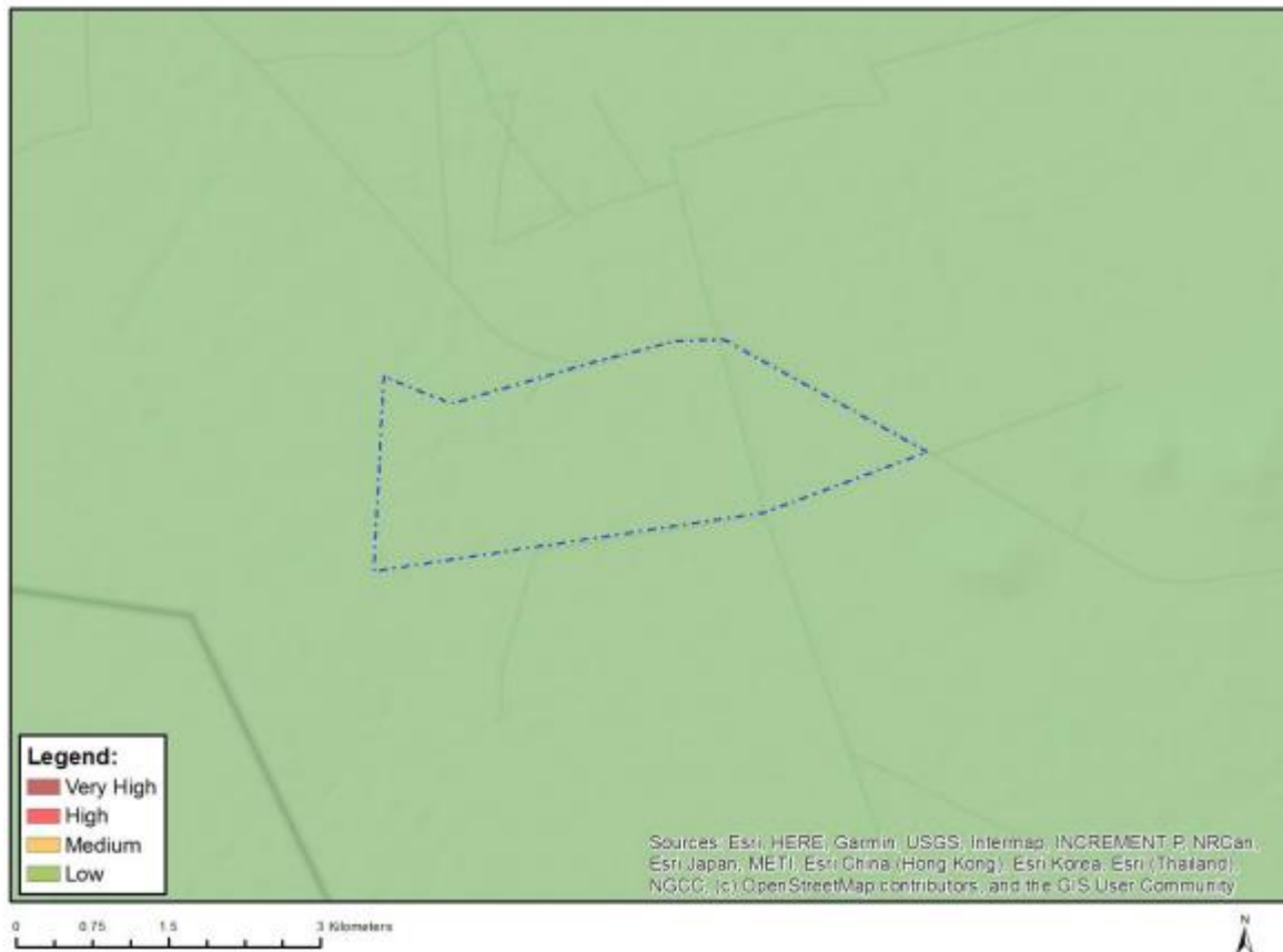
Figure 1.2: Defence theme sensitivity as indicated by the DFFE Screening Tool Report