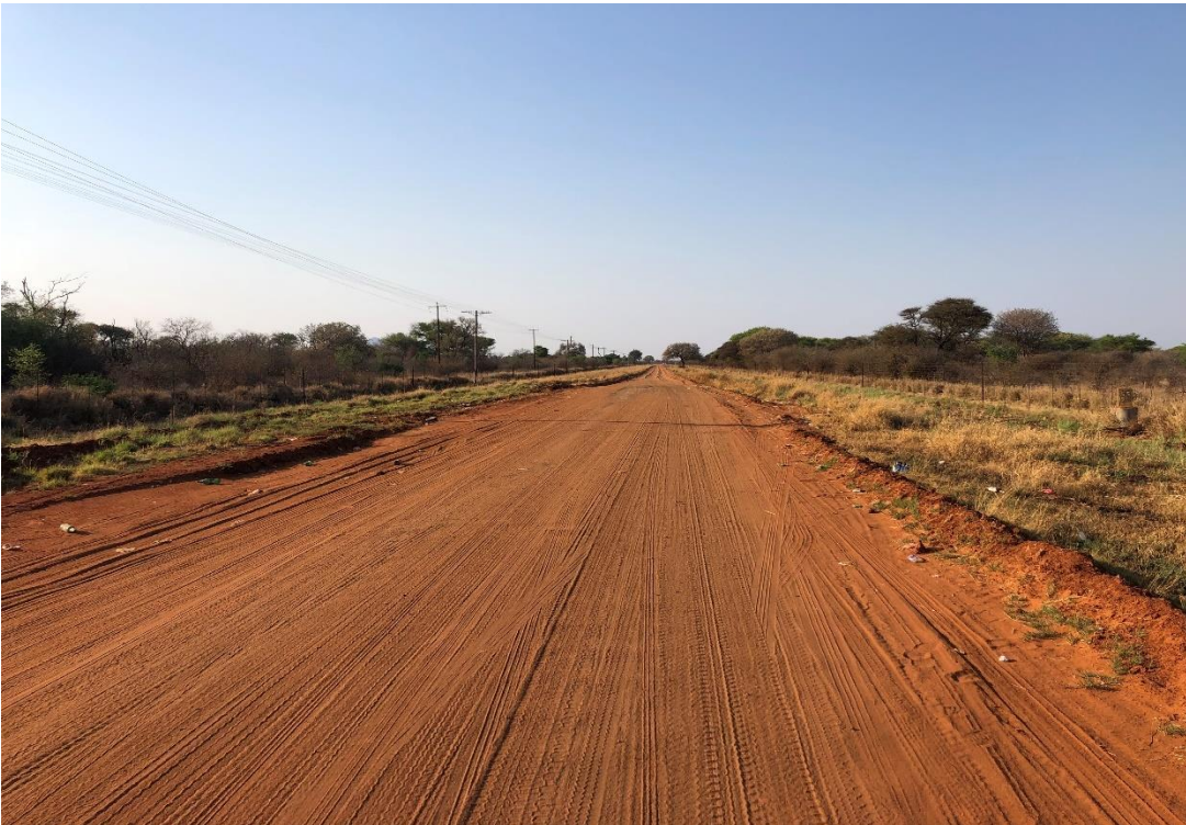
Figure 1.5: Eskom power lines within the PAOI