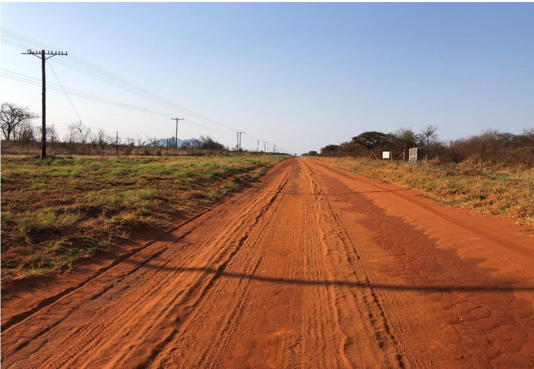
Figure 1.7: Current land use of the PAOI (farm access)