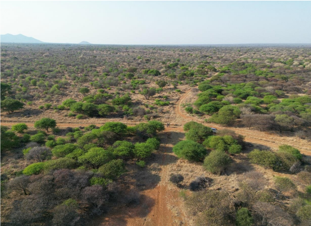
Figure 1.6: Aerial view of the surrounding landscape and existing roads