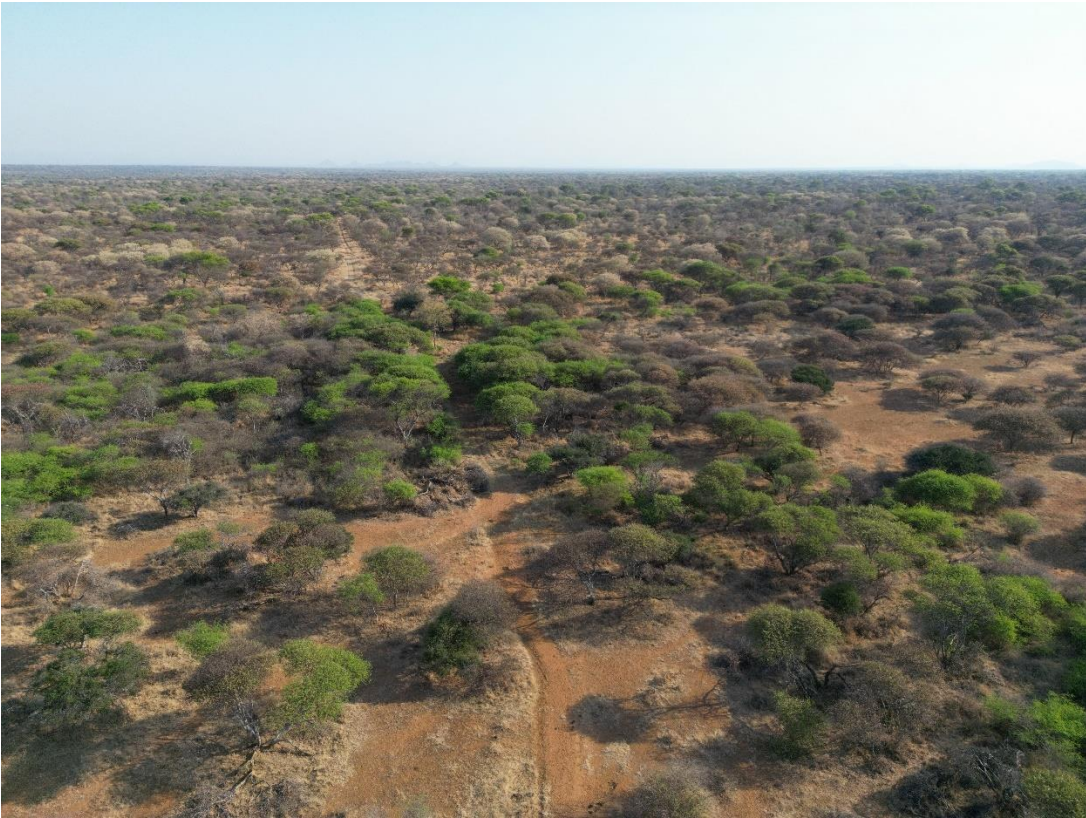
Figure 1.4: Aerial view of the PAOI