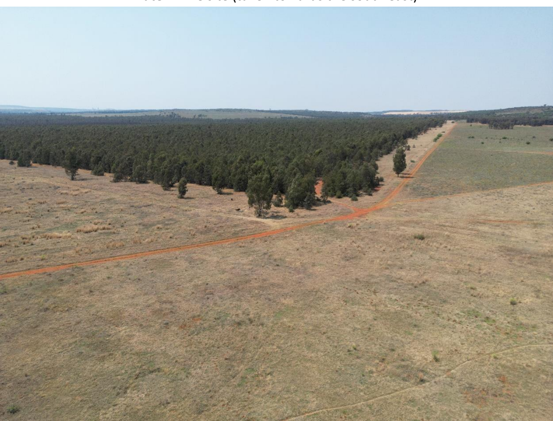
Plate 4: The site (taken towards the south east).