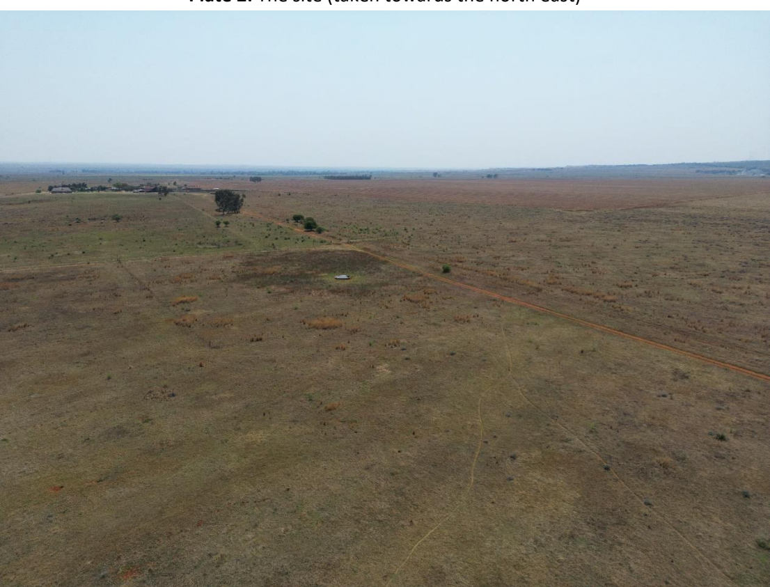
Plate 2: The site (taken towards the north east)