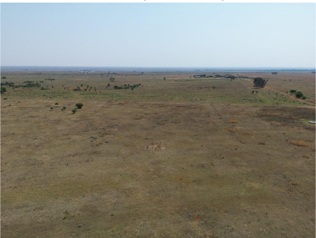
Plate 1: The site (taken towards the north)