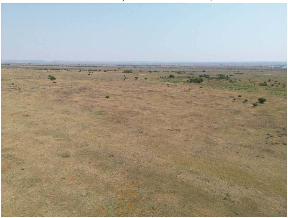
Plate 8: The site (taken towards the north west).